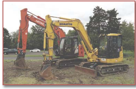
`18 HITACHI ZX135US-6N AND `18 KOMATSU PC88MR-10

1440 COWPATH RD. • HATFIELD, PA 19440 215/361-9099 • Fax: 215/361-9212 www.hunyady.com