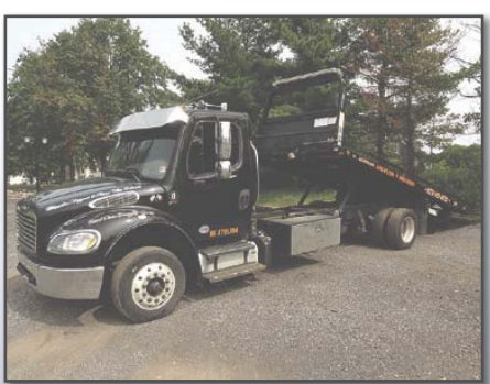
16 FREIGHTLINER BUSINESS CLASS M2-106

capacity, underbody rigging box, aluminum wheels, 8,000 lb front axle, 17,500 Ib rear axle, engine brake, air conditioning, power windows and locks, heated mirrors, and 245/70R19.5 tires. In good condition with good tires. (BB&T)