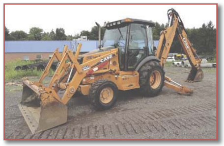
`07 CASE 590 SUPER M 4X4 EXTEND-A-HOE