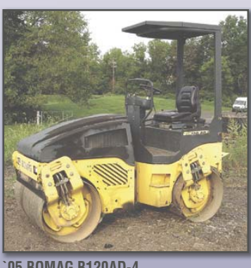
05 BOMAG B120AD-4

2017 HUSQVARNA FS7000D Concrete Saw. s/n 001371443001, powered by Tier 4 Deutz 74HP diesel engine and hydrostatic transmission, equipped with 36" blade capacity and E-Track electronic tracking system. In very good condition. (Meter Reads 237 Hours) (Purchased New) 2004 LEEBOY Model 8816T Crawler Paver, s/n 40755, powered by Cummins 4 cylinder diesel engine and Funk hydrostatic transmission, equipped with Legend 8' - 15'6'' screed, propane heat, slope and grade controls, dual washdown reels, and rubber street pads. In good condition with good pads. (Meter Reads 2,678 Hours) (Screed Vibrator Not Operating)