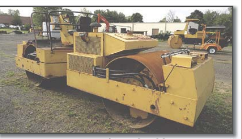
87 INGERSOLL RAND DA48

1987 INGERSOLL RAND Model DA48 Tandem Vibratory Roller, s/n 5288, powered by Detroit diesel engine and hydrostatic transmission, equipped with 65" smooth drums, front and rear spray systems, dual frequency selector and dual drum control. In fair to good condition. (Meter Reads 5,376 Hours)