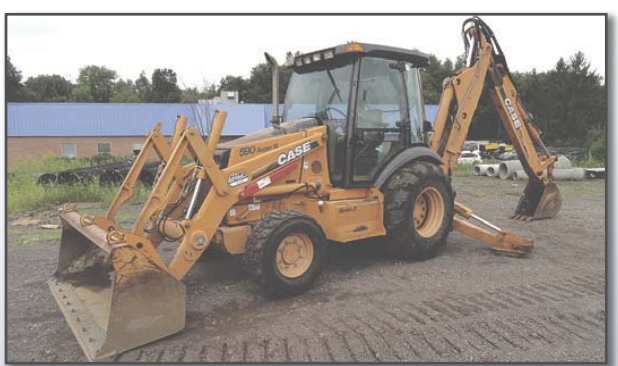
07 CASE 590 SUPER M 4X4 EXTEND-A-HOE

CASE 590/680: NPK C-4C Plate Compactor • CF 42" Digging Bucket • 30" and 12" Digging Buckets