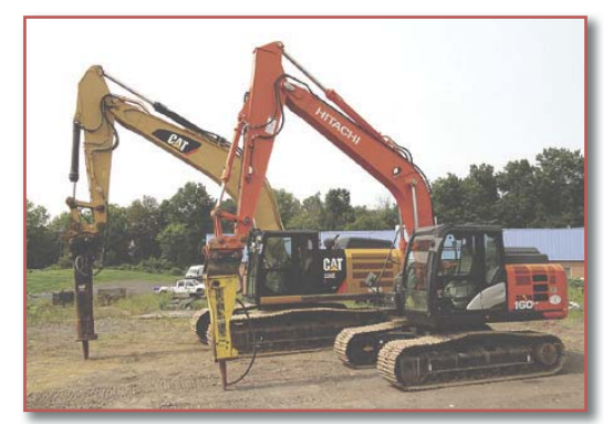
`12 CAT 336EL AND `17 HITACHI ZX160LC-6N (HAMMERS SOLD SEPARATELY)