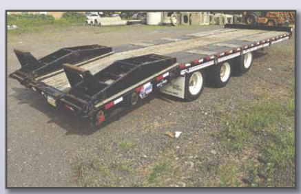
17 EAGER BEAVER 25XPL, 25 TON

1989 EAGER BEAVER Model AP10 Tandem Axle Tag-A-Long Trailer, equipped with 12'x6'6" wooden deck with 3' beavertail and ramps, tiedown rings, electric brakes, pintle tow, 10,000 lb GVWR, and 8-14.5 tires. In fair to good condition with fair to good tires. (Purchased New)