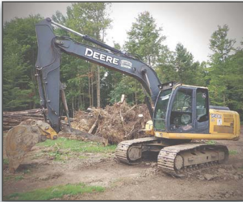
08 JOHN DEERE 160DLC

2008 JOHN DEERE Model 160DLC Hydraulic Excavator , s/n FF160DX050097, powered by John Deere diesel engine and hydraulic drive, equipped with 10'2" dipper stick, WB 42" digging bucket with side cutters, Rockland 12" hydraulic thumb, pattern changer, CF hydraulic coupler, auxiliary hydraulics, enclosed ROPS cab with heat and air conditioning, heated seat, and 23.5" TBG pads. In good condition with good undercarriage. (Purchased New)