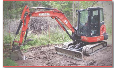
'13 KUBOTA KX040-4