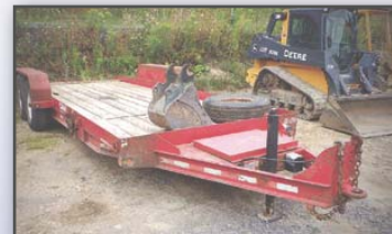
'16 CAM 4 TON

2016 CAM Superline 4 Ton Tandem Axle Tilt Deck Trailer , equipped with 4' stationary front deck, 15' rear tilt deck, 81" deck width, 102" overall width, 9,990# GVWR, and 235/80R16 tires. In good condition with good tires.