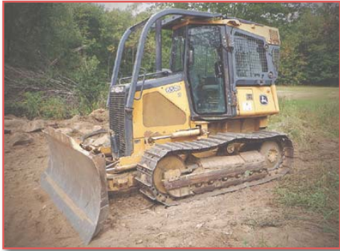
'06 JOHN DEERE 650JLT

PRE-SORTED FIRST CLASS MAIL US POSTAGE PAID UPPER DARBY, PA PERMIT #45