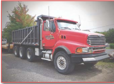
'05 STERLING LT9500

1440 COWPATH RD. • HATFIELD, PA 19440 215/361-9099 • Fax: 215/361-9212 www.hunyady.com