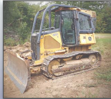
06 JOHN DEERE 650JLT

2006 JOHN DEERE Model 650JLT Crawler Tractor , s/n T0650JX130517, powered by John Deere 6 cylinder diesel engine and hydrostatic transmission, equipped with 6-way straight blade, tow pin, enclosed ROPS cab with forestry package, heat and air conditioning, rock guards, and 18" SBG pads. In good condition with good undercarriage. (Purchased New)