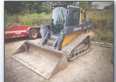
15 JOHN DEERE 323E

2015 JOHN DEERE Model 323E Crawler Skid Steer Loader , s/n 277878, powered by 4 cylinder diesel engine and hydrostatic transmission, equipped with hydraulic coupler, high flow auxiliary hydraulics, 84" general purpose loader bucket with bolt-on cutting edge, rear side counterweights, enclosed ROPS cab with heat and air conditioning, and 16" rubber tracks. In good condition with good tracks. (1,586 Hours) (Purchased New)