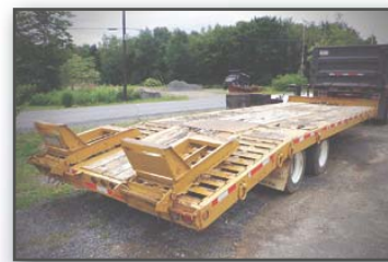
'11 EAGER BEAVER 20XPT

2011 EAGER BEAVER Model 20XPT, 20 Ton Tandem Axle Tag-A-Long Trailer , equipped with 21' level deck, 6' beavertail, 4' ramps, 102" width, spring suspension, chain dogs, manual front stabilizers, air brakes, and 215/75R17.5 tires. In good condition with good tires.