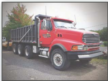
'05 STERLING LT9500

2005 STERLING Model LT9500 Tri-Axle Dump Truck , powered by Detroit Series 60, 500HP diesel engine and Fuller 13 speed transmission, equipped with 19' steel dump body with 2-way gate and electric tarp, 46,000# rears, 18,000# front and 20,000# lift axles, block/beam suspension, tow package with air, aluminum wheels, 2-stage engine brake, power