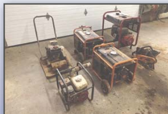
PIPE AND CONTRACTORS TOOLS

MCELROY 28 Portable Fusion Machine, with accessories (00,691 Hours) • (2) MCELROY #14 Pitbull Fusion Machines • FRIATEC FRIMET Electro Fusion Machine • SAWER 200C, 8-14" Pipe Beveler • H&M 12" Pipe Beveler • (2) Pipe/Roller Stands • DEMTECH Seaming Machine, with heat gun • Pipe Threaders and Cutters • (16) Assorted Pipe Wrenches • SPY Pipe Inspection Tool • PARTNER K750 Demo Saw • COLEMAN 6500H Portable Generator • (2) GENERAC GP3250 Portable Generators • 2" Centrifugal Pump • (1 Pallet) 2" Discharge Hose • Fiberglass and Aluminum Ladders • Contractors Kit