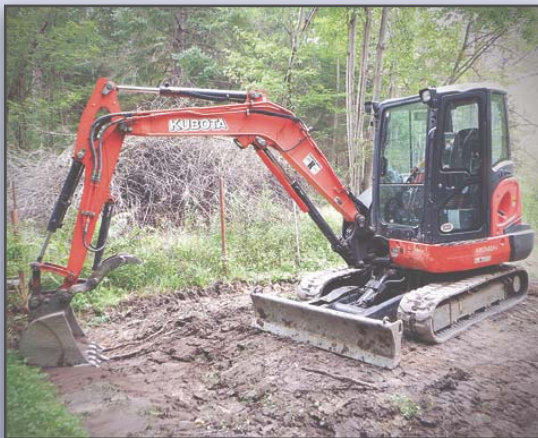
13 KUBOTA KX040-4

2013 KUBOTA Model KX040-4 Mini Hydraulic Excavator , s/n 20636, powered by Kubota D1803-CR-T-EF03 diesel engine and hydraulic drive, equipped with 5'3" dipper stick, 24" digging bucket, hydraulic thumb, swing boom, pattern changer, 4-way 68" backfill blade, auxiliary hydraulics, enclosed ROPS cab with heat and air conditioning, and 14" rubber tracks. In good condition with good tracks. (2,692 Hours) (Purchased New)