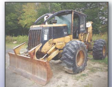
98 CAT 515

1998 CATERPILLAR Model 515 Grapple Log Skidder , s/n 4LR00569, powered by Cat 3304 diesel engine and powershift transmission, equipped with Esco 12M log grapple, 8'9" stacking blade, enclosed ROPS cab with sweeps and window guards, and 23.1x26 foam filled tires. In good condition with fair to good tires. (Less than 100 hours on rebuilt engine by Cleveland Brothers)