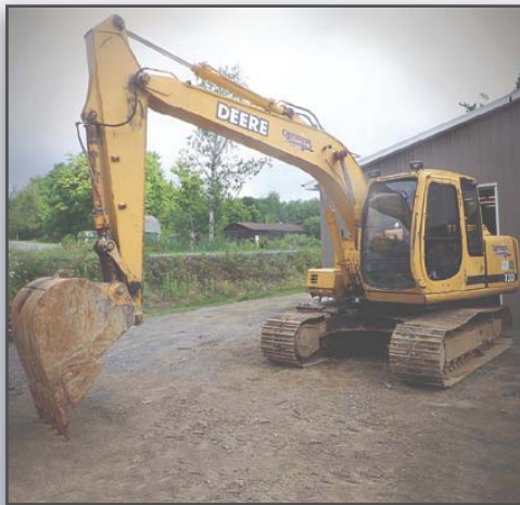
00 JOHN DEERE 120

2000 JOHN DEERE Model 120 Hydraulic Excavator , s/n P00120X031658, powered by John Deere diesel engine and hydraulic drive, equipped with 8'3" dipper stick, 36" digging bucket with side cutters, 3rd valve (unplumbed), enclosed ROPS cab with heat and air conditioning, and 23.5" TBG pads. In fair to good condition with fair undercarriage. (Purchased New)