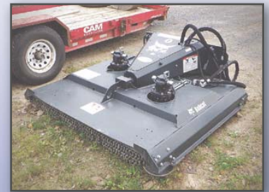
19 BOBCAT 72 INCH BRUSH MOWER

2019 BOBCAT Model 72, 72" Brush Mower , s/n AYYV06096 In very good condition • 48" Fork Attachment