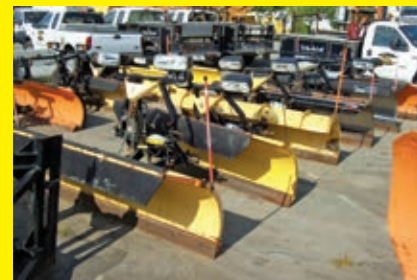
(6) FISHER MINUTE MOUNT 2 9FT. POWER ANGLE PLOW steel and stainless steel.