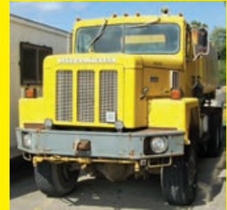
1985 INTERNATIONAL PAYSTAR 5000 VN:A14721 6x6, powered by 6 cylinder diesel engine, equipped with automatic transmission, power steering, tank w/ 4 cylinder diesel engine driven pump, hose reel, 385/65R22.5 tires, tandem axle.