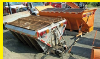
(8) STEEL & STAINLESS STEEL SAND SPREADER steel and stainless steel.