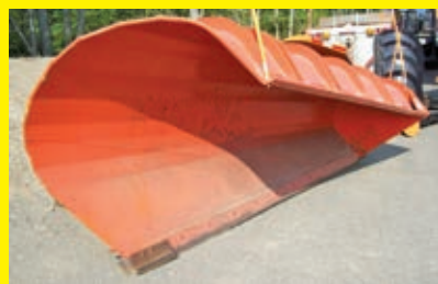
VIKING 13.5FT. FIXED ANGLE PLOW