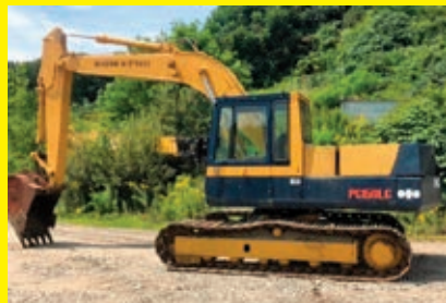
KOMATSU PC150LC-3 SN:3503 powered by Cummins diesel engine, equipped with Cab, air, digging bucket, long undercarriage.