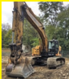
(2) CAT 325CLR powered by Cat diesel engine, equipped with Cab, air, heat, reach boom, reduced tail swing, digging bucket, long undercarriage.