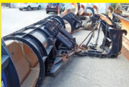
12FT. POWER ANGLE PLOW with Cat IT couplers. 12FT. POWER ANGLE PLOW