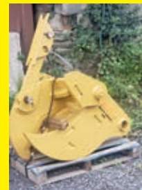
BODINE 80/80mm , to fit Cat 320/325, Komatsu PC200/250 and similar size machines.