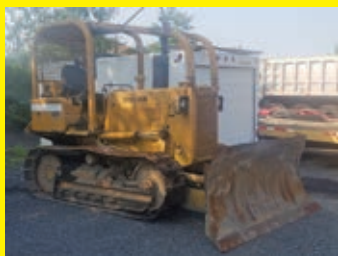
DRESSER TD8G SN:637 powered by Cummins diesel engine, equipped with OROPS, sweeps, rear screen, 6 way blade, long track frame.