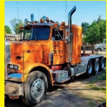
1986 PETERBILT 359 VN:N/A powered by Cat 3406B diesel engine, 425hp, equipped with 18 speed transmission, power steering, 3-line wet system, 36in. Sleeper, dual exhaust, 20,000lb pusher, 44,000lb rears, Hendrickson suspension, full fenders, 11R24.5 tires, triaxle.