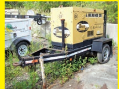
AIRMAN SDG25S SN:133A30185 powered by Isuzu diesel engine, equipped with 25KW, trailer mounted.