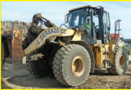
CAT 950G powered by Cat diesel engine, equipped with EROPS, air, heat, 3rd valve hydraulics, quick coupler, GP bucket.