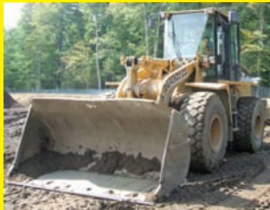
CAT 938G powered by Cat diesel engine, equipped with EROPS, air, heat, 3rd valve hydraulics, quick coupler, GP bucket.