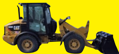
UNUSED CAT 906M powered by Cat C3.3B diesel engine, equipped with EROPS, air, hydraulic quick coupler, GP bucket. Forks Sell Separately.