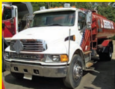
2002 STERLING M8500 VN:J51122 powered by Mercedes MBE900 diesel engine, equipped with automatic transmission, power steering, Boston Tank with ticket printer, 11R22.5 tires, dual wheel single axle.