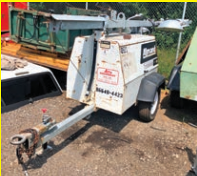
ALLMAND NLPROC1 SN:2799PR008 powered by diesel engine, equipped with 4-1,000 watt lightbulbs, trailer mounted.