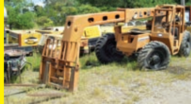
LULL 6K-37 SN:17215 4x4, powered by John Deere diesel engine, equipped with OROPS, 6,000lb lift capacity, 37ft. Reach height, 18.00-24 tires.