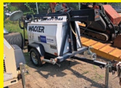
2010 WACKER LTC4L SN:5771161 powered by diesel engine, equipped with 4-1,000 watt lightbulbs, trailer mounted.