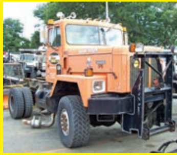
1987 INTERNATIONAL PAYSTAR 5000 VN:N/A 4x4, powered by diesel engine, equipped with Road Ranger diesel engine, power steering, 445/65R22.5 tires, front plow frame - no piston, dual wheel single axle.