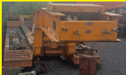
1988 WITZCO RG50 VN:61214 equipped with 50 ton capacity, 22ft. Well, hydraulic detach, spring suspension, new rubber, triaxle.