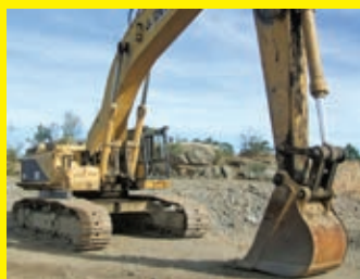
CAT 375L powered by Cat diesel engine, equipped with Cab, air, heat, reach boom, digging bucket, long undercarriage.