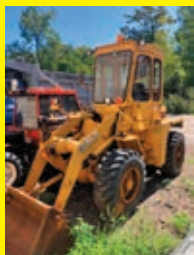
MITSUBISHI WS400 SN:3W100530 powered by diesel engine, equipped with EROPS, 1 yard GP bucket.