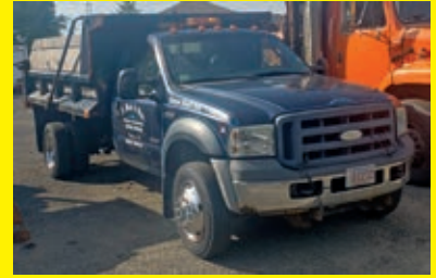
2003 FORD F550XL VN:199939 powered by 7.3L diesel engine, equipped with automatic transmission, power steering, dump body, central hydraulics, hydraulic Fisher plow, 19.5 tires, dual wheel single axle.