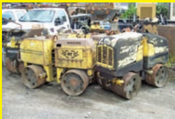
(5) WACKER powered by diesel engine, equipped with padsfoot drum, vibratory drum, double drum, drum drive.