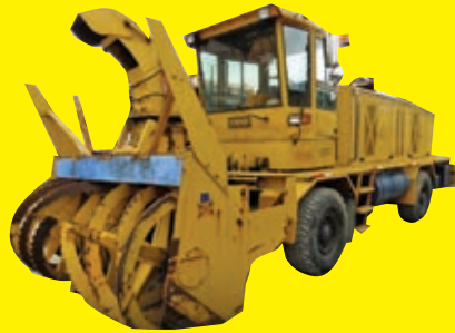
SCHMIDT/ WASHAU SN:611621 powered by Cummins front & rear diesel engine, equipped with all wheel steering, hydraulic truck loading chute.