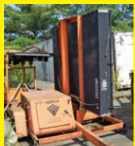
DOT-SIGN CHANGEABLE MESSAGE BOARD SN:513307 single axle.