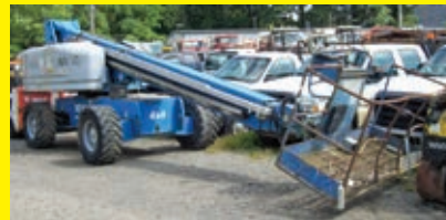
GENIE S60 SN:7276 4x4, powered by Deutz diesel engine, equipped with 60ft. Platform height, straight boom, 500lb lift capacity, IN385/65D19.5 tires