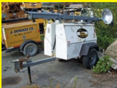
ALLMAND powered by diesel engine, equipped with 4-1,000 watt lightbulbs, 6KW, trailer mounted.