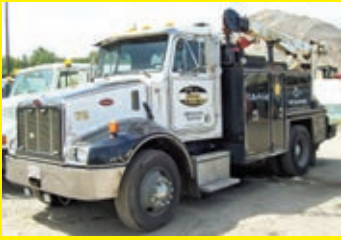
2004 PETERBILT 330 VN:835261 powered by Cat C7 diesel engine, equipped with Eaton Mid Range 6 speed transmission, Maintainer body with crane, Lincoln Ranger 305G welder, air compressor, covered body, 10R22.5 tires, dual wheel single axle.