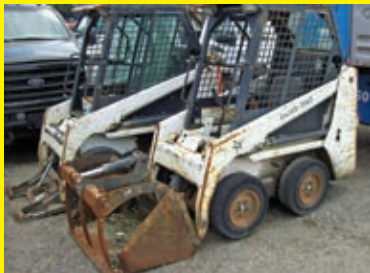
BOBCAT 463 powered by diesel engine, equipped with rollage, auxiliary hydraulics, mechanical quick coupler, hydraulic clamping bucket. BOBCAT 463 Parts machine.