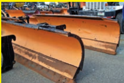
(2) 13FT. POWER ANGLE PLOW with Cat IT couplers.