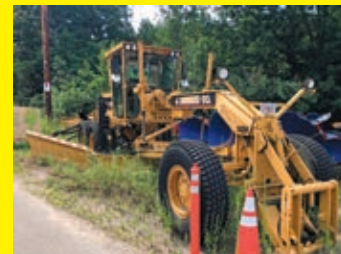
CAT 140H SN:2ZK00191 powered by Cat diesel engine, equipped with EROPS, moldboard, moldboard, hydraulic sideshift, TIP control, front plow, wing plow.