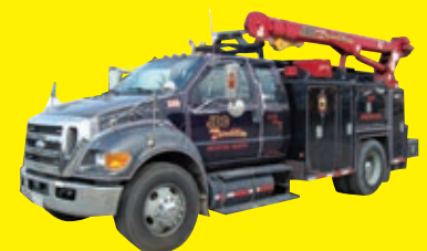
2008 FORD F750 VN:691374 powered by Cat diesel engine, equipped with automatic transmission, power steering, super cab, Maintainer body with 10000 Series crane, air compressor, covered body, 11R22.5 tires, dual wheel single axle.