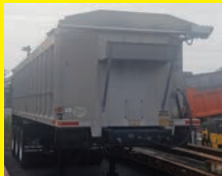
1983 DORSEY VN:15928 equipped with 32ft. Aluminum dump body, 2-way gate, electric tarp, 60in. Sides, new 11R24.5 tires, air lift third axle, triaxle.