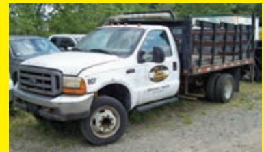
2000 FORD F450XL VN:11580 powered by diesel engine, equipped with automatic transmission, power steering, stake body, dual wheel single axle.