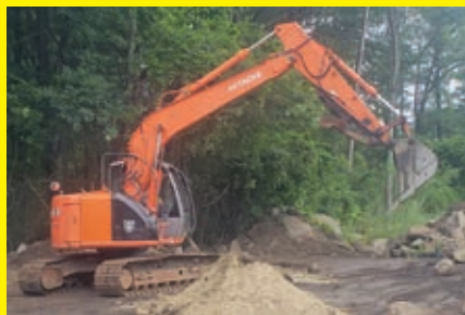
HITACHI ZX135USZTS SN:7222 powered by diesel engine, equipped with Cab, air, heat, zero tail swing, 30in. Digging bucket w/ hydraulic thumb.