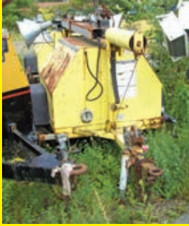
WACKER VN:B000260 powered by diesel engine, equipped with 4-1,000 watt lightbulbs, 6KW, trailer mounted.