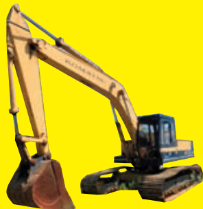
KOMATSU PC220LC-2 SN:11999 powered by Cummins diesel engine, equipped with Cab, air, digging bucket, long undercarriage.