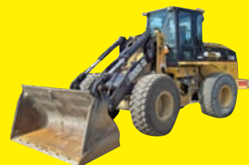
CAT IT38G SN:7BS01208 powered by Cat 3126 diesel engine, equipped with EROPS, air, IT arrangement, ride control, 3rd valve hydraulics, hydraulic quick coupler, GP bucket w/ BOCE, 20.5R25 rubber.