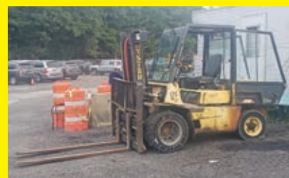
HYSTER H80XL SN:6625S powered by Perkins diesel engine, equipped with EROPS, heat, 12,000lb lift capacity, 3-stage mast, hydraulic sliding forks, 2,418 hours.