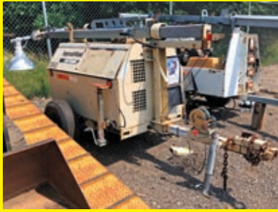
INGERSOLL RAND SN:343319UB0789 powered by diesel engine, equipped with 4-1,000 watt lightbulbs, trailer mounted.