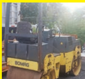
BOMAG BW100AD-3 SN:10547 powered by Deutz diesel engine, equipped with ROPS, 27.6in. smooth drum, double drum, vibratory drum, drum drive, water system.