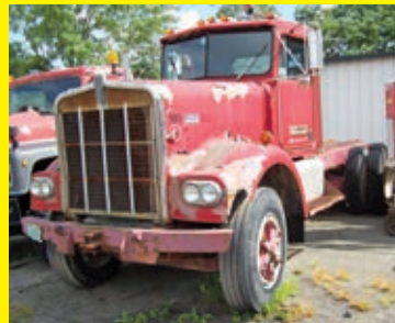
1980 KENWORTH W900 VN:N/A powered by GM 6V92TT diesel engine, equipped with To955ALL transmission, 11R24.5 tires, tandem axle.