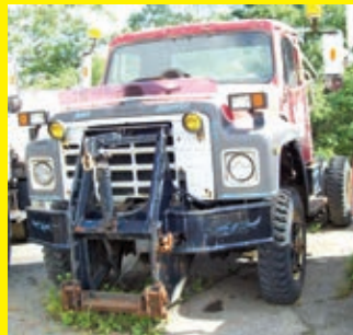
1982 INTERNATIONAL 1824 VN:B14231 4x4, powered by gas engine, equipped with front plow frame, dual wheel single axle.