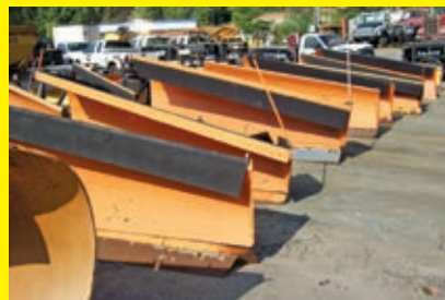
(9) 11FT. POWER FIXED ANGLE PLOW truck mount.