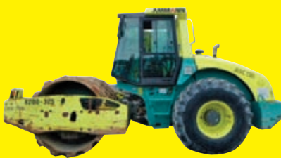
2012 AMMANN ASC130 SN:2943057 powered by Cummins diesel engine, equipped with EROPS, air, heat, 84in. Smooth drum, vibratory drum, drum drive.