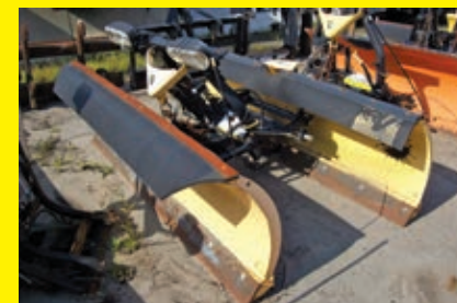
(3) FISHER MINUTE MOUNT 2 8FT. POWER ANGLE PLOW