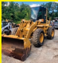
KOMATSU WA180 SN:A75011 powered by Cummins diesel engine, equipped with EROPS, GP bucket.