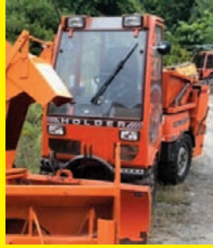
HOLDER C240 SN:20200904 powered by Kubota diesel engine, equipped with power angle plow, hydraulic sander, snow blower, dump bed, 583 hours.