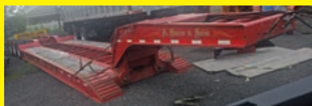
2002 TALBERT VN:20736 equipped with 50 ton capacity, 26ft. Well, hydraulic detach, air ride suspension, 22.5 low pro rubber, air lift third axle, triaxle.