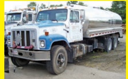
1986 INTERNATIONAL F2574 VN:A67729 powered by Cummins diesel engine, equipped with power steering, stainless steel tank, 44,000lb rears, 11R22.5 tires, tandem axle.