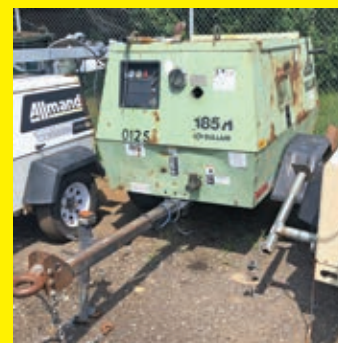
SULLAIR 185H SN:185HDPQJD powered by John Deere diesel engine, equipped with 185CFM, trailer mounted.