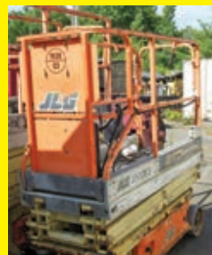
(3) JLG 1930ES electric powered, equipped with 19ft. Platform height, slide out deck, 500lb lift capacity.