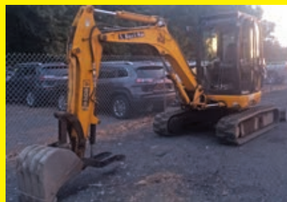
JCB 8045ZTS SN:70755 powered by diesel engine, equipped with Cab, air, heat, front blade, auxiliary hydraulics, zero tail swing, 24in. Digging bucket w/ hydraulic thumb.