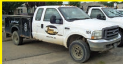
2004 FORD F350XL VN:C96094 4x4, powered by Powerstroke V8 diesel engine, equipped with automatic transmission, power steering, super cab, Knapheide utility body, LT265/75R16 tires.