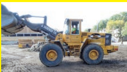
VOLVO L120 powered by diesel engine, equipped with EROPS, air, heat, 3rd valve hydraulics, quick coupler, GP bucket.