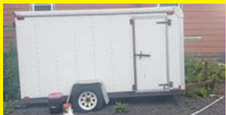
1998 TOWMASTER VN:N/A equipped with 14ft. Enclosed body, rear swing door, side entry door, single axle.