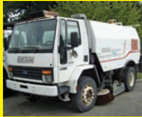
1990 FORD CF7000 VN:M01461 powered by 6.6 liter diesel engine, equipped with automatic transmission, power steering, Elgin Crosswind Series G sweeper body, SN:G416D, 4 cylinder diesel engine, 32000# GVWR, 11R22.5 tires, dual wheel single axle, 7,000 miles, 1,433 hours.