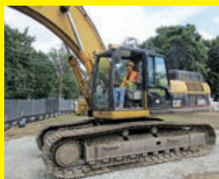
CAT 330DL powered by Cat diesel engine, equipped with Cab, air, heat, reach boom, digging bucket, long undercarriage.