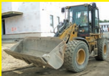
CAT 924G powered by Cat diesel engine, equipped with EROPS, air, heat, 3rd valve hydraulics, quick coupler, GP bucket.