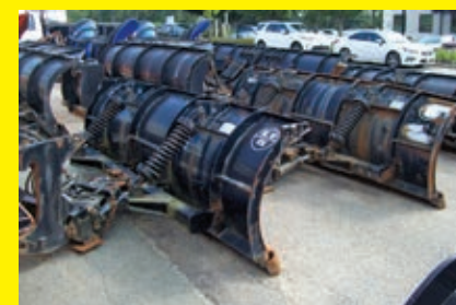
(2) CAT POWER ANGLE PLOW with IT couplers.