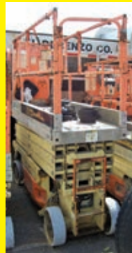
JLG 2630ES SN:200134281 electric powered, equipped with 26ft. Platform height, slide out deck, 500lb lift capacity.