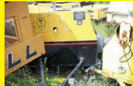
LEROI SN:3515X565 powered by Isuzu diesel engine, equipped with 185CFM, trailer mounted. (5) QTY OF PARTS.