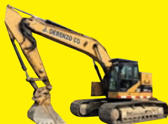
(2) 2008 CAT 328DLR powered by Cat diesel engine, equipped with Cab, air, heat, reach boom, reduced tail swing, digging bucket, long undercarriage.