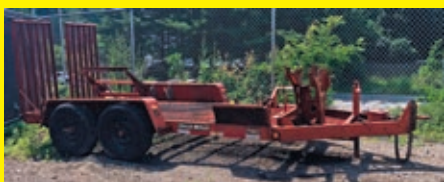
2007 DITCH WITCH T9C VN:701560 equipped with 13ft. Deck, fold down ramps, 11,000lb GVWR, tandem axle.