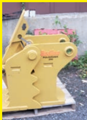
BODINE 80/80mm , to fit Cat 320/325, Komatsu PC200/250 and similar size machines.