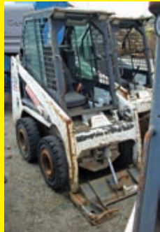
BOBCAT S70 powered by diesel engine, equipped with rollage, auxiliary hydraulics, mechanical quick coupler.