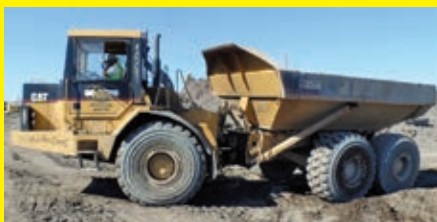
(2) CAT D350E 6x6, powered by Cat diesel engine, equipped with Cab, air, heat, 35 ton capacity.