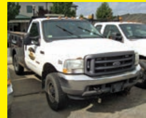
2004 FORD F250XL VN:C39143 4x4, powered by Powerstroke V8 turbo diesel engine, equipped with automatic transmission, power steering, utility body, LT265/75R15 tires, dual wheel single axle.