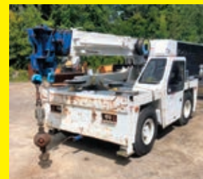
P & H D851 SN:60001 powered by Cummins diesel engine, equipped with Cab, 8.5 ton capacity, (4) outriggers, 32ft. 4-section boom, swing away JIB, crane smart system, 10.00R15 rubber. Current Certification.