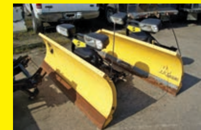
(2) FISHER HT SERIES 7.5FT. POWER ANGLE PLOW