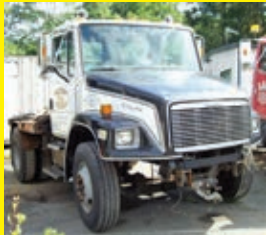
FREIGHTLINER VN:N/A equipped with flatbed body, dual wheel single axle, no engine, PARTS.