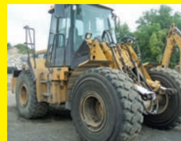
CAT IT38G powered by Cat diesel engine, equipped with EROPS, air, heat, IT arrangement, GP bucket.