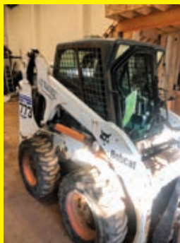
BOBCAT 773 SN:51901992 powered by diesel engine, equipped with EROPS, auxiliary hydraulics, mechanical quick coupler, GP bucket.