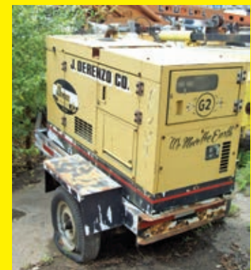
AIRMAN SDG25S SN:1233A01137 powered by Isuzu diesel engine, equipped with 25KW, trailer mounted.