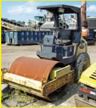
BOMAG BW124DH-3 SN:902581271102 powered by Deutz diesel engine, equipped with OROPS, 47in. Smooth drum, vibratory drum, drum drive.