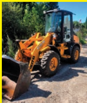
JCB 407B powered by diesel engine, equipped with EROPS, air, heat, GP bucket.