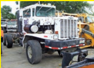
1990 OSHKOSH VN:39177 powered by Cummins 6 cylinder diesel engine, equipped with Road Ranger 9 speed transmission, power steering, 22,000lb fronts, 46,000lb rears, 445/65R22.5 tires, tandem axle. Comes with a new spare engine.