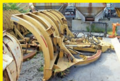
18FT. POWER ANGLE PLOW 18FT. MANUAL ANGLE PLOW