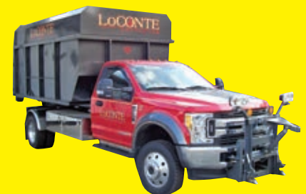
2017 FORD F550XLT VN:A07560 4x4, powered by Powerstroke 6.7L turbo diesel engine, equipped with automatic transmission, power steering, Switch-N-Go Mdl 13S-620HD-15H body, sn S4999 with Parker winch, chip body with barn door gate, front plow frame, 245/70R19.5 tires, dual wheel single axle.