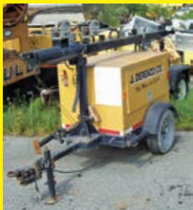
MAGNUM MLT3060MMH SN:61354 powered by diesel engine, equipped with 4-1,000 watt lightbulbs, 6KW, trailer mounted.