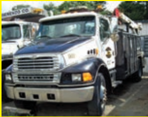
2001 STERLING M6500 VN:J40469 powered by Cat 3126 diesel engine, Eaton Mid Range 6 speed transmission, Service body with crane, Miller welder, IMT air compressor, 11R22.5 tires, dual wheel single axle.