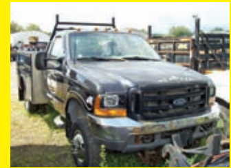
1999 FORD F350 VN:C70575 powered by Powerstroke V8 diesel engine, equipped with automatic transmission, power steering, utility body, LT235/85R16 tires, dual wheel single axle.