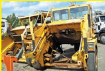
(2) ELGIN VN:N/A powered by 4 cylinder diesel engine.