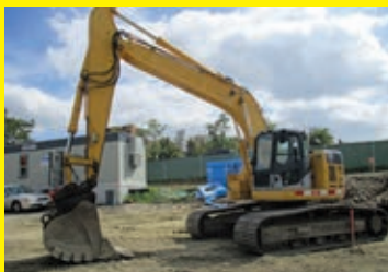
KOMATSU PC308LC-8 powered by Komatsu diesel engine, equipped with Cab, air, heat, reach boom, digging bucket, long undercarriage.