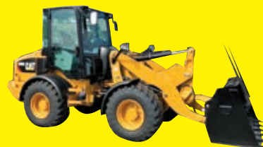
(2) UNUSED CAT 908M powered by Cat C3.3B diesel engine, equipped with EROPS, air, quick coupler, GP bucket, 405/70R20 rubber. Forks Sell Separately.