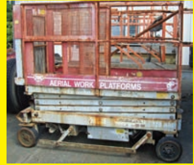
MEC 220AM electric powered, equipped with 20ft. Platform height, slide out deck, 500lb lift capacity.