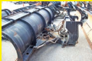
14FT. POWER ANGLE PLOW with Cat IT couplers.