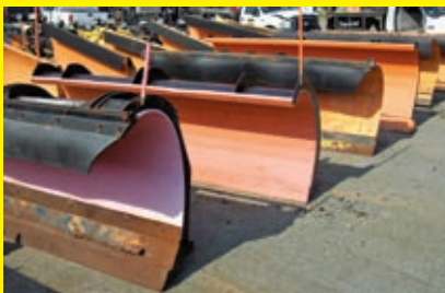
(8) 10FT. POWER ANGLE PLOW truck mount.