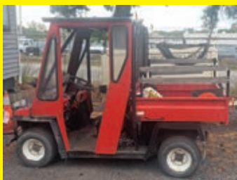
KAWASAKI MULE powered by gas engine, equipped with EROPS, heat, dump body, pintle hitch, 20 x 10.00-10 tires.