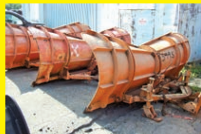
(3) 11FT. MANUAL ANGLE PLOW