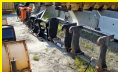
QTY OF LOAD QUICK COUPLERS FOR SNOW PLOWS