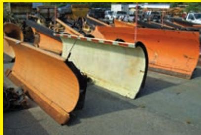
(3) 11FT. POWER ANGLE PLOW truck mount.