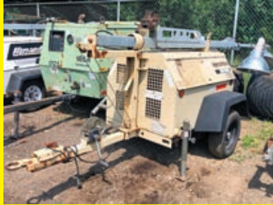
INGERSOLL RAND SN:343719UC0789 powered by diesel engine, equipped with 4-1,000 watt lightbulbs, trailer mounted.