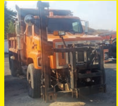
1997 INTERNATIONAL 4900 VN:441608 powered by DT466E diesel engine, equipped with Allison automatic transmission, power steering, dump body, central hydraulics, plow frame, pintle hitch, 12R22.5 tires, tandem axle.