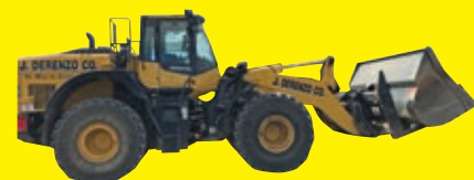
(2) 2016 KOMATSU WA470 powered by Komatsu diesel engine, equipped with EROPS, air, heat, long reach arrangement, GP bucket, L5 rubber.