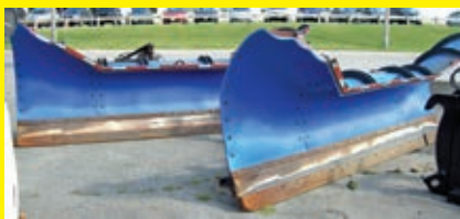
(3) 2014 WAUSSAU HSP4214 POLY POWER ANGLE PLOW with loader couplers. VALK XW-14PRHD 14FT. POWER ANGLE PLOW with Volvo L150 coupler.