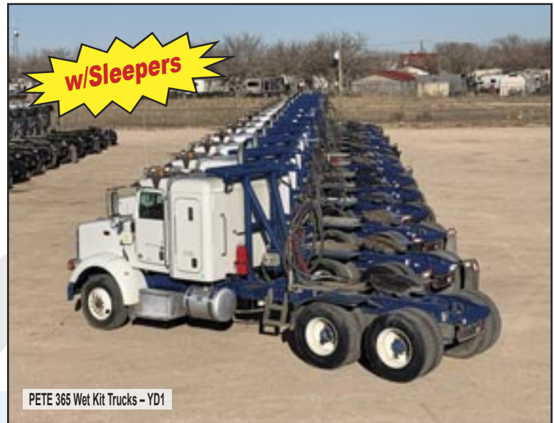
PETE 365 Wet Kit Trucks - YD1

(3) 2018 HEIL 1600CF T/A 4-Compartment Dry Gel Bulk Trailers EA w/ Hyd Blower