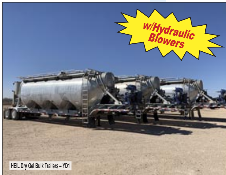
HEIL Dry Gel Bulk Trailers - YD1

(19) 2014 PETERBILT 365 T/A Truck Tractors w/ 36" Sleeper,