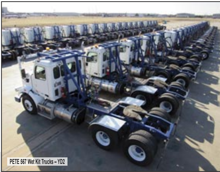
PETE 567 Wet Kit Trucks - YD2

224"WB, EA w/ CUMMINS ISX12-425V Diesel, FULLER RTO16908LL Trans, PTO, Wet Kit, 40,000# Rear Axles, 11R22.5 Tires