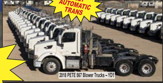
2018 PETE 567 Blower Trucks - YD1