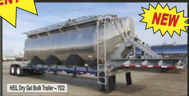
HEIL Dry Gel Bulk Trailer - YD2