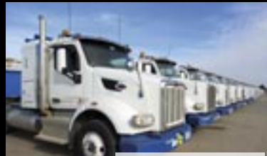
PETE 567 Wet Kit Trucks - YD2