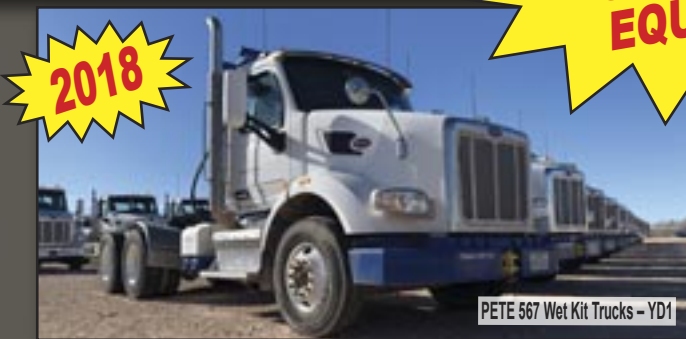
PETE 567 Wet Kit Trucks - YD1