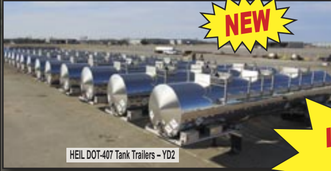
HEIL DOT-407 Tank Trailers - YD2