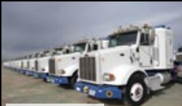
PETE 365 Wet Kit Trucks - YD2