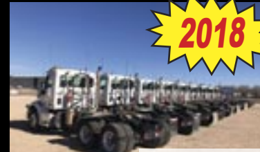
PETE Blower Trucks - YD1