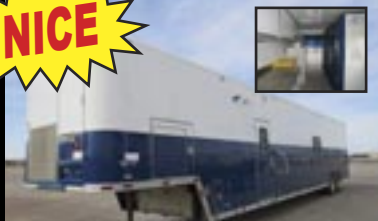
2017 COMPETITION 50'L Tool Trailer - YD2