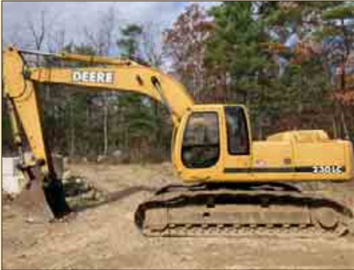
2000 DEERE 230LC EXCAVATOR