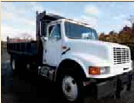
1995 INTERNATIONAL 4700 S/A FLATBED