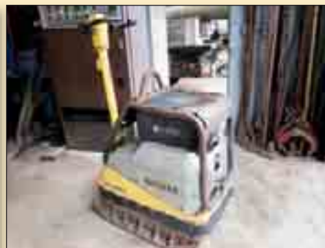
(1 OF 2) WACKER DPU 6055 PLATE COMPACTOR