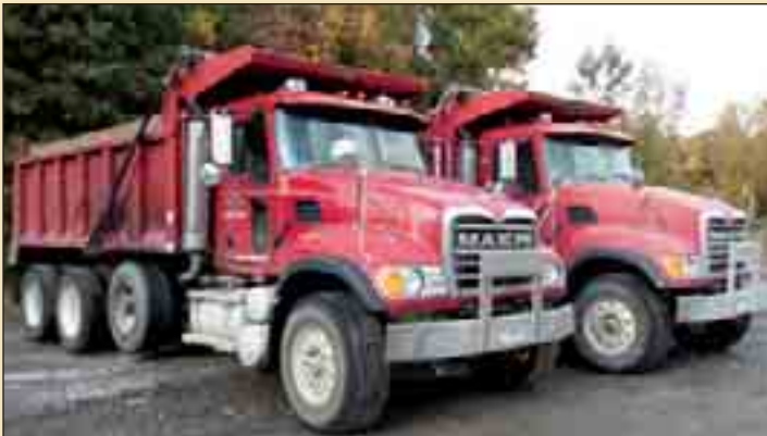
2005 Mack Tri/A Dump Trucks

PREVIEW INSPECTION: Saturday Nov.12th to Nov.18th (No Inspection on Sunday November 13th), 8AM to 4 PM. Prior Inspections by Appointment. Auction Day Inspection Starting at 7 AM.