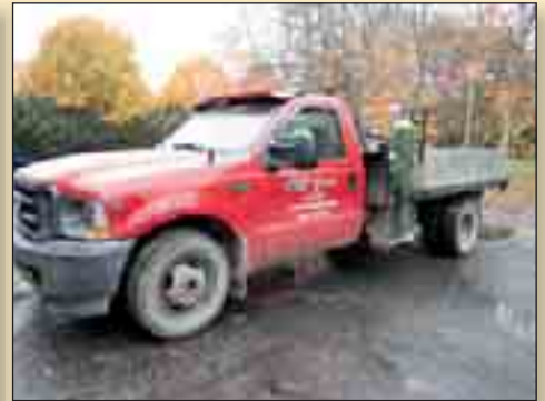
2002 FORD F-350 S/A SERVICE TRUCK