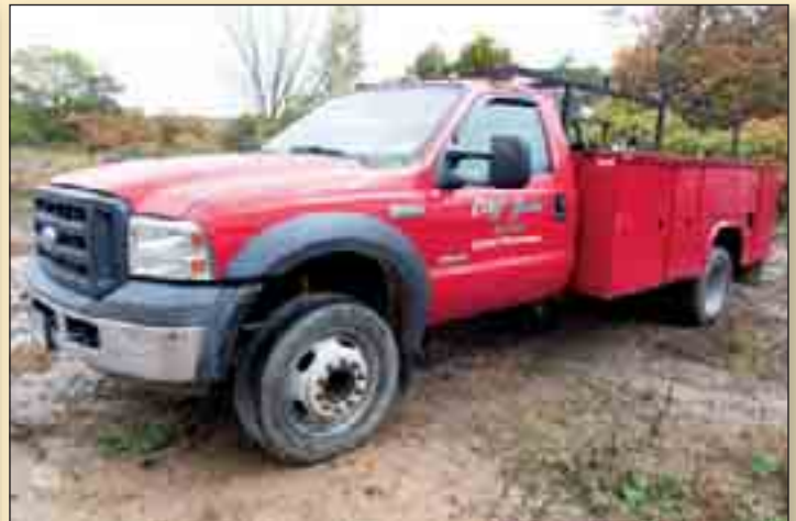
2007 Ford F-550 S/A Service Truck