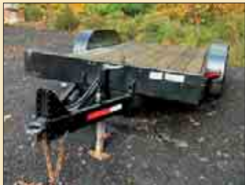
2000 LANDOLL UTILITY TRAILER