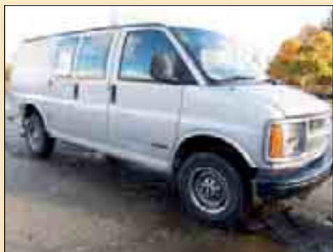
1997 CHEVY G3500 VAN