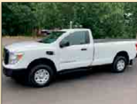
2018 NISSAN TITAN XD PICKUP