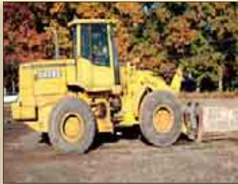
2001 DEERE 544H WHEEL LOADER