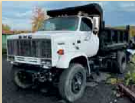
1988 GMC TOP KICK S/A DUMP