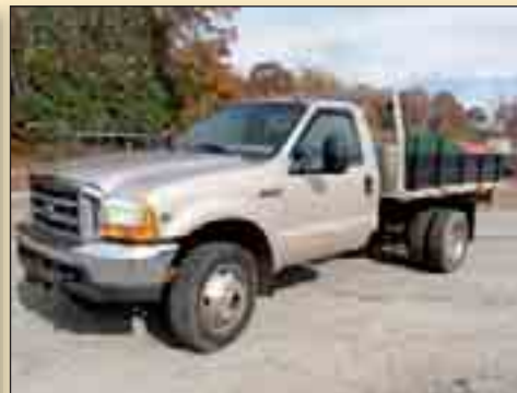
1999 FORD F-550 XLT S/A DUMP