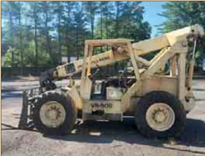
1995 IR VR90B TELESCOPIC FORKLIFT