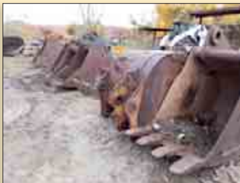
BUCKETS & ATTACHMENTS