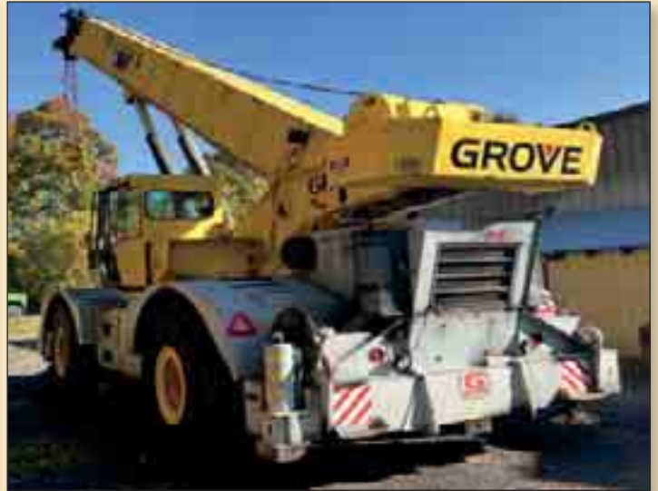
1980 GROVE RT75S