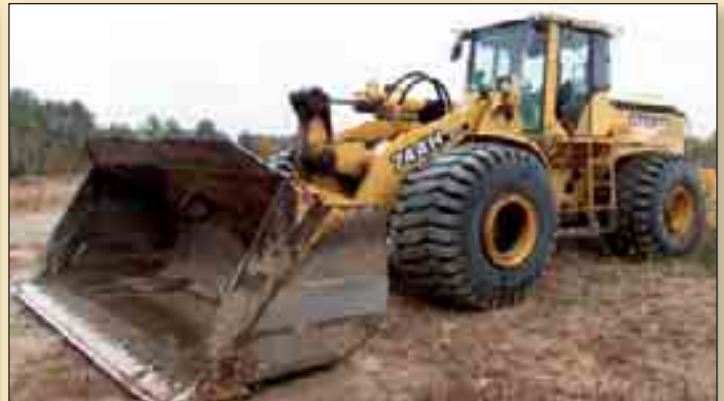
1998 John Deere 744H MH Wheel Loader