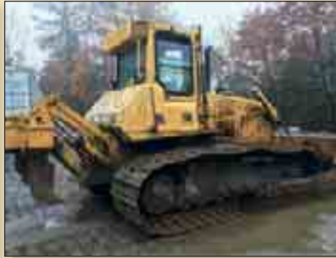
DEERE 850C LGP CRAWLER DOZER