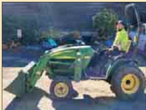
DEERE 4115 HYDROSTATIC TRACTOR