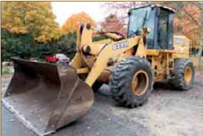
2002 John Deere 624H Wheel Loader