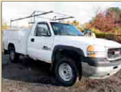
2001 GMC 2500 SIERRA HD S/A SERVICE TRUCK