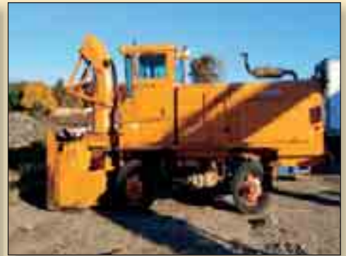
SICARD 5250 SNOWBLOWER