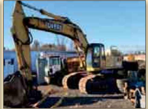
2004 DEERE 450CLC EXCAVATOR