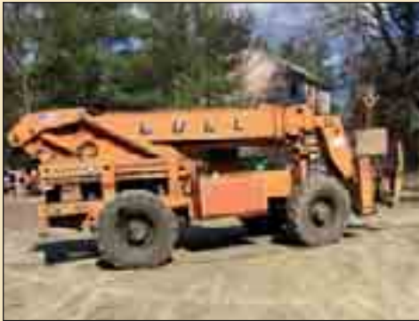
2001 LULL 1044C-54 R/T FORKLIFT