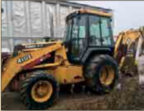
1998 DEERE 410E LOADER BACKHOE