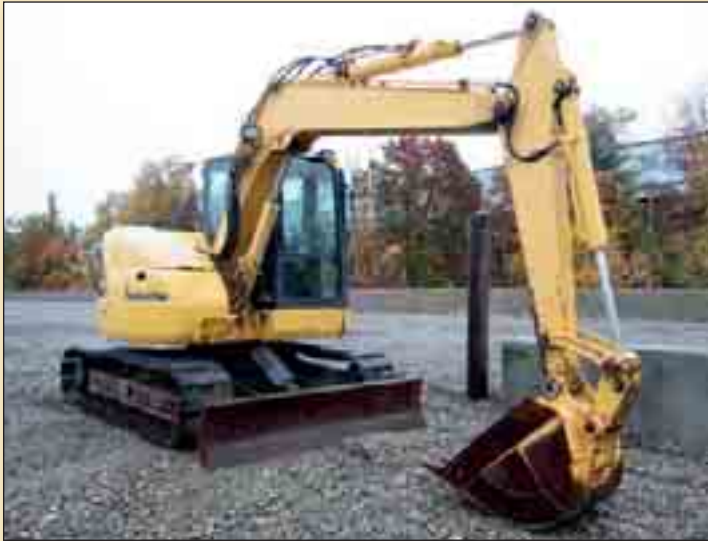
2012 KOMATSU PC78 EXCAVATOR