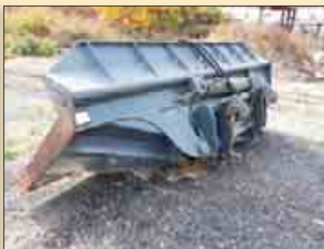
BUCKETS & ATTACHMENTS