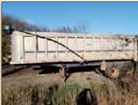
1997 TIBROOK ALUM DUMP TRAILER