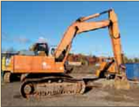
2000 HITACHI EX370-5 EXCAVATOR