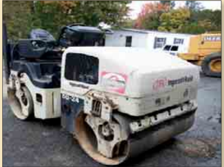
2003 INGERSOLL RAND DD24 ROLLER