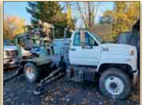
1997 GMC C7500 S/A BOOM TRUCK WITH LOG LOADER