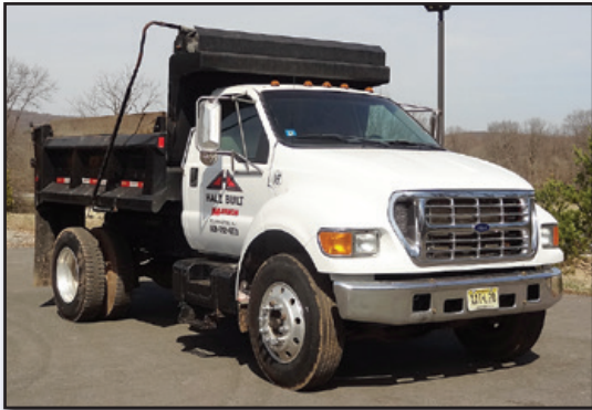
'02 FORD F-650

1998 MACK Model RD688S Tandem Axle Dump Truck , powered by Mack E7-350, 4 Valve diesel engine and Eaton Fuller 8LL transmission, equipped with Bibeau 14.5' heated, steel dump body with power tarp and chute, 44,000 lb rears, 18,000 lb front axle, Jacobs 2-stage engine brake, camelback suspension, tow package with air, air conditioning, and 12R24.5 tires. In good condition with good tires. (219,539 Miles)