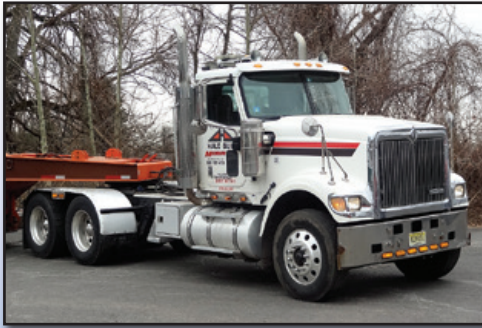
'01 INTERNATIONAL 5900i

2001 INTERNATIONAL Model 5900i Tandem Axle Truck Tractor , powered by Cummins N14-460Ei, 460HP diesel engine and Eaton Fuller 18 speed transmission, equipped with 52,000 lb rears, 16,000 lb front axle, power divider, wetline kit, aluminum headache rack, 3-stage engine brake, double frame, aluminum wheels, 218" wheelbase, Neway air ride suspension, cruise control, air conditioning, and 11R24.5 tires. In good condition with good tires. (275,402 Miles)