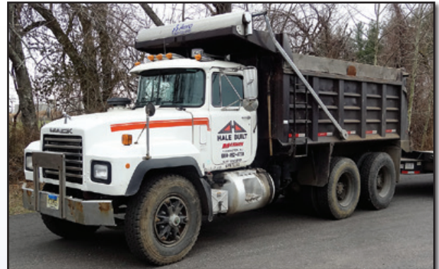
'98 MACK RD688S

2002 FORD Model F-650 Single Axle Dump Truck , powered by Cummins ISB240, 240HP diesel engine and 7 speed transmission, equipped with Heil 10' steel dump body with chute, dual rear wheels, aluminum wheels, cruise control, air conditioning, 17,500 lb rear axle, 8,500 lb front axle, 26,000 lb GVWR, and 10R22.5 tires. In good condition with good tires. (055,662 Miles)