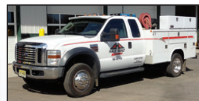
'08 FORD F-450XL 4X4