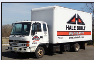
'97 ISUZU FRR