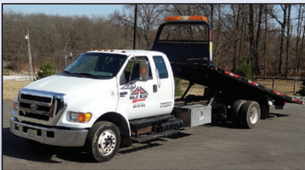
'05 FORD F-650XLT

2003 GMC Model 5500 Single Axle Mason Dump Truck , powered by diesel engine and automatic transmission, equipped with 9' mason body with drop sides and electric hoist, behind cab toolboxes, tow package with electric, dual rear wheels, 18,000 lb GVWR, and 245/70R19.5 tires. In good condition with good tires. (87,994 Miles)