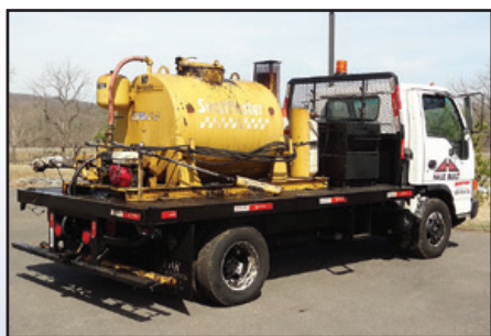
'05 ISUZU WITH SEAL MASTER 300 GALLON

2005 ISUZU Single Axle Tack Truck , powered by Isuzu diesel engine and automatic transmission, equipped with 12' steel flatbed, Seal Master model SK300, 300 gallon tack distributor, s/n E2Z00-006, Honda gas, 7'6" spray bar and wand, cruise control, air conditioning, and 14,500 lb GVWR. In good condition with good tires.