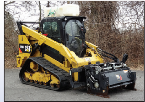
14 CAT 289D & 16 CAT PC310B (SOLD SEPARATELY)

2014 CATERPILLAR Model 289D Crawler Skid Steer Loader , s/n TAW00825, powered by Cat diesel engine and 2-speed hydrostatic transmission, equipped with 82" general purpose loader bucket, high flow XPS hydraulics, 9-pin electrics, rear backup camera, enclosed ROPS cab with heat and air conditioning, and 18" rubber tracks. In good to very good condition with good tracks. (1,539 Hours)