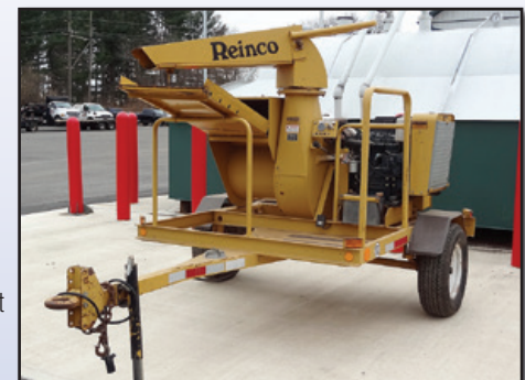
08 REINCO TM-35XKUB

2008 REINCO Model TM-35XKUB Portable Straw Blower , s/n 4681, powered by Kubota V1505 diesel engine, equipped with pintle tow and ST225/75R15 tires. In good condition with good tires. (0,032 Hours)