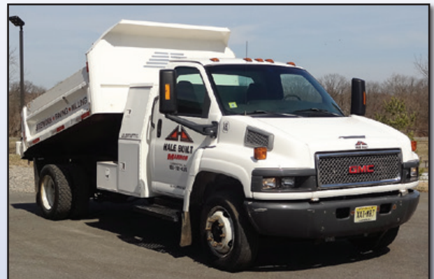
'03 GMC 5500

2014 FORD Model F-450XL, Super Duty 4x4 Crew Cab Flatbed Truck , powered by Powerstroke 6.7L diesel engine and automatic transmission, equipped with 9' steel flatbed with gooseneck hitch, headache rack with LED work lights and rear camera, dual rear wheels, tow package with electric, power windows and mirrors, cruise control, air conditioning, 16,500 lb GVWR, and 225/70R19.5 tires. In good condition with good tires. (32,112 Miles)