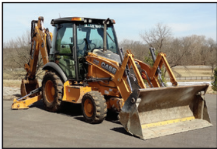
13 CASE 580 SUPER N 4X4 EXTEND-A-HOE

2013 CASE Model 580 Super N, 4x4 Tractor Loader Extend-A-Hoe , s/n 585352, powered by Case diesel engine and shuttle transmission, equipped with 4-in-1 loader bucket, Helac 18" clamshell digging bucket, 4-stick backhoe controls, front and rear auxiliary hydraulics, adjustable hydraulic 8-30 GPM flow, enclosed ROPS cab with heat and air conditioning, 12x16.5 front and 19.5L24 rear tires. In good condition with good tires. (001,971 Hours)