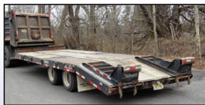
'04 TALBERT 20 TON

2004 TALBERT Model AC-20, 20 Ton Tandem Axle Tag-A-Long Trailer , equipped with 20'x8'6" load deck with 5' beavertail and 5' ramps, spring suspension, 47,540 lb GVWR, and 215/75R17.5 tires. In good condition with good tires.