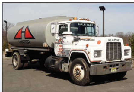
'89 MACK R690T WITH ALLIED 3,600 GALLON

2005 ISUZU Single Axle Tack Truck , powered by Isuzu diesel engine and automatic transmission, equipped with 12' steel flatbed, Seal Master model SK300, 300 gallon tack distributor, s/n E2Z00-006, Honda gas, 7'6" spray bar and wand, cruise control, air conditioning, and 14,500 lb GVWR. In good condition with good tires.