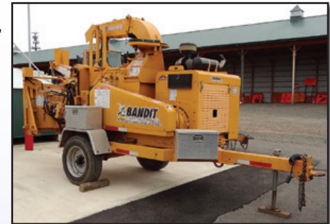
12 BANDIT 1390XP

2012 BANDIT Model 1390XP Portable Drum Chipper , s/n 4FMUS1512CR001225, powered by Perkins diesel engine, equipped with 13" capacity, hydraulic winch, 360° chute rotation with hydraulic adjustable chute deflector. In very good condition. (0,340 Hours)