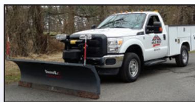
'13 FORD F-250 4X4

2005 FORD Model Ranger XLT, 4x4 Extended Cab Pickup Truck , powered by 4.0L gas engine and automatic transmission, equipped with 6' bed with cap and side doors, power windows, locks, and mirrors, air conditioning, and P255/70R16 tires. In fair to good condition with good tires.