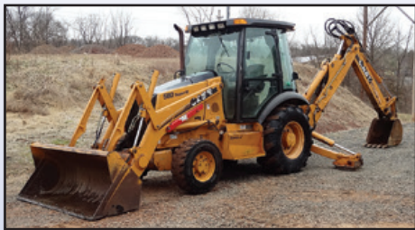
07 CASE 580 SUPER M SERIES II 4X4 EXTEND-A-HOE

2007 CASE Model 580 Super M, Series II, 4x4 Tractor Loader Extend-A-Hoe , s/n N6C412982, powered by Case diesel engine and shuttle transmission, equipped with general purpose loader bucket, 24" digging bucket, rear auxiliary hydraulics, rear pilot controls, enclosed ROPS cab with heat, 12-16.5 front and 19.5L24 rear tires. In good condition with good tires. (04,732 Hours)