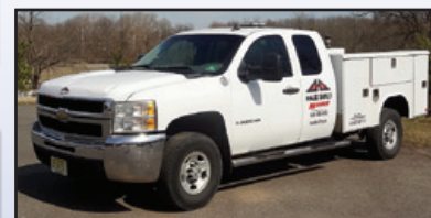
'09 CHEVY 2500HD