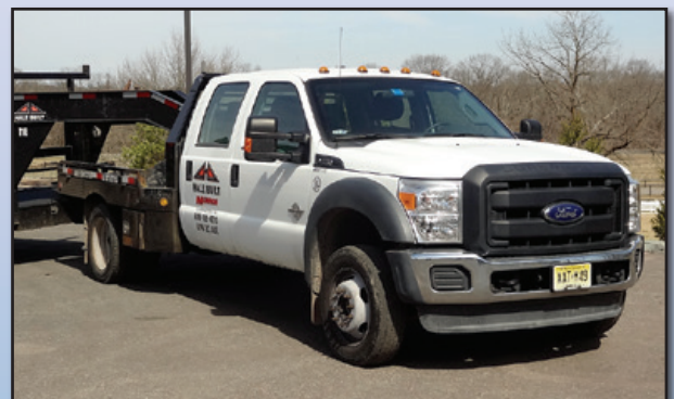
'14 FORD F-450XL 4X4