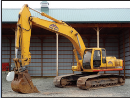
97 JD 270LC

1997 JOHN DEERE Model 270LC Hydraulic Excavator , s/n 70012, powered by John Deere diesel engine and hydraulic drive, equipped with 10'6" dipper stick, Geith 44" digging bucket, JRB quick coupler, stiff arm bracket, and 31.5" TBG pads. In good condition with good undercarriage. (07,255 Hours)