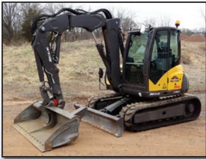
17 MECALAC 8MCR

2017 MECALAC Model 8MCR Skid Excavator , s/n 0131327, powered by Deutz diesel engine and hydraulic drive, equipped with 71" dipper stick with auxiliary hydraulics and hydraulic coupler, articulated boom, 82" general purpose loader bucket and 18" digging bucket, 83" backfill blade, enclosed ROPS cab with air conditioning, and 17.5" rubber tracks. In excellent condition. (125 Hours) (Balance of Manufacturer Warranty Remaining Thru 11/19)