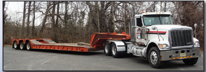
'95 TALBERT 50 TON

1995 TALBERT Model T3DW-50SA-HRG-1-T1, 50 Ton Tri-Axle Lowboy Trailer , equipped with non-ground bearing hydraulic detachable gooseneck, 22'6"x8'6" level deck, 11'6" deck over axles, air lift rear axle, air ride suspension, outriggers, chain dogs, and 255/70R22.5 tires. In good condition with good tires. (Rebuilt All 3 Axles, Brakes and Bushings – New Air Bags on Lift Axle – Reinforced Hitch Area)