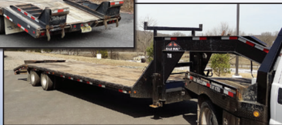
'13 BIG TEX GOOSENECK

LITTLEFORD 4,880 Gallon Tandem Axle Liquid Asphalt Storage Trailer , equipped with aluminum jacket and insulated. In fair condition.