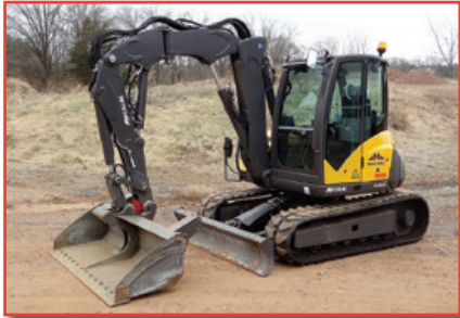
`17 MECALAC 8MCR

PRE-SORTED FIRST CLASS MAIL US POSTAGE PAID HAVERTOWN, PA PERMIT #45