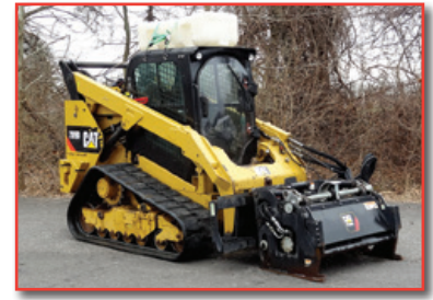
`14 CAT 289D & `16 CAT PC310B (SOLD SEPARATELY)