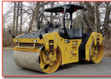
`17 CAT CB64B

1440 COWPATH RD. • HATFIELD, PA 19440 215/361-9099 • Fax: 215/361-9212 www.hunyady.com