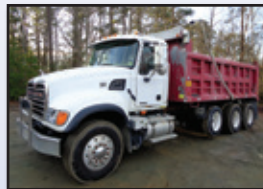
'04 MACK CV713 GRANITE

Granite Tri-Axle , Mack AI, 350HP diesel and auto trans, Aero steel dump body with swing gate and electric tarp, 58,000 lb rears and 18,000 lb front axle, camelback suspension, airlift 3rd axle, 2-stage engine brake, heated mirrors, cruise control, ac, 315/80R22.5 front, 11R22.5 rear, and 255/70R22.5 lift tires. In good condition with very good tires. (Odometer Reads 225,722 Miles)