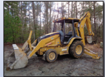
'04 CAT 430D

1981 JD 544C , s/n 401325DW, JD diesel and ps trans, gp loader bucket, EROPS, and 17.5x25 tires. In fair to good condition with good tires.