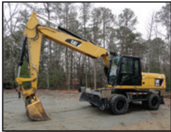
'11 CAT M322D

2011 CATERPILLAR M322D , s/n D2W00300, Cat 6.6L Acert diesel, 9'6" dipper stick, multi-function auxiliary hydraulics, Cat 72" cleanup bucket with hydraulic wrist, EROPS with heat and ac, (4) hydraulic outriggers, and 11.00x20 tires. In good to very good condition with fair to good tires. (Meter Reads 3,852 Hours)