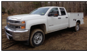
'18 CHEVY 2500HD

2018 CHEVROLET 2500HD Crew Cab Utility Truck , Vortec 6.0L gas and auto trans, 8' open utility body, tow package, power mirrors, windows, and locks, cruise control, ac, and 245/75R17 tires. In very good condition with good to very good tires. (Odometer Reads 10,599 Miles)