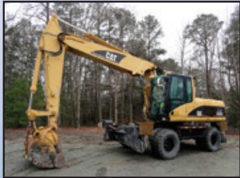
'05 CAT M322C

CAT 36" Digging Bucket (M322) • 72" Cleanup bucket, with hydraulic wrist (M322) (Needs Rebuilt)