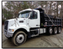
'11 VOLVO TRI-AXLE

2011 VOLVO Tri-Axle , Volvo D11, 365HP diesel and Allison 4500 Series auto trans, Ox 16' steel dump body with air gate, 12" apron, and electric tarp, 40,000 lb rears, spring suspension, pintle hitch with electric, aluminum wheels, power heated mirrors, ac, 315/80R22.5 front, 11R22.5 rear, and 255/70R22.5 lift tires. In good condition with good to very good tires. (Odometer Reads 189,166 Miles)