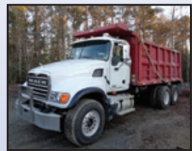
'07 MACK CV713 GRANITE

Mack AI-427 diesel and Maxitorque ES T3/OM/MLR 10 spd multi-spd reverse trans, Ox 16' steel dump body with electric tarp, 44,000 lb rear and 18,000 lb front axle, camelback suspension, 2-stage engine brake, heated mirrors, cruise control, ac, 385/65R22.5 front and 11R24.5 rear tires. In good to very good condition with good to very good tires. (Odometer Reads 202,082 Miles)