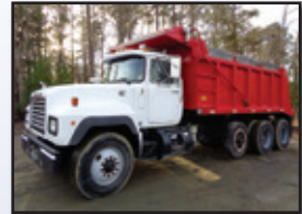
'94 MACK RD690S

Tri-Axle , Mack EM7-300 diesel and Maxitorque T2080 trans, 16' steel