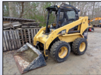
'06 CAT 236B

2006 CATERPILLAR 236B , s/n HEN03835, Cat 3044C diesel and hydrostatic trans, gp loader bucket, auxiliary hydraulics, OROPS, and 12x16.5 tires. In good condition with fair tires. (Meter Reads 3,122 Hours)