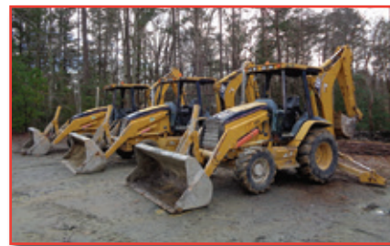
(3) CAT 430D