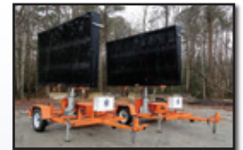
'16 WANCO MESSAGE BOARDS

WTSP90-LSA Portable Arrow Board • (2) TRAFCON TC1-15S Portable Arrow Boards • AMIDA ODLSB15LA Portable Arrow Board