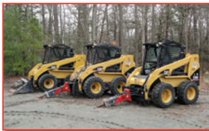
'07 AND '06 CAT 236B (HAMMERS SOLD SEPARATELY)

1440 COWPATH RD. • HATFIELD, PA 19440 215/361-9099 • Fax: 215/361-9212 www.hunyady.com