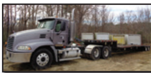
'04 MACK CX613 AND '96 TRAIL KING STEP DECK

2004 MACK CX613 Vision Tandem Axle , Mack E7-300 diesel and Maxitorque TS310, 10 spd trans, 40,000 lb rear and 12,000 lb front axle, wetline kit, air slide 5th wheel, air ride suspension, 2-stage engine brake, 188" wheelbase, aluminum wheels, power heated mirrors, power windows and locks, cruise control, ac, 52,000 lb GVWR, and 11R22.5 tires. In good condition with good tires.