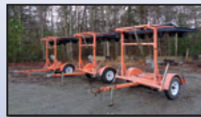
(3) OF (10) ARROW BOARDS

(2) 2000 VER-MAC PCMS-1210 Message Boards , 3-line, 24-character message board, power tower, and ST225/75R15 tires. In good condition with good tires.