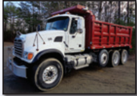
'06 MACK CV713 GRANITE