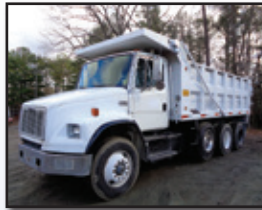
'97 FREIGHTLINER FL80

1999 STERLING Tri-Axle , Cat 3306, 300HP diesel and Fuller 8LL, 10 spd trans, 17' steel dump body with 2-way gate, 40,000 lb rears and 16,000 lb front axle, spring/beam suspension, steerable airlift 3rd axle, ac, 315/80R22.5 front, 11R22.5 rear, and 225/70R22.5 lift tires. In good condition with good to very good tires. (Odometer Reads 226,900 Miles)