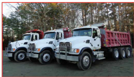
'06 AND '04 MACK CV713 GRANITE

PRE-SORTED FIRST CLASS MAIL US POSTAGE PAID HAVERTOWN, PA PERMIT #45