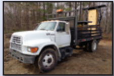
'99 FORD F-800 ATTENUATOR

1999 FORD F-800 Single Axle Attenuator , Cummins ISB, 190HP diesel and auto trans, 14' steel flatbed with 28" wooden stake sides, Energy Absorption Safe-Stop TMA 2-section attenuator, Ver-Mac electric arrow board with cab controls, air brakes, spring suspension, ac, 26,000 lb GVWR, and 295/75R22.5 tires. In good condition with good tires. (Odometer Reads 116,066 Miles)