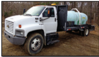
'06 CHEVY C7500

2006 CHEVROLET C7500 Single Axle Flatbed/Water , Cat C-7, 190HP diesel and auto trans, 19'6" steel flatbed body, 1,500 gallon poly water tank, hydraulic brakes, pintle hitch, storage boxes, power mirrors, 25,950 lb GVWR, and 11R22.5 tires. In good condition with good tires. (Odometer Reads 197,903 Miles)