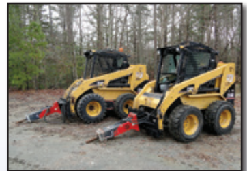
'07 & '06 CAT 236B (HAMMERS SOLD SEPARATELY)

2006 CATERPILLAR 236B , s/n HEN03841, Cat 3044C diesel and hydrostatic trans, gp loader bucket, auxiliary hydraulics, OROPS, and 12x16.5 tires. In good condition with good tires. (Meter Reads 2,203 Hours)