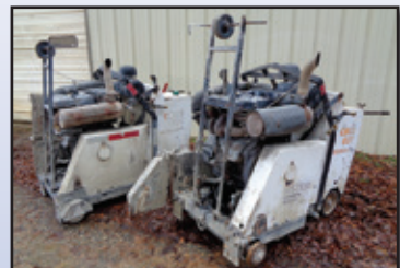
(2) OF (6) 66HP AND 60HP DIESELS

2011 CORE CUT 6560XLS , s/n 141380, Deutz 60HP (42.0KW) diesel and hydrostatic trans, 30" blade capacity. In good condition.