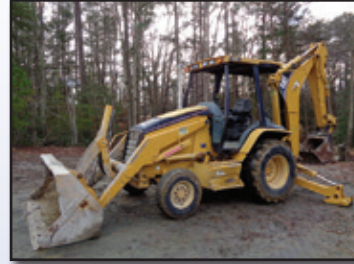
'04 CAT 430D

2004 CATERPILLAR 430D , s/n BNK06151, Cat 3054T diesel and shuttle trans, gp loader bucket, Wain Roy 24" clamshell digging bucket, OROPS, 11Lx16 front and 19.5Lx24 rear tires. In good condition with good tires. (Meter Reads 3,106 Hours)