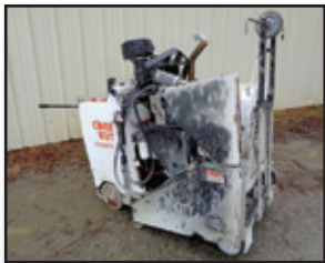
(1) OF (4) '18 - '16 CORE CUT 71HP DIESELS

2016 CORE CUT CC6571 , s/n 153614, Kubota 71HP (52.2KW) diesel and hydrostatic trans, 36" blade capacity. In very good condition.