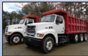
'02 AND '99 STERLING TRI-AXLES

LT7500 Tri-Axle , Cat C-10 diesel and Fuller 8LL, 10 spd trans, 17' steel dump body with 2-way gate, 40,000 lb rears and 16,000 lb front axle, steerable lift axle, spring suspension, cruise control, ac, 315/80R22.5 front, 255.70R22.5, and 11R22.5 rear tires. In good condition with good tires. (Odometer Reads 191,648 Miles)