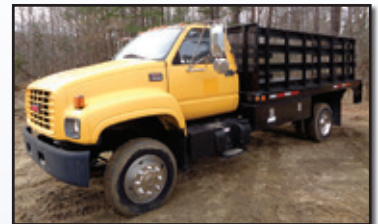
'02 CHEVY C5500

2002 CHEVROLET C5500 Single Axle Stake Body , Cat 3126, 175HP diesel and auto trans, 15' steel stake body with 40" metal sides, Anthony electric lift gate, hydraulic brakes, spring suspension, frame mounted storage boxes, ac, 19,660 lb GVWR, 245/70R19.5 front and 8R19.5 rear tires. In good condition with good tires. (Odometer Reads 138,263 Miles)