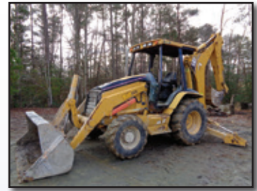
'05 CAT 430D 4X4

2005 CATERPILLAR 430D , 4x4, s/n BNK06986, Cat 3054T diesel and shuttle trans, 4WD, gp loader bucket, Wain Roy 24" clamshell digging bucket, OROPS, 12.5/80x18 front and 19.5x24 rear tires. In good condition with good tires. (Meter Reads 8,006 Hours)