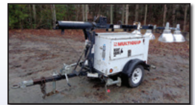
(1) OF (2) '11 MQ NIGHT HAWKS

(2) 2001 AMIDA AL4060D-4MH , Kubota diesel, 6000 watt generator. In good condition.