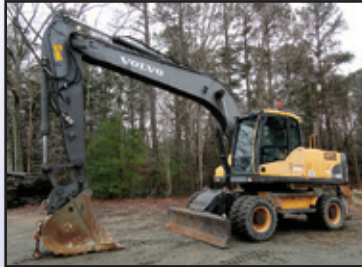
'11 VOLVO EW210C

2011 VOLVO EW210C , s/n 120112, Volvo V-ACT, 170HP diesel, 9'6" dipper stick, multi-function auxiliary hydraulics, hydraulic coupler, Rockland 32" digging bucket with side cutters, 9' backfill blade, EROPS with heat and ac, (4) hydraulic outriggers, and 10.00x20 tires. In good condition with good tires. (Meter Reads 05,688 Hours)