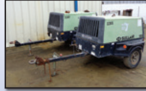
'05 SULLAIR 185DPQJD

(2) 2005 SULLAIR 185DPQJD , 185CFM Portable, JD 4024T diesel, 100PSI and ST225/75R15 tires. In good condition. (2,501 and 836 Hours)