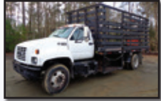
'00 CHEVY C6500 CONE DISTRIBUTION

Distribution , Cat 3126, 175HP diesel and auto trans, 19' steel cone distribution body with 79" wooden stake sides, hydraulic brakes, spring suspension, ratchet straps, ac, 23,100 lb GVWR, and 9R22.5 tires. In good condition with good tires. (Odometer Reads 069,828 Hours)