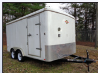
'14 CARRY-ON 8X14CGR

2014 CARRY-ON 8X14CGR Tandem Axle Enclosed Cargo Trailer , 14' aluminum cargo body with fold-down rear door and side man door, spring suspension, 7,000 lb GVWR, and 205/75D15 tires. In good condition with good tires.