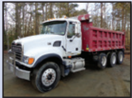
'04 MACK CV713 GRANITE