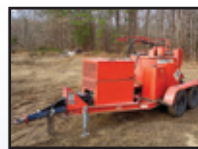
'03 CRAFTCO SUPER SHOT 250

1994 CRAFTCO EZ Pour 200D Diesel Melter/Applicator , s/n 1C9FD1225R1418103, Isuzu diesel, 200 gallon melt pot, mounted on T/A trailer with 185R14 tires. (Insulation jacket needs replaced – no hose or wand).