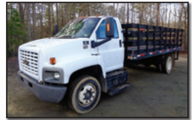
'06 CHEVY C6500

2006 CHEVROLET C6500 Single Axle Stake Body , Cat C-7, 190HP diesel and auto trans, 18'3" steel stake body with 40" steel stake sides, hydraulic brakes, spring suspension, 29,950 lb GVWR, and 245/70R19.5 tires. In good condition with good to very good tires. (Odometer Reads 168,332 Miles)