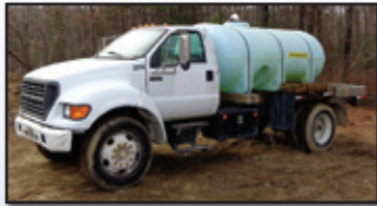
'00 FORD F-650XL

2000 FORD F-650XL Super Duty Single Axle Water , Cummins ISB, 225HP diesel and auto trans, 1,500 gallon poly water tank, hydraulic brakes, spring suspension, ac, 26,000 lb GVWR, and 295/75R22.5 tires. In good condition with good tires. (Odometer Reads 161,729 Miles)