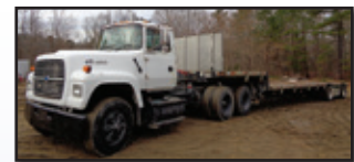
'95 FORD L9000 AND '03 FONTAINE SPREAD AXLE STEP DECK

1976 MACK R686ST Tandem Axle Winch Tractor , Mack ENDT676, 283HP diesel and 6 spd lo-hole trans, Tulsa PTO chain drive winch, sloped tail, double frame, camelback suspension, 80,000 lb GVWR, and 11R22.5 tires. In fair to good condition with fair to good tires.