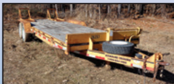
'07 ECONOLINE 7 TON

2007 ECONOLINE 7 Ton T/A 2004 ECONOLINE Bobkat Pro , 6 Ton T/A • 2000 CARSON T/A 2000 CARRY-ON T/A • 2000 HARTSELLE T/A • 1998 CRONKHITE T/A Grout Trailer • 1999 CARSON T/A • 1998 CRONKHITE T/A • 1998 CARSEN T/A • (2) 1993 Shopmade S/A • BECK T/A (No Title)