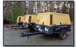
'08 SULLAIR 375HCA, 150PSI

(3) 2008 SULLAIR 375HCA , 375CFM Portable, Cat C4.4 Acert diesel, 150PSI and ST205/75R15 tires. In good condition. (All Less Than 3,600 Hours) (3) 2007 INGERSOLL RAND P250WJD , 250CFM Skid Mounted, JD 4045DF150 diesel. In good condition. (Average 4,000 Hours)