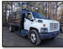
'05 CHEVY C7500 CONE DISTRIBUTION

Distribution , Cat C-7, 190HP diesel and auto trans, 18' steel cone distribution body with 60" wooden sides and fold-down expanded metal gate, 19,000 lb rear and 8,000 lb front axle, hydraulic brakes, spring suspension, pintle hitch, ratchet straps, power mirrors, cruise control, ac, 25,950 lb GVWR, and 11R22.5 tires. In good condition with good to very good tires.