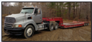
'02 STERLING AND '86 TRANSPORT 50 TON

1995 FORD L9000 Tandem Axle , Cat 3406 diesel and Fuller 9 spd trans, wetline kit, air ride suspension, air slide 5th wheel, double frame, 202" wheelbase, aluminum front wheels, ac, and 11R22.5 tires. In good condition with good to very good tires.