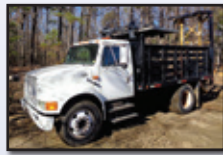
'00 INT'L 4700 ATTENUATOR

2000 INTERNATIONAL 4700 Single Axle Attenuator , Int'l T444E diesel and auto trans, 12' steel stake body with 42" metal sides, MPS 350 attenuator with electric winch, Solar Tech electric arrow board with Silent Sentinel cab controls, air brakes, spring suspension, cruise control, ac, and 295/75R22.5 tires. In good condition with very good tires. (Odometer Reads 128,483 Miles)