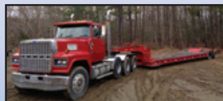
'87 FORD LTL9000 AND '89 EAGER BEAVER 35 TON

1987 FORD LTL9000 Tri-Axle , Cat 3406B diesel and Fuller 8LL, 10 spd trans, 44,000 lb rears and 12,080 front axle, wetline kit, airlift 3rd axle, spring/beam suspension, air slide 5th wheel, double frame, 202" wheelbase, aluminum front wheels, ac, and 11R22.5 tires. In good condition with good to very good tires.