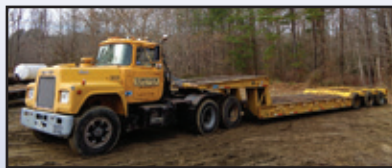
MACK R686ST AND HYSTER 40 TON