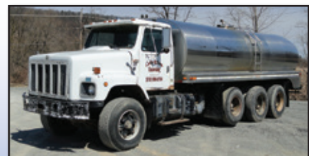
'84 INT'L S2600

1984 INTERNATIONAL S2600 Tri-Axle Water , Cummins 400 dsl and 8 speed trans, 4,200 gallon stainless body, 3" PTO loading pump, rear spray bars, spring/beam suspension, and 11R24.5 tires. In good condition with good tires.