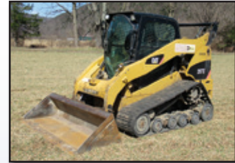
'08 CAT 287C

2008 CAT 287C Crawler , s/n MAS01365, Cat 3.4L dsl and 2-speed hydrostatic trans, 80" gp loader bucket with bolt-on cutting edge, standard auxiliary hydraulics and electrics, EROPS cab with heat and ac, and 18" rubber tracks. In good condition with fair to good tracks.