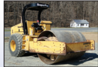
'96 CHAMPION SUPER PAC 840

1996 CHAMPION Super Pac 840 , s/n 100784, Cummins 5.9L, 145HP dsl and hydrostatic trans, 84" smooth drum, drum drive, ROPS canopy, and 18-26 tires. In good condition with fair to good tires.