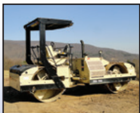
'99 INGERSOLL RAND DD-110

1985 INGERSOLL RAND DA28 , s/n 5408V, Deutz dsl and hydrostatic trans, 39" smooth drums. In fair to good condition.