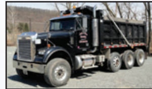
'05 FREIGHTLINER FLD120

2005 FREIGHTLINER FLD120 Tri-Axle , Cat C-13, 465HP dsl and Fuller 8LL trans, Warren 16' steel dump body with tarp and air gate, 46,000 lb rears, 20,000 lb front and 13,200 lb steerable axle, full locking differential, 2-stage Jake brake, Freightliner Challenger suspension, aluminum wheels, cruise control, ac, 385/65R22.5 front, 285/75R24.5 lift, and 11R24.5 rear tires. In good condition with good tires.