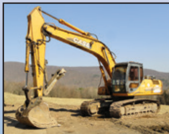
'03 CASE CX210

2003 CASE CX210 Hydraulic Excavator , s/n DAC0721577, Isuzu dsl, 9'8" stick with hydraulic beyond, Rockland hydraulic thumb, 48" digging bucket, and 23.5" TBG pads. In good condition with good undercarriage.