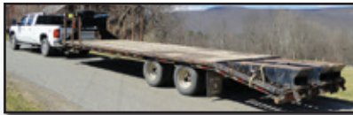
11 BIG TEX 30'

2011 BIG TEX 22GN-25+5, 30' 5th Wheel Trailer, 25'x8'6" deck with 5' beavertail and ramps, 48" spread axle, stake pockets, landing gear, 20,000 lb GVWR, and 235/80R16 tires. In good condition with good tires.