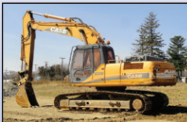
'06 CASE CX210

2006 CASE CX210 Hydraulic Excavator , s/n DAC212852, Isuzu dsl, 9'8" stick with hydraulic beyond, CF manual coupler, 42" digging bucket, cab with heat and ac, and 23.5" TBG pads. In good condition with good undercarriage.