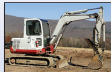
'05 TAKEUCHI TB145

2005 TAKEUCHI TB145 Mini Excavator , s/n 14515084, Yanmar dsl, 5'10" stick, swing boom, 24" digging bucket, hydraulic thumb attachment, 6" backfill blade, cab with heat and ac, and 16" rubber tracks. In good condition with good tracks.