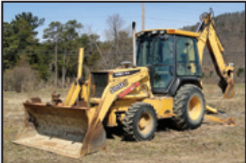
'98 JOHN DEERE 310SE 4X4 EXTEND-A-HOE

1998 JOHN DEERE 310SE, 4x4 Extend-A-Hoe , s/n 844148, JD dsl and shuttle trans, gp loader bucket, 18" digging bucket, 2-stick backhoe controls, EROPS cab with heat and ac, 12.5/80R18 front and 19.5-24 rear tires. In good condition with good to very good front tires.