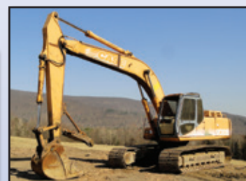
'95 CASE 9030B

1995 CASE 9030B Hydraulic Excavator , s/n DAC0301186, Cummins dsl, 9'10" stick with stiff arm bracket, 36" digging bucket, 25" mechanical thumb, and 31.5" TBG pads. In fair to good condition with fair to good undercarriage.