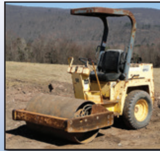
'96 BOMAG BW124D

1996 BOMAG BW124D , s/n A219C1725T, Deutz dsl and hydrostatic trans, 47" smooth drum, ROPS canopy, and 7.5-16 tires. In good condition with good tires.