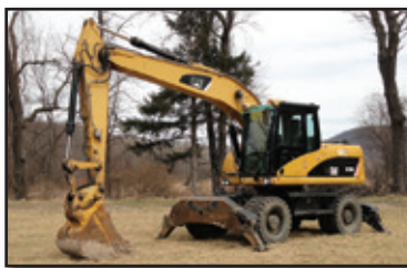
'08 CAT M316D

2008 CAT M316D Rubber Tired , s/n W6A00719, Cat 6.6L dsl, 8'6" stick with hydraulic beyond and Cat hydraulic coupler, Cat 36" digging bucket, digital display screen, (4) outriggers, and 10.00-20 tires. In good condition with excellent tires.