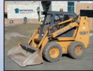
'98 CASE 90XT

1998 CASE 90XT , s/n JAF0298689, Cummins dsl and 2-speed hydrostatic trans, 84" gp loader bucket, Hi-Flow hydraulics, ROPS canopy, and 12-16.5 tires. In good condition with fair to good tires.