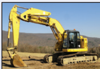
'96 KOMATSU PC228UU-1

1996 KOMATSU PC228UU-1 Hydraulic Excavator , s/n 10055, Komatsu dsl, 9'6" stick, 42" digging bucket, articulated boom, zero swing, cab with heat and ac, and 23.5" TBG pads. In good condition with good undercarriage.