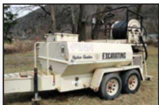
'95 FINN T-90TD

REINCO TM-35KUB Skid Mounted Straw Blower , s/n 4326, Kubota dsl. In good condition.