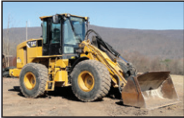
'07 CAT 924H

2007 CAT 924H , s/n HXC00212, Cat 6.6L dsl and ps trans, gp loader bucket with bolt-on cutting edge, hydraulic quick coupler, auxiliary hydraulics, ride control, EROPS cab with heat and ac, and 20.5R25 tires. In good condition with good tires.