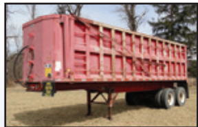
'04 ROGERS 28'

2004 ROGERS DT280AY4, 28' Steel Dump , swing gate, manual tarp, spring suspension, 68,420 lb GVWR, and 11R22.5 tires. In good condition with good tires.