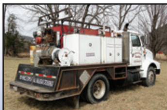
'91 INT'L 8200

1991 INTERNATIONAL 8200 Single Axle Fuel/Lube , Cummins 855 dsl and Fuller 9 speed trans, Dutec 13' lube body, 700 gallon diesel, (4) 180 gallon lube tanks, gas air compressor, hose reels, EVAC pump, work lights, air brakes, and 11R22.5 tires. In fair to good condition with fair to good tires. (New Clutch Installed April 2019)