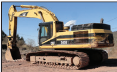
'99 CAT 345BL

1999 CAT 345BL , s/n 4SS01321, Cat dsl, 9'6" stick with hydraulic coupler, CP 48" digging bucket, counterweight removal device, cab with heat and ac, and 36" TBG pads. In good condition with good undercarriage. (Approx 4,000 Hours On Cat Engine Rebuild and Updated Hydraulic Cooler; New Radiator; New Main Swing Bearing, Both Swing Motors, Boom and Stick Cylinders) (800 Hours on Undercarriage Chains and Idlers)