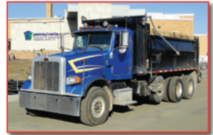
'09 PETERBILT 367