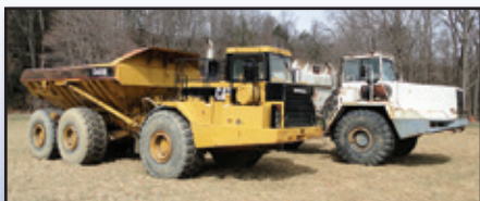
'99 CAT D400E AND '98 TEREX 4066C

1998 TEREX 4066C , 40 Ton, 6x6, s/n A7221042, Detroit 60 Series dsl and ps trans, bed partial lined AR400 and 29.5R25 tires. In good condition with good tires. (Trans and Splitter Box Rebuilt Spring 2017) (Front Rear Axle Rebuilt Less Than 500 Hours)