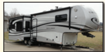
14 DYNAMAX TRILOGY 3650RL

2014 DYNAMAX Trilogy 3650RL Fifth Wheel 4-Season Camper, (3) slide-outs with (2) canopies, living area with sleeper sofa, recliner chair and kitchenette table, Samsung 55" flat screen TV, electric fireplace, (2) ceiling fans, kitchen area with center island and sink, electric refrigerator, propane stove and microwave, sleeping area with Queen size bed, lavatory with shower, washer/dryer, (2) ac units and climate controls, Cummins Onan RVQG, 5500 watt propane generator (18 hours), onboard air compressor, LCI electronic jack leveling system, Reese air ride 5th wheel hitch, 220V/50 amp shore power, and Mor/Ride suspension system. In very good condition.