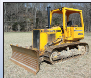
'88 JOHN DEERE 650G

1988 JOHN DEERE 650G , s/n 746529, JD dsl and ps trans, 6-way blade, ROPS canopy, and 18" SBG pads. In good condition with good undercarriage.