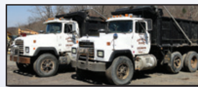
'99 AND '92 MACK RD688S

1999 MACK RD688S Tri-Axle , Mack E7, 400HP dsl and Fuller 8LL trans, 17'6" heated, steel dump body with power tarp and air gate, 46,000 lb rears, 18,000 lb front and 18,000 lb lift axle, 2-stage Jake brake, camelback suspension, 385/65R22.5 front and lift, and 11R24.5 rear tires. In good condition with good tires. (Complete Engine Overhaul, Radiator and After Cooler (out of frame); New Clutch Rear End Approximately 10,000 Miles) (AR400 Bed Liner)