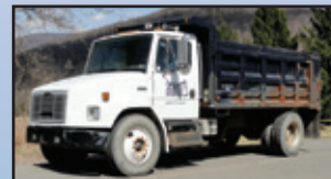
'02 FREIGHTLINER FL70

2002 FREIGHTLINER FL70 Single Axle , Cat 3126, 190HP dsl and 5 speed trans, Ox 13' steel dump body with high lift gate, spring suspension, and 11R22.5 tires. In good condition with good tires.