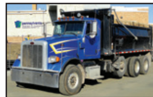
'09 PETERBILT 367

2009 PETERBILT 367 Tri-Axle , Cummins ISX485 dsl and Fuller 18 speed trans, Beau Roc Diamond 17', heated, steel dump body with power tarp and 2-way gate, 46,000 lb rears, 20,000 lb front and lift axle, Pete Air Trac suspension, 3-stage Jake brake, aluminum wheels, power windows, heated mirror, cruise control, ac, 385/65R22.5 front and lift and 11R24.5 rear tires. In good condition with good tires.