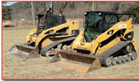
(2) CAT SKID STEERS

1440 COWPATH RD. • HATFIELD, PA 19440 215/361-9099 • Fax: 215/361-9212 www.hunyady.com