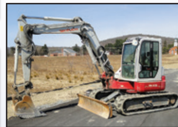
'12 TAKEUCHI TB180FR

2012 TAKEUCHI TB180FR Hydraulic Excavator , s/n 178400863, Yanmar dsl and hydraulic drive, 79" stick with hydraulic beyond, zero turn, swing boom, 24" digging bucket, 90" backfill blade, cab with heat and ac, and rubber tracks. In good condition with good tracks.