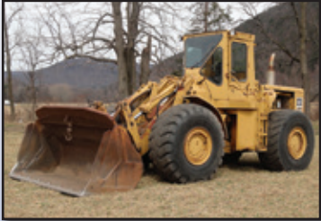
'73 CAT 980B

1973 CAT 980B , s/n 89P2474, Cat dsl and ps trans, gp loader bucket, EROPS cab, and 26.5-25 tires. In good condition with fair to good tires. (Less Than 500 Hours on Rebuilt Hydraulic Pumps, Cylinder Head, and Radiator) (Approximately 1,000 Hours on Rebuilt Trans)