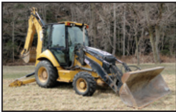
'07 CAT 430E IT 4X4 EXTEND-A-HOE (SIDE DUMP BUCKET SOLD SEPARATELY)

2007 CAT 430E IT 4x4 Extend-A-Hoe , s/n DDT00416, Cat dsl and shuttle trans, gp loader bucket, hydraulic quick coupler, front auxiliary hydraulics, 24" digging bucket, EROPS cab with heat and ac, 12.5/80-18 front and 19.5L24 rear tires. In good condition with very good front and fair rear tires.