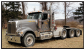
'02 INT'L 9900iX EAGLE

2002 INTERNATIONAL 9900iX Eagle Tri-Axle , Cat C16, 600HP dsl and Fuller 18 speed trans, 46,000 lb rears, 20,420 lb lift and 13,200 lb front axle, wetline kit, 3-stage engine brake, power divider lock, air suspension, double frame, aluminum wheels, full aluminum fenders, headache rack with work and caution lights, power windows, power locks, power and heated mirrors, cruise control, 252" wheelbase, ac, 315/80R22.5 front, 11R24.5 rear and lift tires. In good condition with good tires.