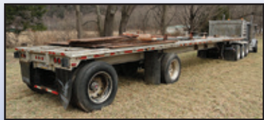
'88 RAVENS 45'

1980 COBRA 30' Aluminum Tandem Axle Dump , steel frame, swing gate, spring suspension, and 11R22.5 tires. In good condition with good tires.