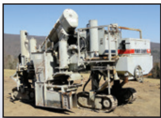
'02 POWER CURBER 5700B

2002 POWER CURBER 5700B , s/n 0220585, Deutz dsl and hydrostatic trans, 40" milling head, slope and grade controls, 18" curb form and 48" sidewalk form. In good condition.