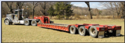
'03 TALBERT 51 TON

2003 TALBERT T4DW-50SA-HRG-1-T1, 51 Ton Quad Axle Lowboy , non ground bearing, hydraulic detachable gooseneck, 24'6"x8'6" level deck, open over wheels, airlift 3rd axle, flip up 4th axle, aluminum wheels, air ride suspension, outriggers, 124,270 GVWR, and 255/70R22.5 tires. In good condition with very good tires.