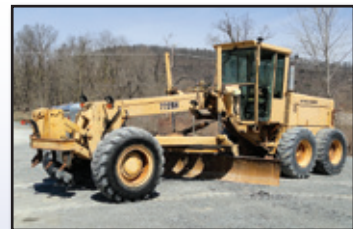
'88 JOHN DEERE 772BH

1988 JOHN DEERE 772BH Articulated , s/n 517860, JD dsl and ps trans, 13' all hydraulic moldboard, MOBA blade control system, front scarifier, EROPS cab with heat, and 17.5-25 tires. In good condition with fair tires.