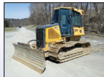
'06 JOHN DEERE 550J LGP

2006 JOHN DEERE 550J LGP , s/n 127001, JD dsl and hydrostatic trans, 6-way blade, EROPS cab with heat and ac, and 24" SBG pads. In good condition with fair to good undercarriage.