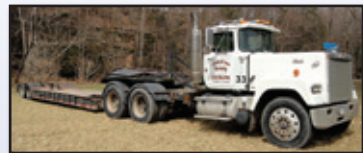
'91 MACK SUPERLINER WITH TRAILING 35 TON

1991 MACK RW613 Superliner Tandem Axle , Mack 400HP dsl and Mack 9 speed trans, 44,000 lb rears, wetline, single frame, tow package with air, aluminum wheels, ac, and 11R24.5 tires. In good condition with good tires.