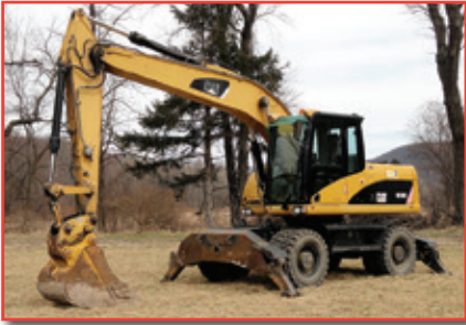
'08 CAT M316D

PRE-SORTED FIRST CLASS MAIL US POSTAGE PAID HAVERTOWN, PA PERMIT #45