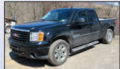
'13 GMC 1500 SIERRA 4X4

2013 GMC 1500 Sierra 4x4 Extended Cab Pickup , Vortec 5.3L gas engine and auto trans, Z71 4x4 package, 6.5' bed with spray liner, toolbox, full power package, running boards, alloy wheels, chase vehicle tow package with electric and brakes, and 275/55R20 tires. In good condition with very good tires.