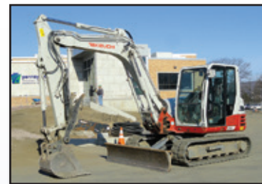
'15 TAKEUCHI TB290

2015 TAKEUCHI TB290 Hydraulic Excavator , s/n 185101919, Yanmar dsl, 7' stick with hydraulic beyond, 24" digging bucket, hydraulic thumb attachment, pattern control selector, EROPS cab with heat and ac, and 18" rubber tracks. In good to very good condition with good undercarriage.