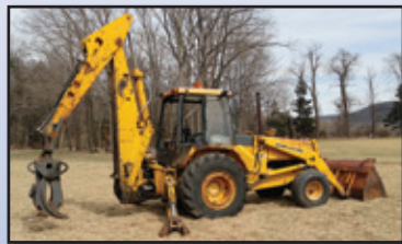
'85 JOHN DEERE 710B

1985 JOHN DEERE 710B , s/n 717147, JD dsl and ps trans, gp loader bucket, Rotobec hydraulic rotating log grapple, 2-circuit rear hydraulic plumbing, EROPS cab (missing some glass). In fair to good condition with fair to good tires.