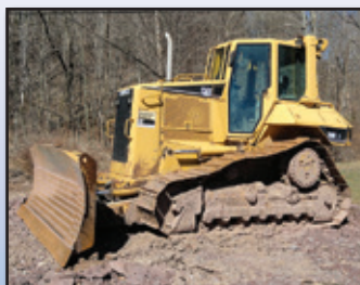
'04 CAT D6N XL

2004 CAT D6N XL , s/n AKM00909, Cat 3126 dsl and ps trans, 6-way blade, differential steering, 3rd valve, EROPS cab with heat and ac, drawbar, and 22" SBG pads. In good condition with fair to poor undercarriage.