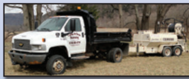
'05 CHEVY C4500 4X4 WITH '95 FINN T-90TD

2005 CHEVY C4500 , 4x4, Duramax 6.6L dsl and Allison auto trans, 11' steel dump body with folding sides, Western 9' quick-tatch snowplow, hydraulic brakes, 17,500 lb GVWR, and 245/70R19.5 tires. In good condition with good tires.