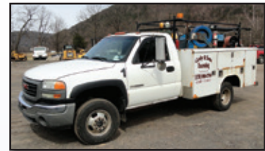
'05 GMC 3500 4X4

2005 GMC 3500, 4x4 Utility , Vortec 6.0L gas engine and auto trans, Reading 9' open utility body with material rack and work lights, and dual rear wheels. In good condition with good tires.