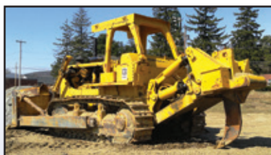
'79 CAT D8K

1979 CAT D8K , s/n 77V13819, Cat D342 dsl and ps trans, 13'6" semi-U blade, 4-barrel single shank ripper, ROPS canopy, reversible fan, and 22" SBG pads. In good condition with good undercarriage-very good pads and poor segments.