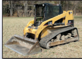
'03 CAT 277

2003 CAT 277 Crawler Skid , s/n CNC02129, Perkins dsl and hydrostatic trans, 80" gp loader bucket, standard auxiliary hydraulics, EROPS cab with heat, and rubber tracks. In good condition with good undercarriage.