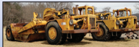
'72 CAT 631C SCRAPERS

1972 CAT 631C , s/n 67M4302, Cat D343 dsl and ps trans, ROPS canopy and 33.25-35 tires. In fair to good condition with fair to good tires. (Engine Rebuild with Less Than 500 Hours)