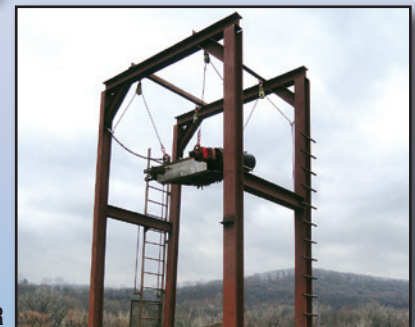
BELT MAGNET TOWER

Grizzly Tower , approximately 14' wide grizzly (manganese), 11'6" opening between tower supports, 12' high @ low end of grizzly, with chute. (Seller Will Assist Loading; Buyer Can Cut on Premises with Proper Insurance and Workers Compensation Certificates)