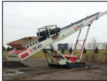
'16 TELESTACK TC421 (MAGNET SOLD SEPARATELY)

2016 TELESTACK Model TC421 Hydraulic Crawler Conveyor , s/n 17-1187-0616, powered by Deutz water cooled diesel engine, equipped with 42"x71' conveyor with feed hopper, hydraulic raise/lower, and 21' hydraulic folding head section with magnetic head pulley, umbilical remote, 136" crawlers, and 16" TBG pads. In good to very good condition with good to very good undercarriage. (Meter Reads 1,714 Hours) (12,290 kg /27,095 lb Machine Weight)