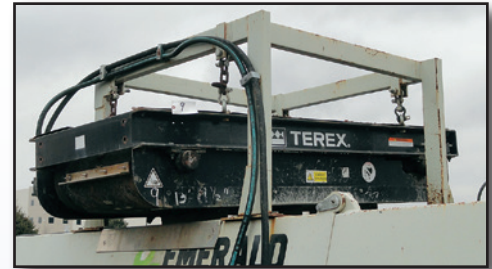
'15 TEREX CP020-100-1

2015 TEREX Model CP020-100-1, 30"x78" Suspended Hydraulic Cross-Belt Magnet , s/n 98075-7, with suspension bridge. In good condition.