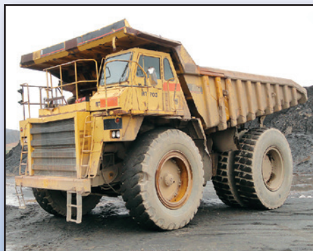
'89 CAT 777B

1989 CATERPILLAR Model 777B, 85 Ton End Dump , s/n 4YC01078, powered by Cat 3508 diesel engine and powershift transmission, equipped with heated dump body (not connected) with bed liners, supplemental steering, retarder, rock ejectors, enclosed ROPS cab, and 27.00R49 tires. In fair to good condition with fair front and good rear tires. (Meter Reads 84,114 Hours) (Odometer Reads 366,744 Miles)