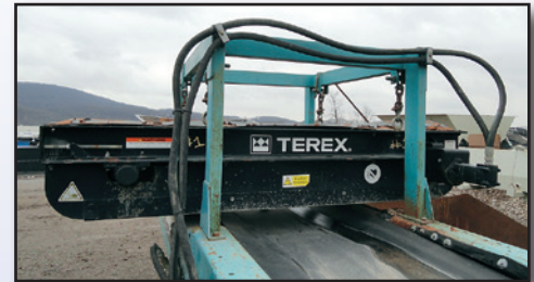
'15 TEREX CP020-100-1

2015 TEREX Model TX440, 30"x78" Suspended Hydraulic Cross-Belt Magnet , s/n 97792, with suspension bridge. In good condition.