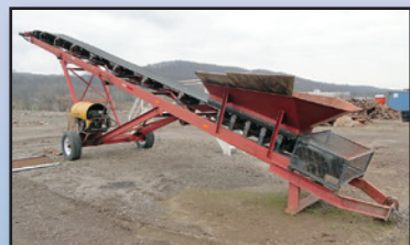
'16 IRON CITY SUPPLY CONVEYOR

Belt Magnet Tower Consisting of: IMI 36" x 66" Suspended Hydraulic Belt Magnet , s/n 25895, with suspension tower measuring 20' high x 10' wide with (4) manual cable winches for adjustable suspension height. In good condition. (Seller will assist loading; Buyer can cut on premises with proper Insurance and Workers Compensation Certificates)