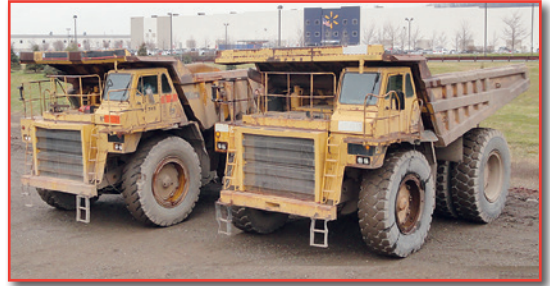
CAT 777B END DUMPS