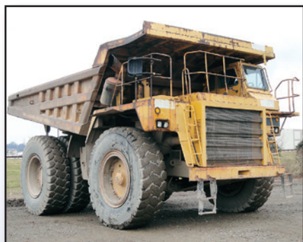
'90 CAT 777B

1990 CATERPILLAR Model 777B, 85 Ton End Dump , s/n 4YC01257, powered by Cat 3508 diesel engine and powershift transmission, equipped with heated dump body (not connected) with bed liners, supplemental steering, retarder, rock ejectors, enclosed ROPS cab, and 27.00R49 tires. In good condition with fair front and good rear tires. (Meter Reads 39,635 Hours) (Odometer Reads 490,936 Miles)