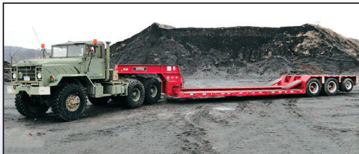
'91 GENERAL M931A2 AND '76 ROGERS 60 TON

1991 GENERAL Model M931A2, 5 Ton, 6x6 Tandem Axle Military Truck Tractor , VIN# 3102742, powered by Cummins 8.3L, 237HP diesel engine and 5 speed automatic transmission, equipped with wetline kit with Honda GX390 gas engine, spring suspension, canvas roof, tow package with pintle, air and electric, rear auxiliary hydraulics, and Michelin 16.00R20 tires. In good condition with excellent (new) tires. (Odometer Reads 21,722 Miles) (Meter Reads 0,708 Hours)