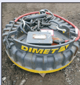
UNUSED '18 DIMET DTM 53"

UNUSED 2018 DIMET Model DTM, 53" Electromagnet Attachment , s/n 8140, type 135, 220 volt/46 amp. In excellent condition. (3,859 lb Magnet Weight)