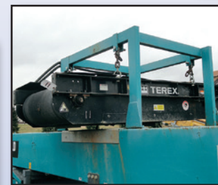
'15 TEREX TX440

Belt Magnet Tower Consisting of: IMI 36" x 66" Suspended Hydraulic Belt Magnet , s/n 25895, with suspension tower measuring 20' high x 10' wide with (4) manual cable winches for adjustable suspension height. In good condition. (Seller will assist loading; Buyer can cut on premises with proper Insurance and Workers Compensation Certificates)