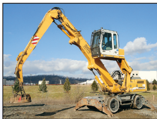
'02 LIEBHERR A904

2002 LIEBHERR Model A904 Rubber Tired Hydraulic Excavator , s/n 66611230, powered by Liebherr diesel engine and powershift transmission, equipped with Mozelt CoolGen 4, 13KW belt-driven generator, approximately 44" electromagnet attachment, auxiliary hydraulics, elevating enclosed ROPS cab, (4) hydraulic outriggers, and 10.00-20 solid tires. In good condition with fair tires. (Meter Reads 18,399 Hours) (Newer Magnet Generator)