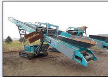
'16 EZYSTACK TR6536 (MAGNET SOLD SEPARATELY)

2016 EZYSTACK Model TR6536 Hydraulic Crawler Conveyor , s/n 2312, powered by Cat 4 cylinder diesel engine, equipped with 36"x65' conveyor with feed hopper, hydraulic raise/lower, and 24' folding head section with magnetic head pulley, umbilical remote, 120" crawlers, and 16" TBG pads. In good to very good condition with good to very good undercarriage. (Meter Reads 1,588 Hours) (10,000 kg /22,046 lb Machine Weight)