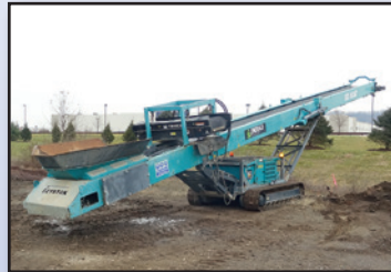
'16 EZYSTACK TR6536 (MAGNET SOLD SEPARATELY)

2016 EZYSTACK Model TR6536 Hydraulic Crawler Conveyor , s/n 2277, powered by Cat 4 cylinder diesel engine, equipped with 36"x65' conveyor with feed hopper, hydraulic raise/lower, and 24' folding head section with magnetic head pulley, umbilical remote, 120" crawlers, and 16" TBG pads. In good condition with good undercarriage. (Meter Reads 2,621 Hours) (10,000 kg/22,064 lb Machine Weight)