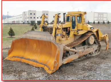
87 CAT D11N

1440 COWPATH RD. • HATFIELD, PA 19440 215/361-9099 • Fax: 215/361-9212 www.hunyady.com