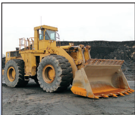
'81 CAT 992C

1981 CATERPILLAR Model 992C Rubber Tired Loader , s/n 42X00987, powered by Cat 3412 diesel engine and powershift transmission, equipped with spade-nose bucket with teeth, Loadrite L2180 scale system, ROPS over enclosed cab, and 45/65R45 L5 tires. In good condition with very good, good, and fair tires. (Meter Reads 52,616 Hours)