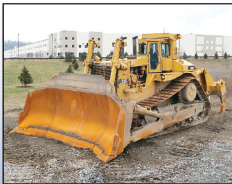
'87 CAT D11N

1987 CATERPILLAR Model D11N Crawler Tractor , s/n 74Z00394, powered by Cat 3508 diesel engine and powershift transmission, equipped with U-blade with dual tilt cylinders, 4-barrel 3-shank ripper, ROPS over enclosed cab with heat, and 36" SBG pads. In good condition with good undercarriage. (Meter Reads 40,385 Hours)