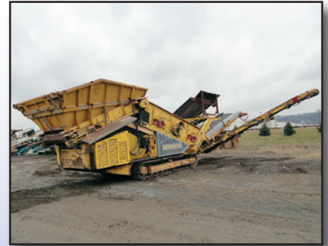
'07 KEESTRACK FRONTIER

2007 KEESTRACK Model Frontier Crawler Hydraulic Screening Plant , s/n 492, powered by Deutz 4 cylinder liquid-cooled diesel engine, equipped with feed hopper with hydraulic folding wings, 50"x12'6" steel apron feeder, 5'10"x14'9" 2-deck vibratory screen with 4" steel punch plate and 1/4" wire screen material, 17' collection conveyor, 54"x21'4" main discharge conveyor with hydraulic folding head section, (2) 32"x22' side discharge conveyors with hydraulic raise/lower and remote operation (one with folding head section), radio and umbilical remotes, 14'6" crawlers, and 18" TBG pads. In good condition with fair to good undercarriage. (Meters Read 3,800 & 19 Hours) (Less Than 50 Hours on Rebuilt Deutz; New Screen Main Bearings)