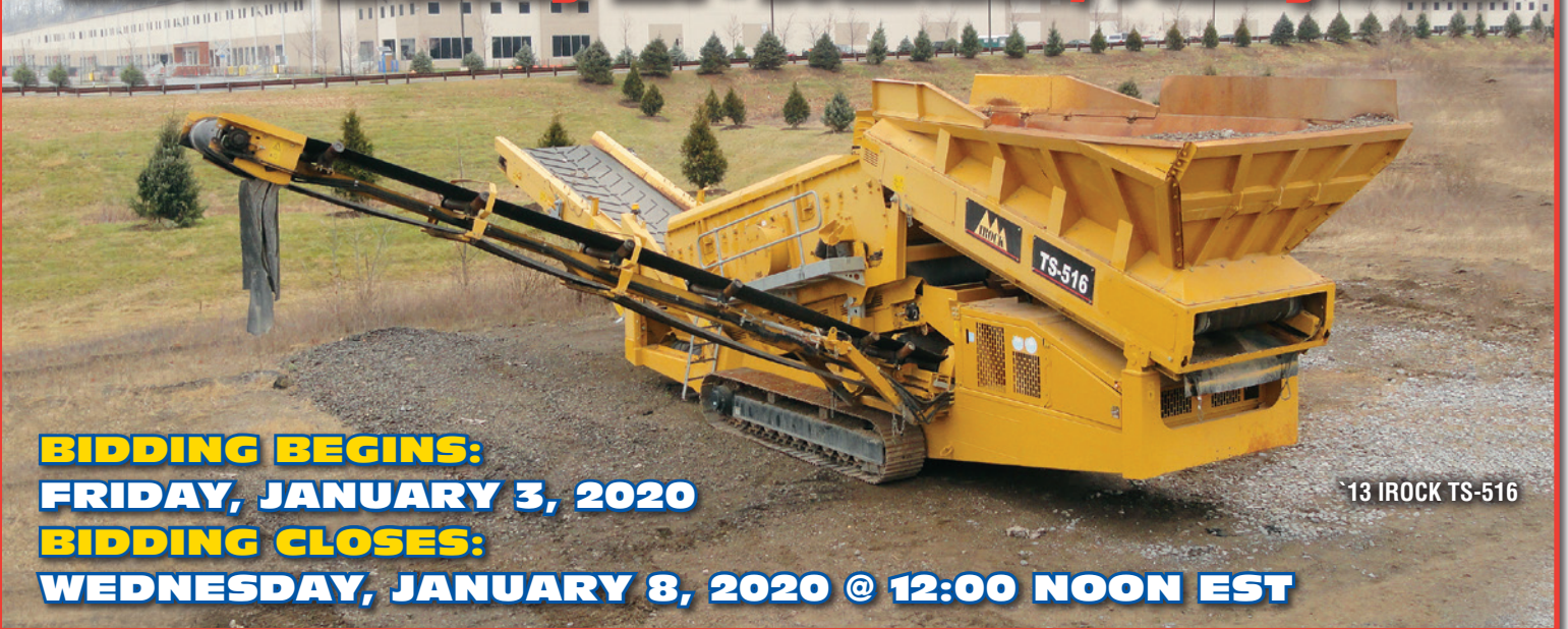
13 IROCK TS-516

Material Recovery LLC - Bethlehem, Pennsylvania