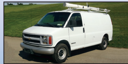
'01 CHEVY EXPRESS 2500

2001 CHEVROLET Express 2500 Panel Van , Vortec 4.3L gas engine and automatic trans, e/w material rack, tow package, ac, and 225/75R16 tires. In good condition with good tires.