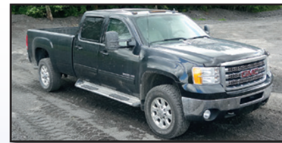
'13 GMC 3500HD 4X4

2013 GMC 3500HD Sierra SL 4x4 Crew Cab Pickup Truck , Duramax 6.6 HD diesel engine and Allison automatic trans, e/w 8' bed, tow package, running boards, alloy wheels, power windows, locks, and mirrors, power heated seats, dual driver settings, sunroof, leather interior, cruise control, ac, and 275/70R18 tires. In good condition with good tires. (Purchased New)