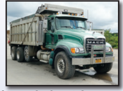
05 MACK CV713 GRANITE

2005 MACK CV713 Granite Tri-Axle Dump Truck , Mack E-tech 460HP diesel engine and Maxitorque T318L/RL/LR21, 18 speed trans, e/w J&J 19' aluminum dump body with electric tarp and chute, 46,000# rears, 20,000# front and 20,000# steerable lift axle, block/beam suspension, 2-stage engine brake, aluminum wheels, 86,000# GVWR, power windows and locks, heated mirrors, cruise control, ac, 425/65R22.5 front and 11R22.5 lift and rear tires. In good condition with good tires. (Purchased New)