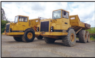
(2) '89 CAT D550B

cab, and 33.25R39 tires. In good condition with good tires. (Purchased New)