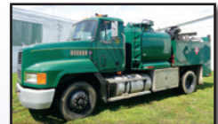
94 MACK CH612

1994 MACK CH612 Single Axle Fuel/Lube Truck , Mack E7-300, 300HP diesel engine and Fuller 10 speed trans, e/w 2001 Curry Supply 16' fuel/lube body with 800 gallon fuel tank, Atlas Copco 2-stage hydraulic air compressor, (5) product tanks, waste oil tank, fuel reel with gallon indicator, self-winding hose reels, spring suspension, heated mirrors, cruise control, ac, and 285/75R24.5 tires. In good condition with good tires.