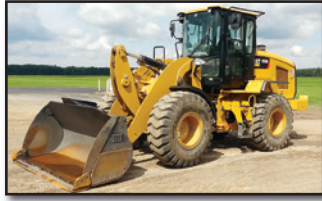
'17 CAT 926M

2017 CATERPILLAR 926M Rubber Tired Loader , s/n LTE04397, Cat C-7.1 diesel engine and powershift trans, e/w Cat 2.7 cubic yard, general purpose loader bucket with bolt-on cutting edge, hydraulic coupler, power heated mirrors, enclosed ROPS cab with heat and ac, and 20.5x25 tires. In very good condition with good to very good tires. (668 Hours)