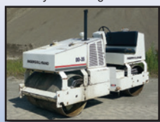
87 IR DD-35

1987 INGERSOLL-RAND DD-35 Tandem Vibratory Roller , s/n 8161S, Deutz 2 cylinder diesel engine and hydrostatic trans, e/w 40" smooth drums, drum cleaners, and water system. In good condition.