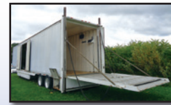
'85 DORSEY CAR HAULER

1985 DORSEY DFVPT-83-E, 48' Tandem Axle Aluminum Car Haul Trailer , e/w 99" inside width, 112-7/8" inside height, fiberglass nose cone, swing side doors, hydraulic car lift, hardwood floor, 18' rear hydraulic car lift, electric hydraulic pump, air ride suspension, 58,540# GVWR, aluminum wheels, Honda EM5000SX gas generator, CD player, and 255/70R22.5 tires. In good condition with very good tires.