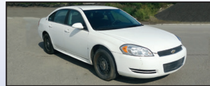
'09 CHEVY IMPALA

2009 CHEVROLET Impala 4-Door Sedan , 3.9L gas engine and automatic trans, e/w power windows, locks, mirrors, and seats, ac, and 225/60R16 tires. In good condition with good tires.