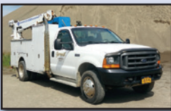
99 FORD F550XL

1999 FORD F550XL Super Duty Service Truck , 7.3L diesel engine and automatic trans, e/w 11' open service body with spray on liner, Auto Crane 6006H service boom, Miller Bobcat 225NT welder generator, Onan 21HP gas engine (1,683 hours), Champion R Series 2-stage air compressor, Kohler Command Pro 429cc gas engine, tow package, bumper vise, running boards, ac, (2) manual extending outriggers, and 225/70R19.5 tires. In good condition with good tires.