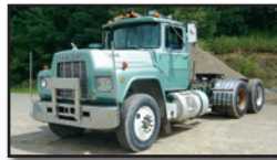
'87 MACK R688ST

1987 MACK R688ST Tandem Axle Truck Tractor , E7-350, 350HP diesel engine and Mack 12 speed trans, e/w 44,000# rears and 12,000# front axle, wetline, air ride suspension, Dynatard engine brake, 56,000# GVWR, 186" wheelbase, heated mirrors, and ac. In good condition with good tires. (Purchased New)