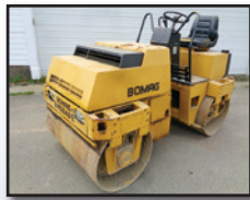
94 BOMAG BW120AD-2

1994 BOMAG BW120AD-2 Tandem Vibratory Roller , s/n 101170500980, Deutz 2 cylinder diesel engine and hydrostatic trans, e/w 47" smooth drums, drum cleaners, and water system. In good condition.