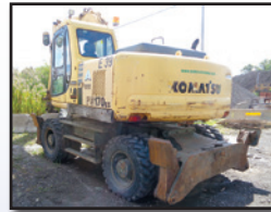
'99 KOMATSU PW170ES

1999 KOMATSU PW170ES Rubber Tired Excavator , s/n K30386, Komatsu diesel engine and hydraulic drive, e/w 9'6" dipper stick, 36" digging bucket, auxiliary hydraulics, enclosed ROPS cab with heat, (4) hydraulic outriggers, and 10.00x20 tires. In fair to good condition with good tires. (Grapple Not Included) (UC)