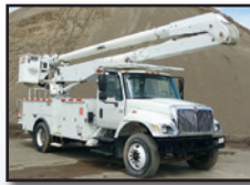
'05 INTERNATIONAL WITH ALTEC 55'

2005 INTERNATIONAL 7300 Single Axle Bucket Truck , International DT466 diesel engine and Allison automatic trans, e/w 2006 Altec AA755L 55' aerial lift, s/n 0604BZ3008, insulated upper boom, lower boom insert, 350# capacity single man basket, material handling jib, upper hydraulic tool outlets, 21,000# rear and 12,000# front axle, full line body, tow package with air, 33,000# GVWR, cab protector, cruise control, ac, (4) hydraulic outriggers, and 11R22.5 tires. In good condition with good tires.