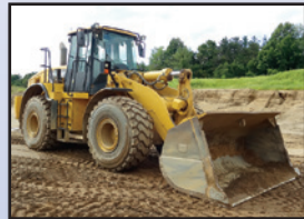
'08 CAT 972H

2008 CATERPILLAR 972H Rubber Tired Loader , s/n A7D00675, Cat C-13 Acert diesel engine and powershift trans with auto shift, e/w Cat CWTS-A/AP custom loader bucket with bolt-on cutting edge, ride control, bucket scale, twin automatic greasing system, enclosed ROPS cab with heat and ac, and 26.5R25 tires. In good condition with good tires. (Purchased New)