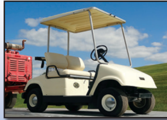
YAMAHA GOLF CART

JOHN DEERE Gator 4x2 All Terrain Vehicle , s/n W004XZX044946, Kawasaki gas engine and direct drive trans, e/w dump body and 25x13-9 tires. In fair condition with poor front and good rear tires. (UC)