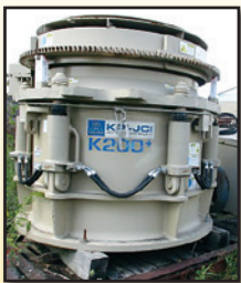
UNUSED '13 PIONEER KPI-JCI ASTEC K200+

(OFFERED SUBJECT TO OWNER'S IMMEDIATE CONFIRMATION)