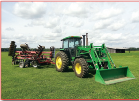
'89 JD 4450 4X4 AND CASE-IH RMX340

PRE-SORTED FIRST CLASS MAIL US POSTAGE PAID UPPER DARBY, PA PERMIT #45