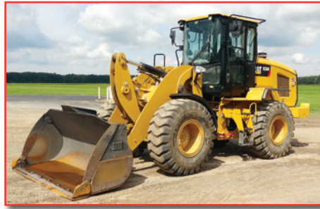
'17 CAT 926M

1440 COWPATH RD. • HATFIELD, PA 19440 215/361-9099 • Fax: 215/361-9212 www.hunyady.com