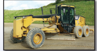
'09 CAT 140M VHP

2009 CATERPILLAR 140M VHP Motor Grader , s/n B9M00742, Cat C-7 Acert diesel engine and powershift trans, e/w 14' fully hydraulic moldboard with teeth, rear scarifier with (3) shanks, front push block, joystick controls, enclosed ROPS cab with heat and ac, and 17.5R25 tires. In good to very good condition with fair tires. (3,729 Hours)