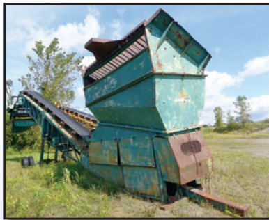
'91 POWERSCREEN MARK II

(2) Silos, with structure (Sold in Absentia) • (3) KRUGER 3R-111 Slurry Pumps , s/n B020183-13, s/n B020183-12, s/n B020183-6, e/w 400GPM, 84' head, 1.15 SG. In good condition. • DURALINE MLP57075X10 Truck Scale , s/n 991075, complete with load cells • (2) 20' Metal Stair Towers • 3"x5" Lab Jaw Crusher