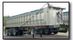
'05 J&J 34'

2005 J&J 34' Tri-Axle Aluminum Dump Trailer , e/w Roll-Rite electric tarp, poly bed liner, single chute, air ride suspension, 80,000# GVWR, aluminum wheels, 11R22.5 rear and 425/65R22.5 lift tires. In good condition with fair to good tires. (Purchased New)