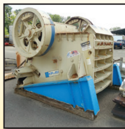
'07 PIONEER KPI-JCI ASTEC 3055

UNUSED 2013 PIONEER KPI-JCI/ASTEC K200+ Cone Crusher, s/n C110634, rated at 385TPH 2007 PIONEER KPI-JCI/ASTEC 3055, 30"x55" Jaw Crusher, s/n 407954, 200HP, electric motor. In good condition. (New Dies Installed) (Spare Parts Included)