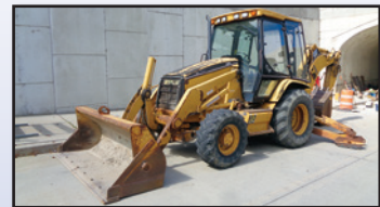
'98 CAT 416C 4X4

1998 CATERPILLAR 416C, 4x4 Tractor Loader Extend-A-Hoe , s/n 4ZN07348, Cat diesel engine and powershift trans, e/w general purpose loader bucket with bolt-on cutting edge, 24" digging bucket, enclosed ROPS cab with heat, and 340/80R18 front and 19.5LR24 rear tires. In good condition with fair tires. (UC)