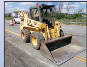
'03 GEHL SL6635DXT II

1999 GEHL SL6635DXT Skid Steer Loader , s/n 11942, Deutz 4 cylinder diesel engine and hydrostatic trans, e/w 72" general purpose loader bucket, high flow auxiliary hydraulics, roof mounted poly water tank, and 12x16.5 tires. In good condition with fair to good tires. (UC)