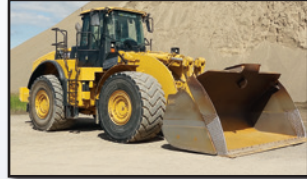
'11 CAT 980H

2011 CATERPILLAR 980H Rubber Tired Loader , s/n JMS05900, Cat C-15 Acert diesel engine and powershift trans with auto shift, e/w Cat 9.8 cubic yard general purpose loader bucket with bolt on cutting edge, bucket scale, enclosed ROPS cab with heat and ac, and 875/65R29 tires. In good condition with good tires. (Purchased New)