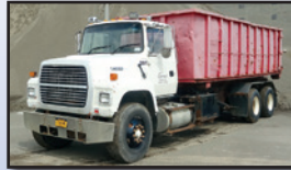
'95 FORD L9000 (CONTAINER NOT INCLUDED)

1995 FORD L9000 Tandem Axle Roll-Off Truck , Cat 3406 diesel engine and Fuller 9 speed trans, e/w 1994 American AR0602410, 24' roll-off body, s/n C-8-1486, Jacobs 2-stage engine brake, spring/beam suspension, tow package with air, ac, and 11R22.5 tires. In fair condition with very good front and good rear tires.