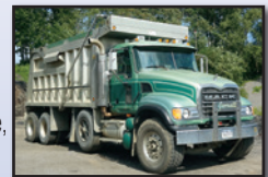
04 MACK CV713 GRANITE

2004 MACK CV713 Granite Tri-Axle Dump Truck , Mack E-tech 460HP diesel engine and Maxitorque T318L/RL/LR21, 18 speed trans, e/w J&J 18' aluminum dump body with electric tarp, 46,000# rears, 20,000# front and 20,000# steerable lift axle, camelback suspension, 2-stage engine brake, aluminum wheels, power windows and locks, heated mirrors, cruise control, ac, 425/65R22.5 front and lift tires, and 11R22.5 rear tires. In good condition with fair to good front and lift and very good rear tires. (Purchased New)