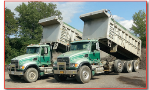
(2) OF (3) MACK CV713 GRANITE TRI-AXLES

PRE-SORTED FIRST CLASS MAIL US POSTAGE PAID UPPER DARBY, PA PERMIT #45