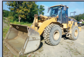
'03 CAT 972G SERIES II

2003 CATERPILLAR 972G Series II Rubber Tired Loader , s/n ANY00331, Cat diesel engine and powershift trans with auto shift, e/w 5.75 cubic yard general purpose bucket with bolt-on cutting edge, ride control, fingertip bucket controls, bucket scale, enclosed ROPS cab with heat and ac, and 26.5R25 tires. In good condition with good tires. (Purchased New)