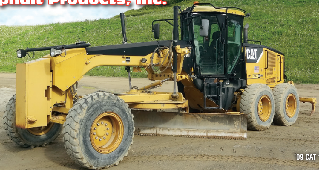
'09 CAT 140M VHP

WEDNESDAY, OCTOBER 16, 2019 - 9:00AM Delevan, New York (45 Miles Southeast of Buffalo)