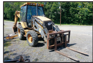
'97 CAT 416CIT 4X4 (FORKS SOLD SEPARATELY)

1997 CATERPILLAR 416C IT, 4x4 Tractor Loader Extend-A-Hoe , s/n 1WR00593, Cat diesel engine and shuttle trans, e/w general purpose loader bucket with bolt-on cutting edge, 24" digging bucket, hydraulic front coupler, front auxiliary hydraulics, enclosed ROPS cab with heat, and 12.5/80-18 front and 19.5Lx24 rear tires. In good condition with fair to poor and (1) good tires. (UC)