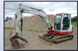
'01 TAKEUCHI TB145

2001 TAKEUCHI TB145 Mini Hydraulic Excavator , s/n 14511614, Yanmar 4 cylinder diesel engine and hydraulic drive, e/w swing boom, 68" dipper stick, CP 24" digging bucket, hydraulic thumb, 72" backfill blade, Tag manual coupler, enclosed ROPS cab with heat, and 16" rubber tracks. In good condition with fair tracks. (1,469 Hours)