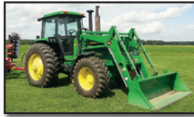
89 JOHN DEERE 4450 4X4

1989 JOHN DEERE 4450, 4x4 Utility Tractor , s/n 027851, John Deere 140HP diesel engine and 15 speed powershift trans, e/w 2009 John Deere 740 Classic loader attachment with general purpose bucket with bolt-on cutting edge, 3-point hitch, adjustable drawbar, PTO, electric outlet, dual hydraulic outlets, enclosed ROPS cab with heat and ac, 16.9R26 front and 20.8R28 rear tires. In very good condition with very good tires. (2,185 Hours) (Purchased New)