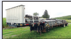
'98 FONTAINE 48'

1983 CMI Tri-Axle Drop Side Lowboy Trailer , e/w ground bearing detachable gooseneck, 30" drop sides, 12' over axles, wetline, air ride suspension, outriggers, chain dogs, and 10.00R15 tires. In fair condition with good tires.