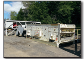
UNUSED CEDARAPIDS 6'X20'

UNUSED 2007 CEDARAPIDS 5220-15, 52"x20' Vibrating Grizzly Feeder , s/n 54688, 22" side sheets, (5) 60" adjustable tapered grizzly bars, with Primary Crusher charging hopper (Not Assembled): 50 ton minimum capacity, 20' wide loader hopper, bolt-on wings and rock back box.