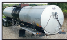
'93 ETNYRE 8,000 GALLON

1993 ETNYRE 8,000 Gallon Tandem Axle Asphalt Tanker , e/w spring suspension and 11.00x22 tires. In fair to good condition with good tires. (No Title - Sold With Bill of Sale Only)