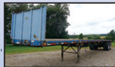
'98 FONTAINE 45'

1998 FONTAINE 48' Spread Axle Step Deck Trailer , e/w 10' upper deck, 38' lower deck, 102" width, 10'2" axle spread, air ride suspension, ratchet straps, aluminum headache rack, and 255/70R22.5 tires. In good condition with good tires.