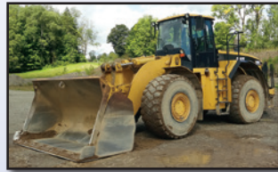
'02 CAT 980G SERIES II

2002 CATERPILLAR 980G Series II Rubber Tired Loader , s/n AWH00486, Cat diesel engine and powershift trans with auto shift, e/w Rockland general purpose loader bucket with bolt-on cutting edge, ride control, fingertip controls, bucket scale, enclosed ROPS cab with heat and ac, and 29.5R25 tires. In good condition with fair to good tires. (Purchased New)