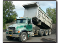
05 MACK CV713 GRANITE

2005 MACK CV713 Granite Tri-Axle Dump Truck , Mack E-tech 460HP diesel engine and Maxitorque T318L/RL/LR21, 18 speed trans, e/w J&J 19' aluminum dump body with electric tarp and chute, 46,000# rears, 20,000# front and 20,000# steerable lift axle, block/beam suspension, 2-stage engine brake, aluminum wheels, 86,000# GVWR, power windows and locks, heated mirrors, cruise control, ac, 425/65R22.5 front and 11R22.5 lift and rear tires. In good condition with good tires. (Purchased New)