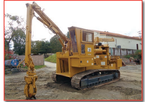
'01 BANDIT 1900