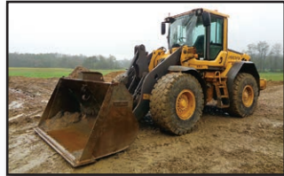
11 VOLVO L70F

Loader Attachments: VERMEER TS60S Hydraulic Tree Spade Attachment • (3) ACS 84" Heavy Duty Fork Attachments • Assorted Broom and Root Rake Attachments • General Purpose Loader Buckets Backhoe Attachments: CAT 24" Digging Bucket (Cat 430) • 48" Cleanup, 36" & 24" Digging Buckets (Cat 426) • Hydraulic 4-in-1 Loader Bucket (Cat 426) • Assorted Digging and Cleanup Buckets