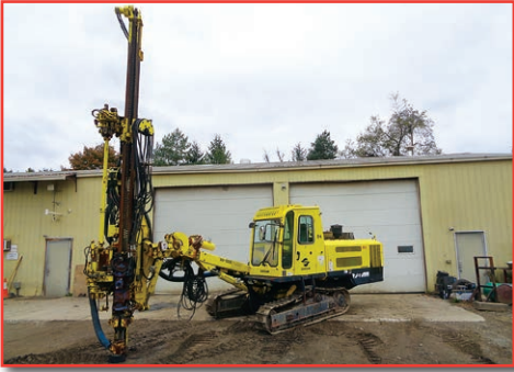
'07 SOOSAN SD-1000E

PRE-SORTED FIRST CLASS MAIL US POSTAGE PAID UPPER DARBY, PA PERMIT #45