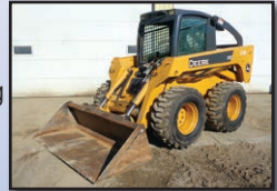
05 JD 332