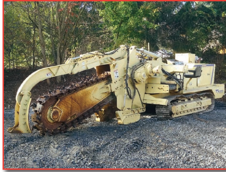
'96 TESMEC TRS900-SLO

1440 COWPATH RD. • HATFIELD, PA 19440 215/361-9099 • Fax: 215/361-9212 www.hunyady.com