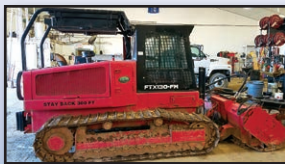
'06 FECON FTX130-FM

2006 FECON Model FTX130-FM Crawler Mulcher , s/n 0270406, powered by Deutz dsl engine and hydrostatic transmission, equipped with 54" mulching head, EROPS cab with heat and ac. In good condition with good u/c. (1,902 Hours)