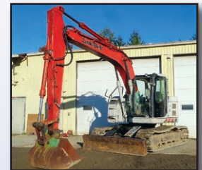
'05 LINK-BELT 135

2003 LINK-BELT 160LX , s/n 160Q3-1357, Isuzu dsl engine and hydraulic drive, e/w 9' dipper stick, digging bucket, auxiliary hydraulics, hydraulic coupler, EROPS with heat and ac, and 23.5" TBG pads. In good condition with good u/c.