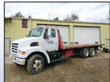
'00 STERLING WITH JERR-DAN 28'

1984 INTERNATIONAL 1954 Single Axle Flatbed Truck • 2005 FORD F-550XL Super Duty Flatbed Truck