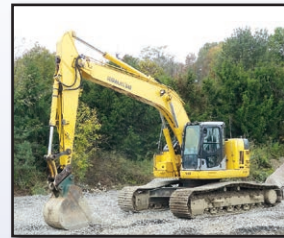
'04 KOMATSU PC308USLC-3

2004 CATERPILLAR 330CL , s/n DKY02573, Cat dsl engine and hydraulic drive, e/w 9' dipper stick, digging bucket, auxiliary hydraulics, Cat hydraulic coupler, thumb bracket, EROPS with heat and ac, and 33.5" TBG pads. In good condition with good u/c.