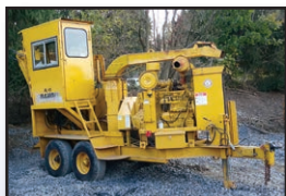
'99 BANDIT 1850XP

and 11R17.5 tires. In good condition with good tires.