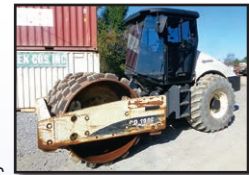
05 IR SD100F-TF

MUELLER T118 Soil Compactor , s/n 9509, Cat 3208 dsl engine and powershift transmission, e/w 36" padfoot compactor wheels with weld-on feet, 9' backfill blade, and ROPS canopy with sweeps. In good condition.