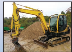
'05 HYUNDAI ROBEX 55-7

s/n 1836, Komatsu S4D95LE-3 dsl engine and hydraulic drive, e/w swing boom, 7'3" dipper stick, digging bucket, auxiliary hydraulics, Geith hydraulic coupler, 91" backfill blade, EROPS with heat and ac, and 18" TBG pads. In good condition with good u/c.