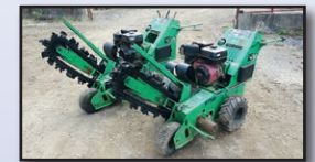
(2) '05 VERMEER RT100

1990 VERMEER LM35 Combination Trencher/Cable Plow, s/n 1VRF062A1L1000901, Deutz dsl engine and hydrostatic transmission, e/w 48" trencher bar, LP18 cable plow attachment. In fair to good condition.