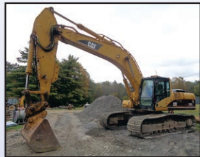
'04 CAT 330CL

2004 KOMATSU PC308USLC-3 , s/n 20036, Komatsu dsl engine and hydraulic drive, e/w 10' dipper stick, digging bucket, auxiliary hydraulics, JRB hydraulic coupler, EROPS with heat and ac, and 31.5" TBG pads. In good condition with good u/c.