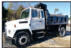
'98 MACK CS300P

1998 MACK CS300P Single Axle Dump Truck , Renault 6 cylinder dsl engine and 6 speed transmission, e/w 10' steel dump body, spring suspension, tow package, and 11R22.5 tires. In fair to good condition with fair to good tires.