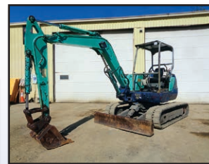
'02 IHI 45NX

hydraulics, 57" backfill blade, ROPS canopy, and 12" rubber tracks. In fair to good condition with good tracks.