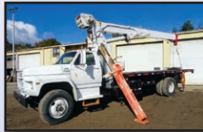
'94 FORD WITH JLG 12.5 TON

1994 FORD F-700 Single Axle Boom Truck, dsl engine and 5 speed transmission with 2 speed rear, e/w 1994 JLG 1250JBT, 12.5 ton boom, s/n 0400002705, with 22.6' - 56' 3-section hydraulic boom, weighted hook, anti-two block, 20' flatbed, 21,000# rear and 12,000# front axle, spring suspension, 33,000# GVWR, (4) hydraulic outriggers, and 11R22.5 tires. In fair to good condition with fair to good tires.