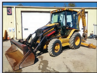
05 CAT 420D IT 4X4