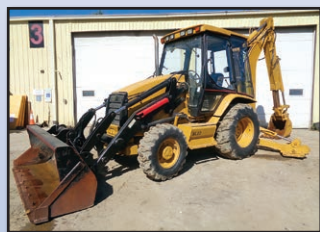
98 CAT 426C IT 4X4