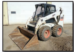
04 BOBCAT S185

LARGE QUANTITY: Rock Saws • Brooms • Hydraulic Angle Blades • Root Rakes • Landscape Rakes • Cold Planer Attachments • Grapple Attachments • Trencher Attachments • Loader Buckets • Fork Attachments