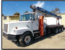
'98 VOLVO WITH MANITEX 22 TON

1998 VOLVO Tri-Axle Boom Truck, Cat 3306C, 300HP dsl engine and Fuller 9 speed transmission, e/w 1998 Manitex 2277, 22 ton boom, s/n 36642, 29' - 77' 3-section hydraulic boom, single sheave hook block, 22' steel flatbed with ratchet straps, 40,000# rears, 20,000# front axle, spring/walking beam suspension, Jacobs 2-stage engine brake, ac, (4) hydraulic outriggers, 425/65R22.5 front, 255/70R22.5 tag, and 11R22.5 rear tires. In good condition with good tires.