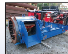
'03 AMERICAN AUGERS 42-600

RICHMOND 24D Horizontal Boring Machine • BOR-IT 24" Horizontal Boring Machine • (2) AUGERS UNLIMITED Horizontal Boring Machines • Horizontal Hydraulic Boring Machine • LARGE QUANTITY Augers, up to 24"