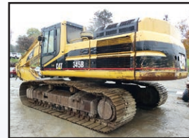
'98 CAT 345BL

1998 CATERPILLAR 345BL , s/n 4SS01079, Cat dsl engine and hydraulic drive, e/w 10' dipper stick, digging bucket, auxiliary hydraulics, Hendrix hydraulic coupler, thumb bracket, EROPS with heat and ac, and 35.5" TBG pads. In good condition with fair to good u/c.