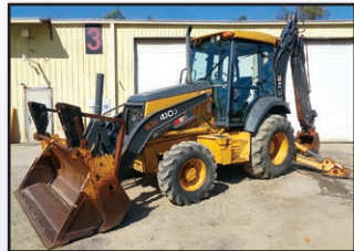
09 JD 410J 4X4