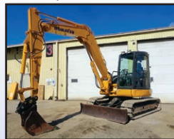
'07 KOMATSU PC78MR-6

2005 HYUNDAI Robex 55-7 Hydraulic Mini Excavator , s/n M80111327, Yanmar 4 cylinder dsl engine and hydraulic drive, e/w swing boom, 7'2" dipper stick, digging bucket, dual function auxiliary hydraulics, manual coupler, 76" backfill blade, thumb bracket, and 15.5" rubber tracks. In good condition with good tracks.