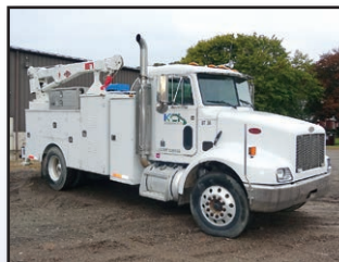
'00 PETERBILT 330

21,000# rear and 12,000# front axle, 33,000# GVWR, aluminum wheels, work lights, heated mirrors, ac, cruise control, (2) manual stabilizers, and 11R22.5 tires. In good condition with good tires. (180,211 Miles)