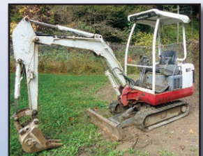
'05 TAKEUCHI TB16

1996 AIRMAN AX25-2 Hydraulic Mini Excavator , s/n 847B020444, Kubota dsl engine and hydraulic drive, e/w swing boom, 58" dipper stick, digging bucket, auxiliary