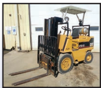
CAT V50-B 5,000#

1995 CRACKPRO 400 Tack Melter/Applicator , s/n 951521005, Kubota 3 cylinder dsl engine • (2) 1995 & 1993 CRAFCO EZ Pour 200 Gallon Tack Melter/Applicators , Isuzu 3 cylinder dsl engine • 2004 GARLOCK Genesis 612 Portable Tar Kettle , Honda 9HP gas engine • NEAL Asphalt Heater