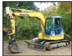
'07 KOMATSU PC78US-6NO

s/n 1836, Komatsu S4D95LE-3 dsl engine and hydraulic drive, e/w swing boom, 7'3" dipper stick, digging bucket, auxiliary hydraulics, Geith hydraulic coupler, 91" backfill blade, EROPS with heat and ac, and 18" TBG pads. In good condition with good u/c.