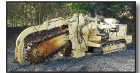
'96 TESMEC TRS900-SLO

1996 TESMEC TRS900-SLO Crawler Trencher, s/n 9169, Cummins 6CTA8.3-P dsl engine and hydraulic drive, e/w 9' trencher bar with hydraulic crumber, side discharge conveyor, hydraulic stabilizers, and 20" TBG pads. In good condition with good u/c.