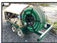
'06 FINN BB-302

1997 FINN T80 Portable Hydroseeder , s/n BU-1255, Hatz 2 cylinder dsl engine, e/w 9-14.5 tires. In fair to poor condition with fair tires.