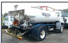
'94 FORD WITH 2,200 GALLON

1987 INTERNATIONAL 1954 Single Axle Fuel Truck , International dsl engine and 5 speed transmission with 2 speed rear axle, e/w Trans-Tec 2,800 gallon 3-compartment aluminum fuel tank, rear mounted hose reel, meter and ticket printer, air brakes, 188" wheelbase, and 11R22.5 tires. In fair condition with fair to good tires.