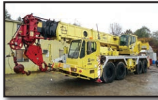
'93 GROVE AT-750B

1993 GROVE AT-750B TM750B, 50 Ton All Terrain Crane, s/n 78285, Cummins LTA10-C dsl engine, e/w 35'-110' 4-section hydraulic boom, main and auxiliary hoists, Johnson 35 ton 2-sheave hook block, 7.5 ton ball, PAT DS350GW LMI and anti-2 block system, propane heated cab, mounted on 1993 Grove 8850G, 8x8 carrier, 6 speed automatic transmission with 2 speed reverse, Jacobs 2-position engine brake, (4) hydraulic outriggers, and 17.5R25 tires. In good condition. (Road Worthiness of Tires Questionable)