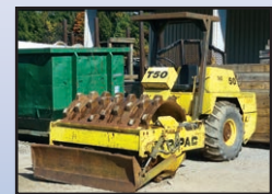
97 COMPAC T50PDB