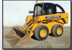
02 JD 260