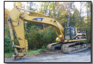
'98 CAT 345BL

VERY LARGE QUANTITY Excavator Attachments: Demo Hammers • Frost Tooth Attachments • Digging Buckets • Cleanup Buckets • Dipper Sticks