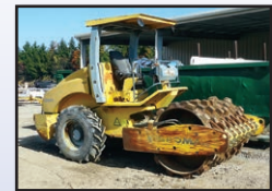
05 VIBROMAX VM66PD