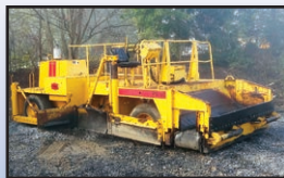
BLAW KNOX RW100

BLAW KNOX RW100 Road Widener , s/n 10009-03, John Deere dsl engine and hydrostatic transmission, e/w 10' conveyor and 385/65R22.5 tires. In good condition with fair tires.