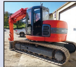
'96 HITACHI EX135UR

2005 LINK-BELT 135 Spin Ace , s/n EBAJ59472, dsl engine and hydraulic drive, e/w 9' dipper stick, auxiliary hydraulics, 8'9" backfill blade, EROPS with heat and ac, and 23.5" street pads.