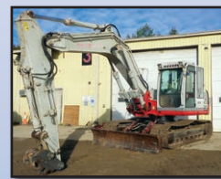
'07 TAKEUCHI TB1140