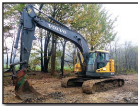
(1) OF (2) '10 VOLVO ECR235C