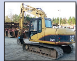
'02 CAT 312C

2007 TAKEUCHI TB1140 , s/n 51401028, Isuzu 4 cylinder dsl engine and hydraulic drive, e/w swing boom, 8'6" dipper stick, digging bucket, auxiliary hydraulics, manual coupler, 8'6" backfill blade, EROPS with heat and ac, and 23.5" TBG pads. In good condition with good u/c.