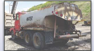
'89 WHITE/GMC 2,000 GALLON

1989 WHITE/GMC Tandem Axle Water Truck, powered by Detroit Series 60 diesel engine and Fuller 13 speed transmission, equipped with approximately 2,000 gallon water body, Pacer 2" pump, Honda GX160 gas engine, spring suspension, cruise control, 375/70R24.5 front and 11R24.5 rear tires. In fair condition with fair tires. (Off Road Only)