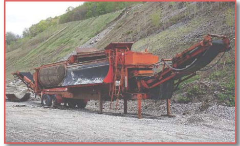
'03 FINLAY 770

PRE-SORTED FIRST CLASS MAIL US POSTAGE PAID UPPER DARBY, PA PERMIT #45