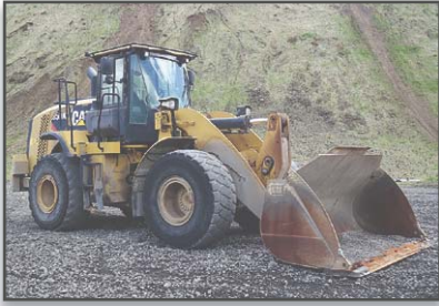
'13 CAT 950K

2013 CATERPILLAR Model 950K Rubber Tired Loader, s/n R4A01516, powered by Cat C7, (6) cylinder diesel engine and powershift transmission with auto shift, equipped with high lift configuration, general purpose loader bucket with bolt-on cutting edge, ride control, onboard scale, rearview camera, enclosed ROPS cab with heat and air conditioning, and 23.5R25 tires. In good condition with fair tires.