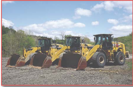
(3) '13 CAT 950K LOADERS

1440 COWPATH RD. • HATFIELD, PA 19440 215/361-9099 • Fax: 215/361-9212 www.hunyady.com