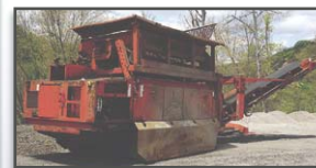
'02 FINLAY 596

2002 FINLAY Model 596 Crawler Screen, s/n FOB520094, powered by Deutz 4 cylinder diesel engine and hydraulic drive, equipped with vibrating grizzly with hydraulic raise, 42" transfer conveyor, 42" hydraulic oscillating discharge conveyor, umbilical remote control, and 16" TBG pads. In good condition with good undercarriage.