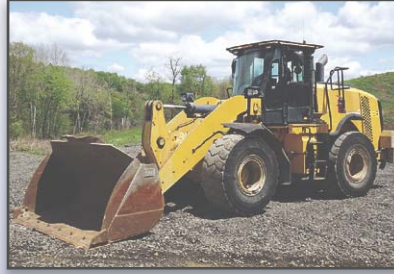
'13 CAT 950K

2013 CATERPILLAR Model 950K Rubber Tired Loader, s/n R4A01516, powered by Cat C7, (6) cylinder diesel engine and powershift transmission with auto shift, equipped with high lift configuration, general purpose loader bucket with bolt-on cutting edge, ride control, onboard scale, rearview camera, enclosed ROPS cab with heat and air conditioning, and 23.5R25 tires. In good condition with fair tires.