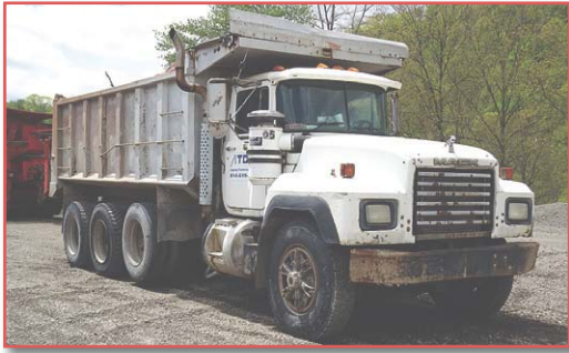
'98 MACK RD600GK

PRE-SORTED FIRST CLASS MAIL US POSTAGE PAID UPPER DARBY, PA PERMIT #45