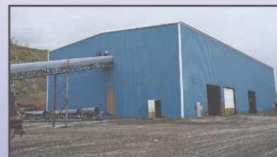
AMERICAN STEEL OPEN TRUSS STEEL BUILDING