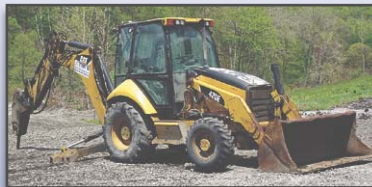
'08 CAT 420E 4X4 EXTEND-A-HOE

2008 CATERPILLAR Model 420E, 4x4 Tractor Loader Extend-A-Hoe, s/n HLS05448, powered by Cat (6) cylinder diesel engine and shuttle transmission, equipped with general purpose loader bucket with bolt-on cutting edge, hydraulic demolition hammer, 18" digging bucket, rear auxiliary hydraulics, and enclosed ROPS cab with heat. In fair condition with fair tires. (4x4 Not Operating)