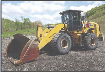
'13 CAT 950K

2013 CATERPILLAR Model 950K Rubber Tired Loader, s/n R4A01517, powered by Cat C7, (6) cylinder diesel engine and powershift transmission with auto shift, equipped with high lift configuration, general purpose loader bucket with bolt-on cutting edge, ride control, onboard scale, rearview camera, enclosed ROPS cab with heat and air conditioning, and 23.5R25 tires. In good condition with good tires.