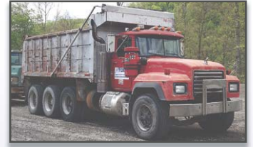
'96 MACK RD688S

1996 MACK Model RD688S Tri-Axle Dump Truck, powered by Mack E7 350 diesel engine and Fuller 8LL, 10 speed transmission, equipped with 17'6" steel dump body with electric tarp, 2-stage engine brake, 44,000# rears, camelback suspension, heated mirrors, air conditioning, 385/65R22.5 front and 11R24.5 rear and lift tires. In good condition with good tires.