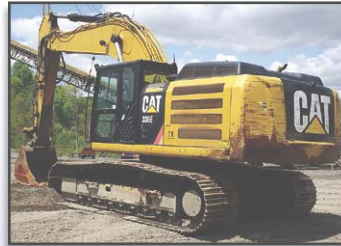
'13 CAT 336EL

2013 CATERPILLAR Model 336EL Hydraulic Excavator, s/n FJH00561, powered by Cat C9.3, (6) cylinder diesel engine and hydraulic drive, equipped with 11' dipper stick, 48" digging bucket, auxiliary hydraulics, rearview camera, enclosed ROPS cab with heat and air conditioning, pattern changer, and 33.5" TBG pads. In good condition with good undercarriage. (Wired For Magnet)