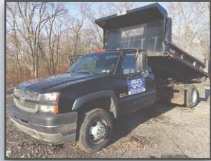
'03 CHEVY 3500

2003 CHEVROLET Model 3500 Silverado Single Axle Dump Truck , powered by Duramax 6.6L diesel engine and automatic transmission, equipped with Zoresco 10' steel dump body with electric/hydraulic hoist, tow package, dual rear wheels, cruise control, air conditioning, and 215/85R16 tires. In good condition with good tires. (Odometer Reads 86,740 Miles) (Purchased New)