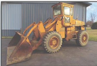
FIAT ALLIS 605B/545H

1969 FIAT ALLIS Model 605B/545H Rubber Tired Loader , s/n 2883, powered by Fiat 6 cylinder diesel engine and powershift transmission, equipped with general purpose loader bucket with bolt-on cutting edge, enclosed ROPS cab with heat, and 17.5x25 tires. In good condition with good tires. (Meter Reads 3,679 Hours)