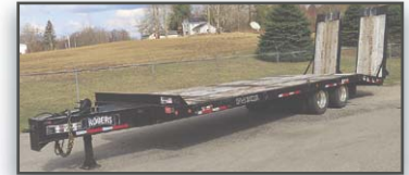
'21 ROGERS 21 TON

2021 ROGERS Model TAG21-30/102/2XSP, 21 Ton Tandem Axle Tag-A-Long Trailer , equipped with 24' level deck, 6' beavertail, 8' pneumatic ramps, 102" width, adjustable height pintle hitch, spring suspension, 52,140# GVWR, aluminum wheels, chain dogs, air brakes, and 235/75R17.5 tires. In good to very good condition with very good tires. (Purchased New)