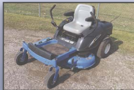
NEW HOLLAND MX18H

NEW HOLLAND MX18H Zero Turn Mower , s/n T04ZC0334, Intek 18HP gas, 40" mower deck