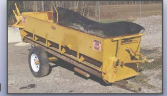
SEAL MASTER R20

(1) BLAW KNOX and (1) NEIL 550 Gallon Tow Behind Sealant Tanks , powered by Vanguard 16HP, V-Twin gas engine, mounted on tandem axle trailer with hydraulic pump and agitator, spring suspension, and 225/75D15 tires. (Neil Tank Has No Pump or Plumbing)