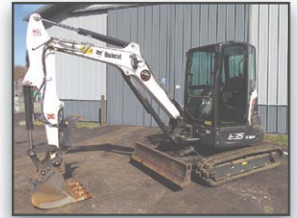
20 BOBCAT E35i

2020 BOBCAT Model E35i Mini Hydraulic Excavator , s/n B3Y215874, powered by Kubota 3 cylinder diesel engine and hydraulic drive, equipped with 5'6" dipper stick, Bobcat 24" digging bucket, swing boom, manual coupler, auxiliary hydraulics, 13" hydraulic thumb, pattern changer, 69" backfill blade, enclosed ROPS cab with heat and air conditioning, and 12" rubber tracks. In very good condition with good tracks. (Meter Reads 476 Hours) (5 Year Extended Warranty Good Until December 2024) (Purchased New) BOBCAT 36" Cleanup Bucket , with bolt-on cutting edge (E35i)