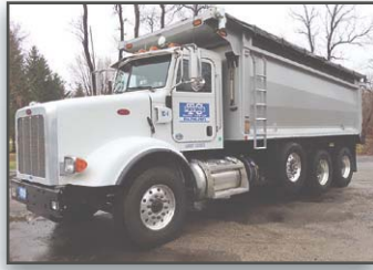
'16 PETERBILT 365

2016 PETERBILT Model 365 Tri-Axle Dump Truck , powered by Cummins ISX450 diesel engine and automatic transmission, equipped with Beau-Roc 18'6" steel dump body with chute, electric tarp, and air gate, 46,000# rears, 20,000# front axle, 20,000# steerable lift axle, 86,000# GVWR, spring suspension, aluminum wheels, power windows and locks, heated mirrors, cruise control, air conditioning, 315/80R22.5 front and lift tires, and 11R22.5 rear tires. In good to very good condition with very good tires. (Odometer Reads 145,412 Miles) (Meter Reads 8,614 Hours) (Purchased New)