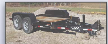
'19 CAM SUPERLINE TILT

2019 CAM SUPERLINE Model P35C Tandem Axle Tilt Trailer , equipped with 12' x 75" wood deck, deck shock absorber, adjustable height ball hitch, spring suspension, electric brakes, 8,050# GVWR, and 225/75R15 tires. In good condition with very good tires. (Purchased New)