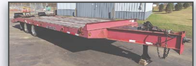
'08 ROGERS 20 TON

2008 ROGERS Model TAG20-28/102/2XSP, 20 Ton Tandem Axle Tag-A-Long Trailer , equipped with 22' level deck, 6' beavertail, (3) 7' ramps, 101.5" width, adjustable height pintle hitch, spring suspension, 48,810# GVWR, chain dogs, air brakes, and 215/75R17.5 tires. In good condition with good tires. (Purchased New)