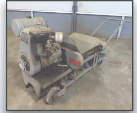
POWER CURBER 55A

POWER CURBER 55A Curb Machine , s/n 641229, Wisconsin 1 cylinder gas SEAL MASTER Model R20, 10' Truck Mount Aggregate Chip Spreader , s/n H2330-154, equipped with transport tires. In good condition with good tires. (Purchased New) CONCORD 9' Chip Spreader • 8' Chip Spreader