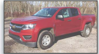
'16 CHEVY COLORADO 4X4

2016 CHEVROLET Model Colorado 4x4 Crew Cab Pickup Truck , powered by 3.6L, V-6 gas engine and automatic transmission, equipped with 5' bed with spray on liner, tow package, power windows, locks, mirrors, and seats, cruise control, air conditioning, and 265/70R16 tires. In good condition with good tires. (Odometer Reads 157,055 Miles) (Purchased New)