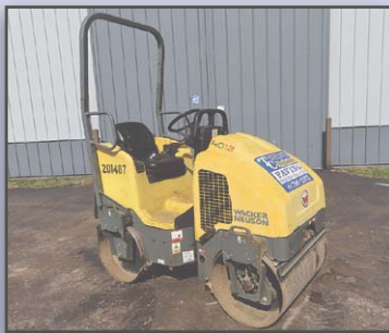
15 WACKER RD12A-90

2015 WACKER Model RD12A-90 Tandem Vibratory Roller , s/n 24235150, powered by Honda V-Twin gas engine and hydrostatic transmission, equipped with 36" smooth drums, dual drum drive, drum cleaners, and water system. In good condition. (Meter Reads 1,250 Hours) (Purchased New)