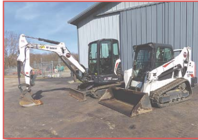
'20 BOBCAT E35i AND '19 T595

1440 COWPATH RD. • HATFIELD, PA 19440 215/361-9099 • Fax: 215/361-9212 www.hunyady.com