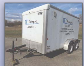
'12 CARMATE 12'

2012 CARMATE Sportster 12' Tandem Axle Cargo Trailer , equipped with aluminum cargo body, fold down rear door, curbside door, ball hitch, spring suspension, 7,000# GVWR, electric brakes, and 205/75R15 tires. In good condition with good tires. (Purchased New)