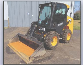
16 JCB 260

2016 JCB Model 260 Skid Steer Loader , s/n 2428700, powered by JCB 4 cylinder diesel engine and 2 speed hydrostatic transmission, equipped with JCB 78" general purpose loader bucket with bolt-on cutting edge, hydraulic coupler, high flow auxiliary hydraulics, power boom, enclosed ROPS cab with heat and air conditioning, and 12x16.5 tires. In good to very good condition with very good tires. (Meter Reads 803 Hours) (Purchased New)