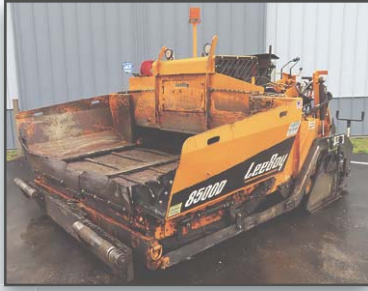
20 LEEBOY 8500D

2020 LEEBOY Model 8500D Crawler Paver , s/n 230081, powered by Kubota 2.6L diesel engine and hydraulic drive, equipped with Legend 8' to 15' electric heated vibratory screed, wash down system, and 12" smooth pads. In good to very good condition with good undercarriage. (Meter Reads 1,140 Hours) (Purchased New)