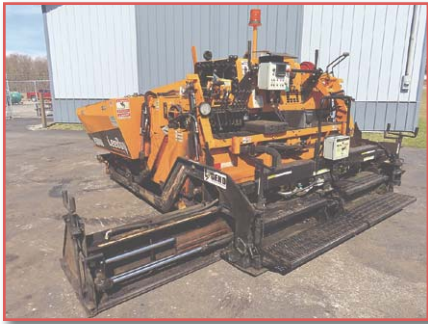
'20 LEEBOY 8500D

PRE-SORTED FIRST CLASS MAIL US POSTAGE PAID UPPER DARBY, PA PERMIT #45