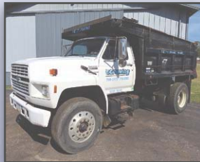
'94 FORD F-800

1994 FORD Model F-800 Single Axle Dump Truck , powered by Cummins 6 cylinder diesel engine and 5 speed transmission with 2 speed rear, equipped with 10' steel dump body with chute, manual sliding tarp, and cab protector, 8" apron, air gate, pintle hitch with air and electric, spring suspension, 33,000# GVWR, and 11R22.5 tires. In good condition with very good tires. (Odometer Reads 213,256 Miles) (Purchased New)