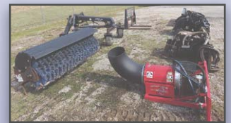
SKID LOADER ATTACHMENTS

• PALADIN 24" Hydraulic Milling Attachment , s/n 435521, with tilt and side shift (Purchased New) • BOBCAT 18" Milling Attachment , s/n 910300469 • 2019 BOBCAT 80" 6-Way Straight Blade , s/n 232115297 (Purchased New) • BOBCAT 68 Hydraulic Angle Broom , s/n 231311175 (Purchased New) • BUFFALO Turbine Hydraulic Debris Blower • 48" Fork Attachment • 66" Bolt-On Bucket Teeth (Skid Steer)