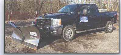
'12 CHEVY 2500HD 4X4

2012 CHEVROLET Model 2500HD Silverado LT, 4x4 Quad Cab Pickup Truck , powered by Vortec 6.0L gas engine and automatic transmission, equipped with 7' bed with spray on liner, Western MVP3, 8'6" stainless steel V-plow with Ultra Mount 2, cross toolbox, tow package, running boards, alloy wheels, power window, locks, mirrors, and seats, cruise control, air conditioning, and 265/70R18 tires. In good condition with good tires. (Odometer Reads 151,384 Miles) (Purchased New)