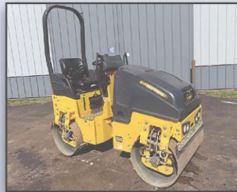
22 BOMAG BW100ADM-5

2022 BOMAG Model BW100 ADM-5 Tandem Vibratory Roller , s/n 101462122065, powered by Kubota 3 cylinder diesel engine and hydrostatic transmission, equipped with 39.5" smooth drums, dual drum drive, drum cleaners, dual frequency vibration, water system, and rollbar. In good condition. (Meter Reads 360 Hours) (Purchased New)