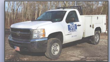
'09 CHEVY 2500HD 4X4

2009 CHEVROLET Model 2500HD, 4x4 Utility Truck , powered by Vortec 6.0L gas engine and automatic transmission, equipped with Reading 8' utility body, tow package, rear window guard, air conditioning, and 245/75R16 tires. In good condition with good tires. (Odometer Reads 143,971 Miles) (Purchased New)