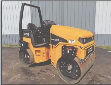
13 JCB VMT380-140

2013 JCB Model VMT380-140 Tandem Vibratory Roller , s/n GATVT380L02804094, powered by Kohler KDW2204/G, 4 cylinder diesel engine and hydrostatic transmission, equipped with 55" smooth drums, dual drum drive, drum cleaners, dual frequency vibration, and water system. In very good condition. (Meter Reads 166 Hours) (Purchased New)