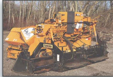
08 LEEBOY L1000T

2008 LEEBOY Model L1000T Crawler Paver , s/n 49495, powered by Hatz 2 cylinder diesel engine and hydraulic drive, equipped with 8' to 12' propane heated vibratory screed, washdown system, and 14" smooth pads. In good condition with good undercarriage. (Meter Reads 1,071 Hours) (Purchased New)