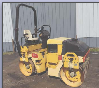
04 DYNAPAC CC122

2004 DYNAPAC Model CC122 Tandem Vibratory Roller , s/n 60117526, powered by Deutz air cooled, 2 cylinder diesel engine and hydrostatic transmission, equipped with 47" smooth drum, dual drum drive, drum cleaners, dual frequency vibration, and water system. In good condition. (Meter Reads 2,611 Hours) (Purchased New)