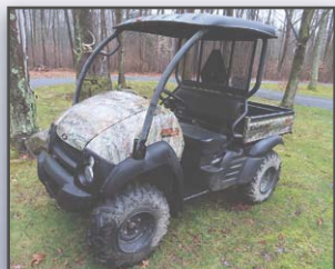
'14 KAWASAKI 610XC MULE

2014 KAWASAKI Model 610XC, 4x4 Mule , powered by Kawasaki gas engine and high low reverse transmission, equipped with manual dump bed, tow package, ROPS canopy, and 26x9.00R12 tires. In good condition with good tires. (Meter Reads 170 Hours) (Purchased New)