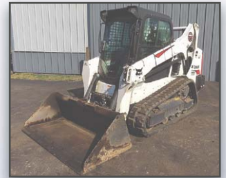
19 BOBCAT T595

2019 BOBCAT Model T595 Crawler Skid Steer Loader , s/n B3NK30196, powered by Bobcat 4 cylinder diesel engine and 2 speed hydrostatic transmission, equipped with 67" general purpose loader bucket with bolt-on cutting edge, hydraulic coupler, high flow auxiliary hydraulics, rear side counterweights, selectable joystick controls, enclosed ROPS cab with heat and air conditioning, and 12.5" rubber tracks. In good to very good condition with good tracks. (Meter Reads 1,355 Hours) (Purchased New)