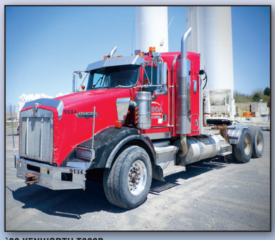
OO KENWORTH T800B

GVWR, air ride suspension, MoRocco headache rack with light bar, wetline, MoRocco model W100, 100,000# 2-speed hydraulic winch with 1 1/4" wire rope and remote control, air slide 5th wheel, aluminum Budd wheels, 1500 watt power inverter, engine brake, double frame, rolling tailboard, cruise control, air conditioning, 15R22.5 front, 11R24.5 rear, and 295/75R22.5 lift tires. In good condition with good to very good tires. (Odometer Reads 335,686 Miles) (New Cummins Reman Engine Installed @ 298,834 Miles on June 5, 2019 – Balance of 4 Year/400,000 Mile Extended Transferrable Warranty Remaining)