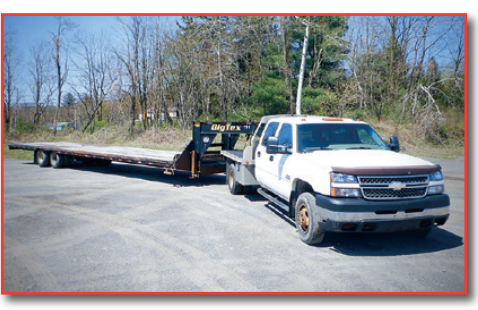
`06 CHEVY 3500LT 4X4 AND `13 BIG TEX 22GN-40