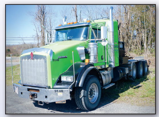
15 KENWORTH T800

Tractor, powered by Cummins ISX15, 550HP diesel engine and Fuller RTL018918B, 18 speed transmission, equipped with 30" sleeper, 46,000# rears, 18,740# front, and 20,000# airlift axle, 84,740#