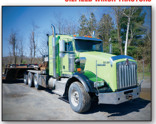
15 KENWORTH T800

2015 KENWORTH Model T800 Tri-Axle Truck Tractor.