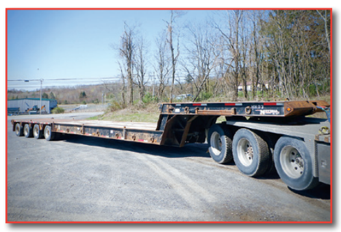
(1) OF (2) `11 NUTTALL 460LB