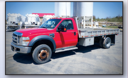
`08 FORD F-450XLT

Truck, powered by Triton V-10, 6.8L gas engine and automatic transmission, equipped with EBY 13' aluminum flatbed with stake sides and toolboxes, dual rear wheels, power windows and locks, and 225/70R19.5 tires. In good condition with good tires.