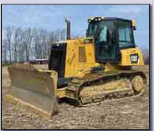
14 CAT D6K XL

with good to very good undercarriage. (Meter Reads 1,445 Hours) (NEW Injector Pump and Supply Pump)