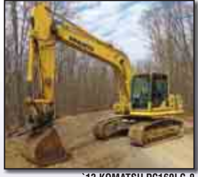
13 KOMATSU PC160LC-8

470400, powered by JD 6 cylinder diesel engine and hydraulic drive, equipped with 12'6" dipper stick, TAG 60" digging bucket. Esco hydraulic coupler, auxiliary hydraulics, rearview camera, counterweight removal system, pattern changer, heated seat, enclosed ROPS cab with heat, and 35.5" TBG pads. In good condition with good undercarriage. (Meter Reads 6,690 Hours) (Less Than 250 Hours on NEW