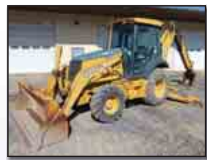
01 JOHN DEERE 310SG 4X4 E-HOE