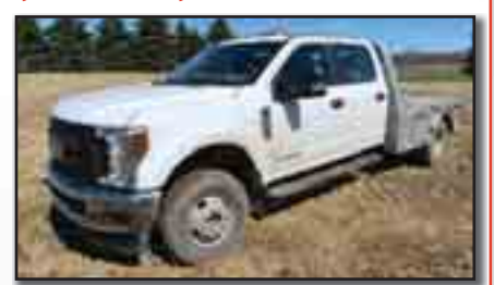
19 FORD F-350XL 4X4

2019 FORD Model F-350XL, 4x4 Crew Cab Flatbed Truck, powered by Powerstroke 6.7L diesel engine and automatic transmission, equipped with CM 9'6" aluminum flatbed with 5th wheel pin, storage bins and stake pockets, tow package,