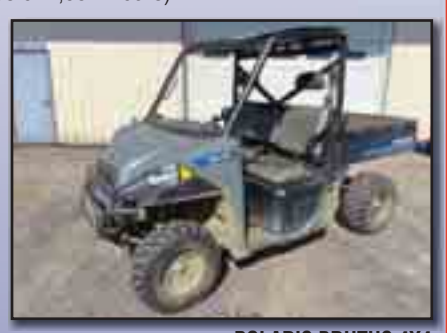
POLARIS BRUTUS 4X4

POLARIS Brutus 4x4 Side by Side, powered by Yanmar 3 cylinder diesel engine and 2 speed hydrostatic transmission, equipped with manual dump bed, tow package, ROPS canopy, and 25x11x12 NHS tires. In good condition with good tires. (Odometer Reads 1,070 Miles)