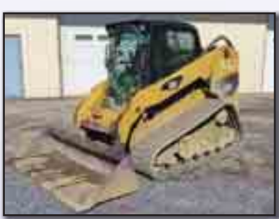
09 CAT 279C