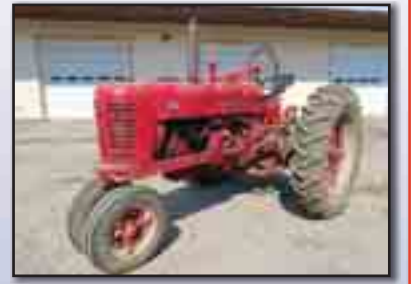
`56 IH MCCORMICK FARMALL 300

wheel weights, 6.00x16 front and 13.6x38 rear tires. In good condition with good tires. (Meter Reads 4,318 Hours)