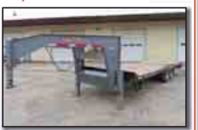
18 B WISE THDG-2416

2018 B WISE Model THDG-2416 Tandem Axle Gooseneck Trailer, equipped with 24' level deck, 20" folding ramp, 98" deck width, 102" overall width, stake pockets, chain dogs, electric brakes, spring suspension, 7,000# axles, 16,800# GVWR, and 235/80R16 tires. In good condition with good