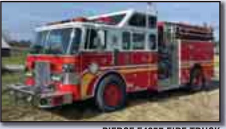
PIERCE E4057 FIRE TRUCK

powered by diesel engine and automatic transmission, equipped with 1,750 GPM pump capacity, water cannon, rider cab, 24,000# rear and 16,200 front axle, 40,200# GVWR, and