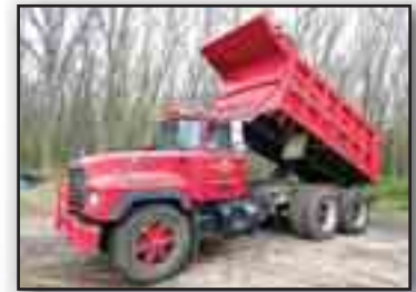
'92 MACK RD690SX

1992 MACK Model RD690SX Tandem Axle Dump Truck , powered by Mack E7-300, 300HP diesel engine and Maxitorque T2070, 7 speed extended range transmission, equipped with 14'6" steel dump body with electric tarp, Mack camelback suspension, engine brake, tow package (no air), air conditioning, and 11.00R24 tires. In good condition with fair tires. (70,000# GVWR)