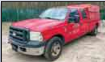
'06 FORD F-250XL

2008 FORD Model F-150XLT, 4x4 Crew Cab Pickup Truck , powered by Triton V-8 gas engine and automatic transmission, equipped with 5'6" bed with liner, tow package, aluminum wheels, power windows, locks, and mirrors, air conditioning, and 265/70R17 tires. In fair to good condition with fair tires.