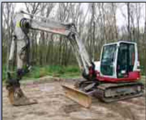
'15 TAKEUCHI TB290

STRICKLAND Pulverizer (Komatsu Excavator)