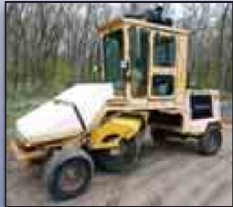
'06 WALDON SM-250

2006 WALDON Model SM-250 Self Propelled Broom , s/n 30975-012, powered by 4 cylinder diesel engine and hydrostatic transmission, equipped with 7' hydraulic angle broom, water system, enclosed cab with heat, and 225/75R15 tires. In good condition with fair tires.