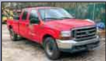
'00 FORD F-350XL

2006 FORD Model F-250XL Super Duty Crew Cab Pickup Truck , powered by Powerstroke 6.0L diesel engine and automatic transmission, equipped with 8' bed, Reading utility cap, fuel tank with 12 volt electric pump, tow package, and 245/75R16 tires. In fair condition with fair tires.