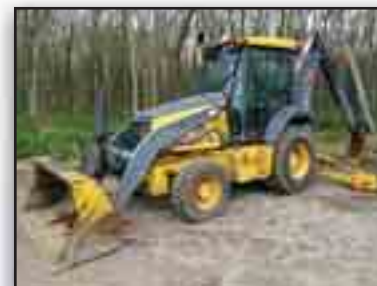
'09 JOHN DEERE 310SJ

2009 JOHN DEERE Model 310SJ, 4x4 Tractor Loader Extend-A-Hoe , s/n 171773, powered by JD diesel engine and powershift transmission, equipped with general purpose loader bucket with bolt-on cutting edge, 18" digging bucket, rear manual coupler, pilot controls, pattern changer, ride control, enclosed ROPS cab with heat and air conditioning (AC belt removed), 12.5/80-18 front and 19.5-24 rear tires. In good condition with very good tires.