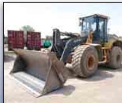
'09 JOHN DEERE 644K

2009 JOHN DEERE Model 644K Rubber Tired Loader , s/n 622676, powered by JD 6068 diesel engine and powershift transmission, equipped with JRB 3.5 cubic yard hydraulic 4-in-1 loader bucket with bolt-on cutting edge, JRB hydraulic coupler, auxiliary hydraulics, enclosed ROPS cab with air conditioning, and 23.5R25 tires. In good condition with good to very good front and fair rear tires. (2) 20.5-25 Tires