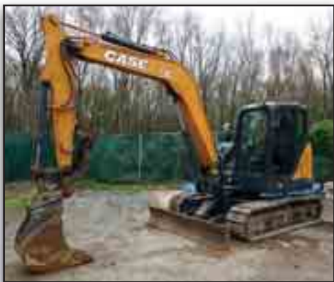
'18 CASE CX80C

2018 CASE Model CX80C Hydraulic Excavator , s/n DAC080K6NJS6B2062, powered by Isuzu diesel engine and hydraulic drive, equipped with 7' dipper stick, swing boom, Strickland 18" digging bucket, Strickland 16" hydraulic thumb, Strickland hydraulic coupler, auxiliary hydraulics, 77" backfill blade, rearview camera, enclosed ROPS cab with heat and air conditioning, and 17.5" rubber street pads. In good condition with fair to poor rubber pads. (Purchased New)