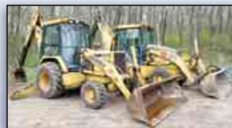
'03 JOHN DEERE 410G AND '94 310D

s/n 923962, powered by JD diesel engine and powershift transmission, equipped with hydraulic left side dump bucket, 24" digging bucket, front hydraulic coupler, front auxiliary hydraulics, 2-stick controls, ride control, enclosed ROPS cab with heat, 12.5/80-18 front and 21L-24 rear tires. In good condition with good to very good tires.