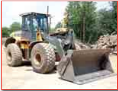
'09 JOHN DEERE 644K

PRE-SORTED FIRST CLASS MAIL US POSTAGE PAID UPPER DARBY, PA PERMIT #45