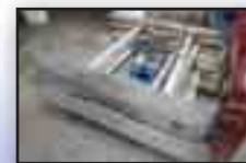
GME TRENCH SHORING

TARGET PAC IV Walk Behind Concrete Saw, s/n 213016, 16HP gas • (2) Gas Powered Plate Compactors • INGERSOLL RAND MX90 Pneumatic Paving Breaker • (4) GME Aluminum Speed Shoring and Manual Pump • Sewer Inlets and Grates • UNUSED Broom Bristles