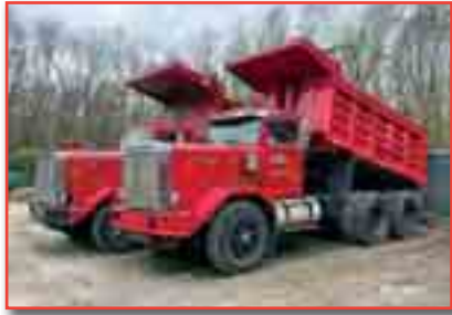
'87 AND '86 AUTOCARS

1440 COWPATH RD. • HATFIELD, PA 19440 215/361-9099 • Fax: 215/361-9212 www.hunyady.com