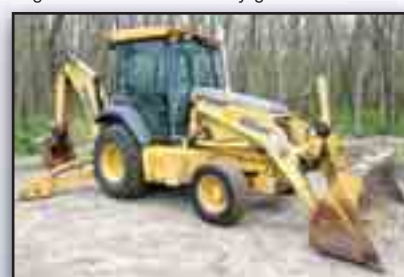
'05 JOHN DEERE 310SG

2005 JOHN DEERE Model 310SG, 4x4 Tractor Loader Extend-A-Hoe , s/n 949493, powered by JD diesel engine and powershift transmission, equipped with general purpose loader bucket with bolt-on cutting edge, 24" digging bucket, 2-stick controls, enclosed ROPS cab with heat, 12.5/80-18 front and 19.5-24 rear tires. In good condition with fair tires.