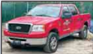
'08 FORD F-150XLT 4X4

1997 GMC Model 3500SL, 4x4 Utility Truck , powered by 6.5L Turbo diesel engine and automatic transmission, equipped with Stahl 9' open utility body, light bar, dual rear wheels, tow package, air conditioning, and 225/75R16 tires. In fair condition with fair tires.