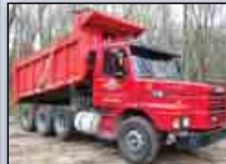
'87 SCANIA 112M

1987 SCANIA Model 112M Tri-Axle Dump Truck , powered by Scania intercooled 341HP diesel engine and 10 speed transmission, equipped with 15'6" steel dump body with electric tarp and single chute, spring suspension, air conditioning, 315/80R22.5 front tires, 295/75R22.5 lift, and 12R22.5 rear tires. In good condition with fair tires. (80,000# GVWR)