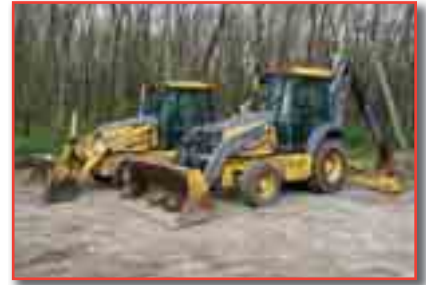
JOHN DEERE 310SJ AND G