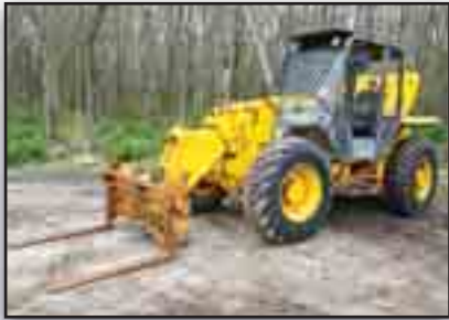
'96 JCB 508-40

1996 JCB Model 508-40, 8,000# Rough Terrain Telescopic Forklift , s/n 0576164, powered by 4 cylinder diesel engine and shuttle transmission, equipped with 40' lift height, 3-section telescopic boom, 48" forks, 96" general purpose loader bucket with bolt-on cutting edge, enclosed cab, and 15.5-25 tires. In fair to good condition with good tires.