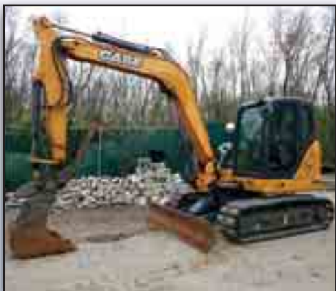
'17 CASE CX80C

2017 CASE Model CX80C Hydraulic Excavator , s/n DAC080K6NHS6B1701, powered by Isuzu diesel engine and hydraulic drive, equipped with 7' dipper stick, swing boom, Strickland 18" digging bucket, 18" hydraulic thumb, Strickland hydraulic coupler, auxiliary hydraulics, 77" backfill blade, rearview camera, enclosed ROPS cab with heat and air conditioning, and 17.5" rubber street pads. In good condition with good to very good rubber pads. (Purchased New)