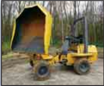
'99 BENFORD 2300YSHR

1999 BENFORD Model 2300YSHR, 4x4 Rotating Dumper , s/n SLBDRNOZEX12HJ006, powered by 3 cylinder diesel engine and hydrostatic transmission, equipped with swivel dump body and ROPS post. In fair to good condition with fair to good tires.