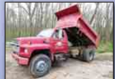
'88 FORD F-800

1996 GMC Model 3500HD SL Single Axle Dump Truck , powered by 6.5L diesel engine and 5 speed transmission, equipped with 8' steel dump body with manual tarp and single chute, PTO hoist, behind cab tool box, dual rear wheels, tow package, and 225/70R19.5 tires. In fair condition with fair tires.