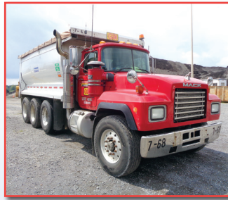
(1) OF (10) ALUMINUM TUB

(2) 2000 MACK RD688S, Mack E7-400, 400HP diesel engine and Fuller 8LL, 10 spd trans, 44,000# rears, 18,000# front and lift axles, Everlite Alumatech 16'9" aluminum tub style dump body with 2-piece tailgate with chute and power sliding tarp, air ride suspension, Jacobs 2-stage engine brake, aluminum wheels, heated mirrors, cruise control, ac, 315/80R22.5 front and lift, and 11R24.5 rear tires. In good condition with good tires.