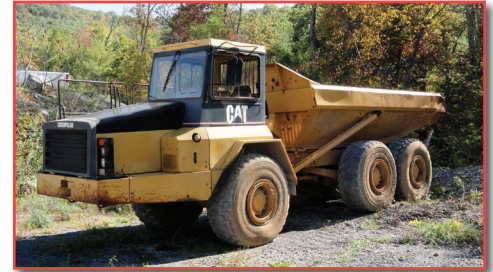
'96 CAT D250E