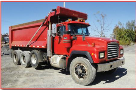
(1) OF (3) STEEL BODY

PRE-SORTED FIRST CLASS MAIL US POSTAGE PAID UPPER DARBY, PA PERMIT #45