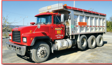
(1) OF (8) ALUMINUM BOX

1440 COWPATH RD. • HATFIELD, PA 19440 215/361-9099 • Fax: 215/361-9212 www.hunyady.com