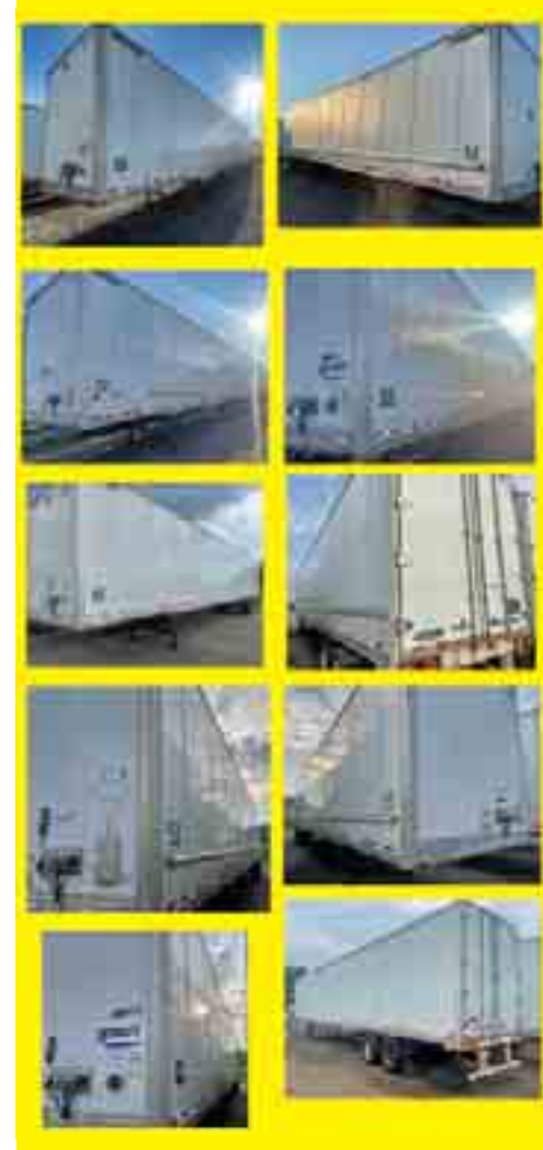
(10)2011 GREAT DANE equipped with 53ft. Van body, 13ft. 6in. height, rear swing doors, air ride suspension, tandem axle.