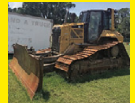
2012 CAT D6NLGP SN:PBA00539 powered by Cat diesel engine, equipped with EROPS, air, 6 way blade, drawbar.