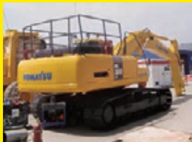
KOMATSU PC300LC SN:55016 powered by Komatsu diesel engine, 232hp, equipped with Cab, air, heat, reach boom, digging bucket, long undercarriage.