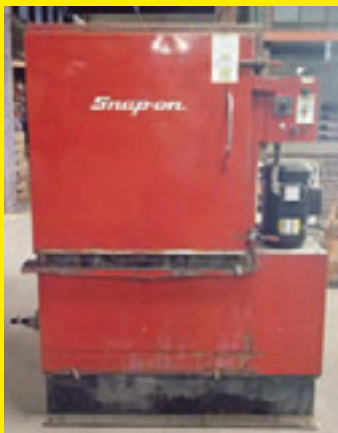
SNAP ON PARTS WASHER