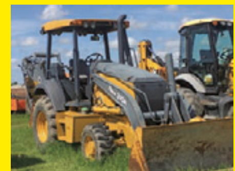
2015 JOHN DEERE 310K SN:271549 4x4, powered by John Deere 4.5L diesel engine, equipped with OROPS, 1.13 yard GP front bucket, rear digging bucket, Goodyear 19.5L x 24, 12-16.5 rears. Emissions Warranty 3000 hours or 10-29-19.