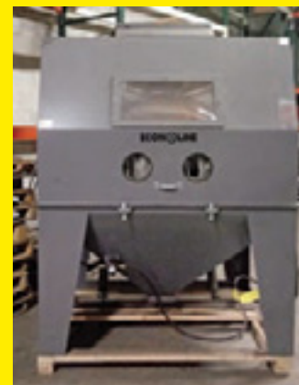
ECONOLINE SANDBLASTING CABINET 4X4 WORK SPACE