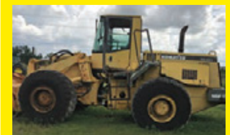
KOMATSU WA420-3 SN:A31039 powered by Komatsu diesel engine, equipped with EROPS, air, GP bucket, 26.5 x 25 rubber.