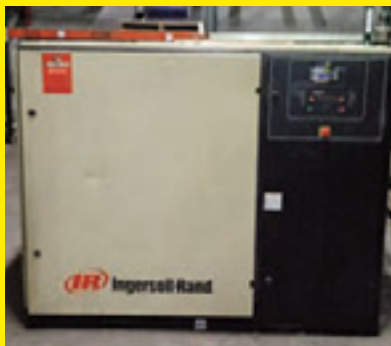
(2) INGERSOLL RAND HP50-PE AIR COMPRESSOR