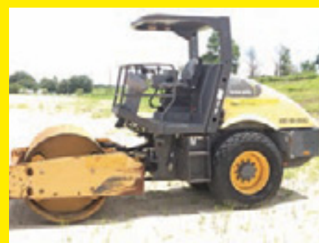
2012 VOLVO SD70D SN:226568 powered by diesel engine, equipped with EROPS, 66in. Smooth drum, vibratory drum, drum drive.