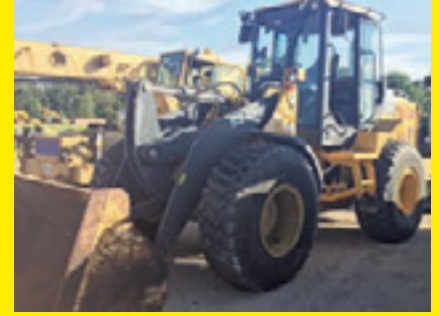
2015 JOHN DEERE 524K SN:JCE649168 powered by John Deere diesel engine, equipped with EROPS, air, quick coupler, GP bucket, 20.5 x 25 rubber.