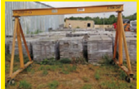
MOVABLE A FRAME 2 TON W/ TROLLEY & 2,000LB HOIST