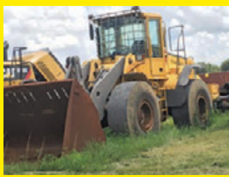
VOLVO L120E SN:EV64773 powered by diesel engine, equipped with EROPS, air, heat, GP bucket, solid rubber, 2,388 hours.