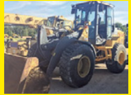
2015 JOHN DEERE 524K SN:JCE649168 powered by John Deere diesel engine, equipped with EROPS, air, quick coupler, GP bucket, 20.5 x 25 rubber.