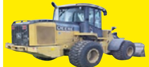
2014 JOHN DEERE 524K SN:CEE659927 powered by John Deere diesel engine, equipped with OROPS, GP bucket, 20.5 x 25 rubber.