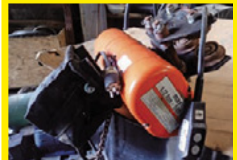
CM 1/2 TON ELECTRIC HOIST