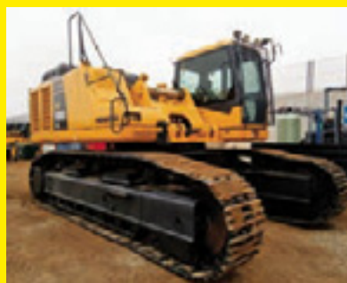
2011 KOMATSU PC600LC-8 SN:55277 powered by Komatsu diesel engine, equipped with Cab, air, reach boom, digging bucket, long undercarriage.