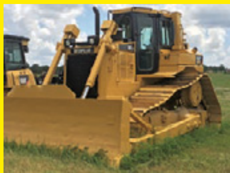
2007 CAT D6TLGP SN:KJL00477 powered by Cat diesel engine, equipped with EROPS, air, heat, Straight blade w/ hydraulic tilt.