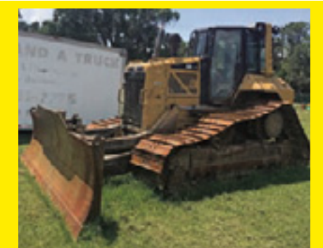
2012 CAT D6NLGP SN:PBA00539 powered by Cat diesel engine, equipped with EROPS, air, 6 way blade, drawbar.