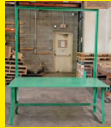
HEAVY DUTY 3FT. X 6FT. STEEL WORK BENCH