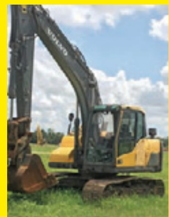
2013 VOLVO EC140DL SN:DC00210252 powered by diesel engine, 106.5hp, equipped with Cab, air, heat, auxiliary hydraulics, digging bucket, long undercarriage.