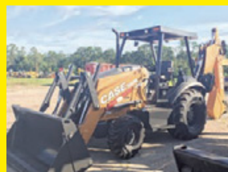
(2) UNUSED CASE 580N 4x4, powered by Case diesel engine, equipped with OROPS, powershuttle, extendahoe, switchable pilot controls, Case mechanical quick coupler, 4-in-1 front bucket, rear digging bucket.