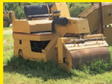
LEEBOY 400 SN:3769574 powered by diesel engine, equipped with 40in. Front smooth drum, 44in. Rear smooth drum.