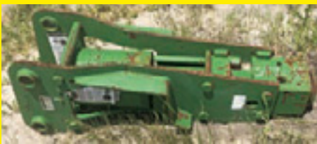
NEW ROCKRAM BRH-125