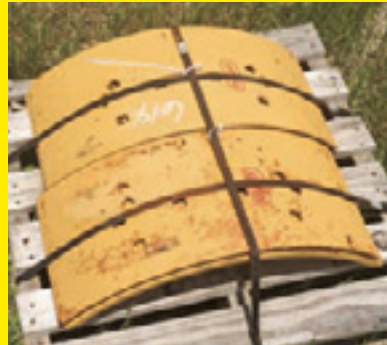
(2) NEW TERAN BIT OVERLAY (13X235X565) MATERIAL Q345 FOR MOTORGRADER CAT 112, 12, 12G, 120,130,140, 120G, 120H, 130G, 135H, 140G, 140H, 143H.