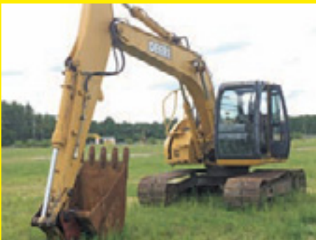
JOHN DEERE 135CRTS SN:300424 powered by John Deere diesel engine, equipped with Cab, air, auxiliary hydraulics, zero tail swing, digging bucket.