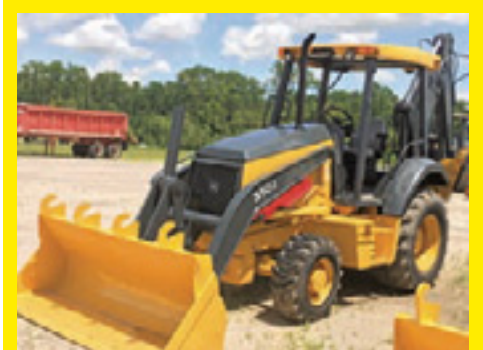
2011 JOHN DEERE 310J 4x4 SN:9587 powered by John Deere diesel engine, equipped with OROPS, rear auxiliary hydraulics, GP front bucket, rear digging bucket.