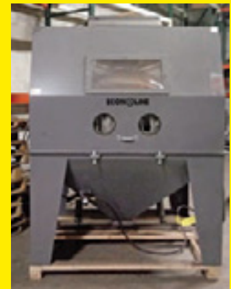
ECONOLINE SANDBLASTING CABINET 4X4 WORK SPACE