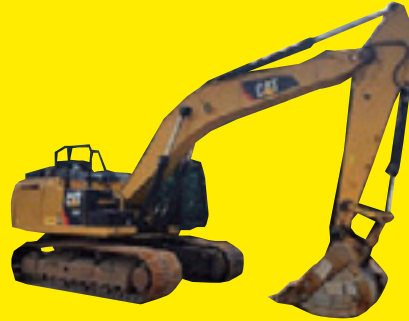
2013 CAT 336EL SN:FJH00424 powered by Cat C9.3 diesel engine, equipped with Cab, air, heat, reach boom, 10ft. 6in. stick, 32in. TBG pads, 60in. Digging bucket, long undercarriage.