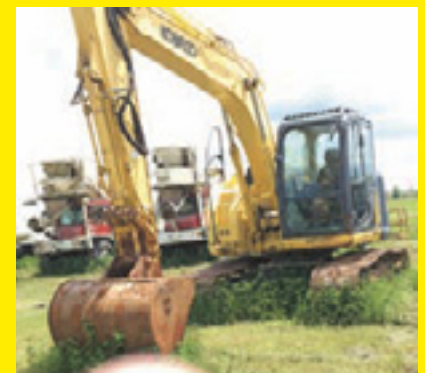
2013 KOBELCO SK140 SN:608689 powered by diesel engine, equipped with Cab, air, heat, digging bucket, 6,167 hours.