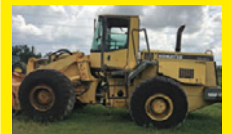
KOMATSU WA420-3 SN:A31039 powered by Komatsu diesel engine, equipped with EROPS, air, GP bucket, 26.5 x 25 rubber.