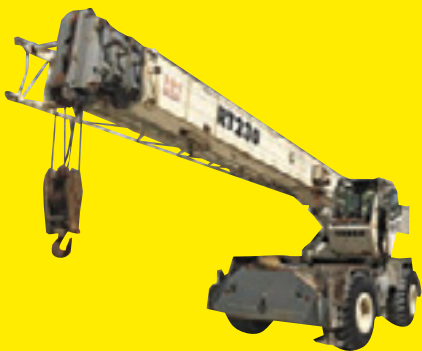
TEREX RT230 SN:11258 4x4, powered by diesel engine, equipped with Cab, 30 ton lift capacity, (4) hydraulic outriggers, rough terrain tires.