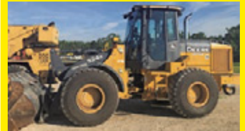
2015 JOHN DEERE 524K SN:JEE63526 powered by John Deere diesel engine, equipped with EROPS, air, quick coupler, GP bucket, 20.5 x 25 rubber.