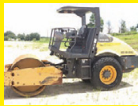
2012 VOLVO SD70D SN:226568 powered by diesel engine, equipped with EROPS, 66in. Smooth drum, vibratory drum, drum drive.