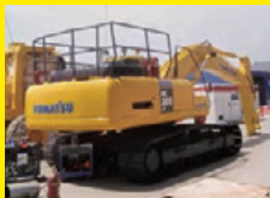
KOMATSU PC300LC SN:55016 powered by Komatsu diesel engine, 232hp, equipped with Cab, air, heat, reach boom, digging bucket, long undercarriage.