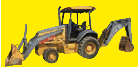
2014 JOHN DEERE 310K SN:260596 4x4, powered by John Deere 4.5L diesel engine, equipped with OROPS, pilot controls, 1.13 yard GP front bucket, rear digging bucket, Firestone 19.5L x 24, 12-16.5 tires, Extended Warranty (Comprehensive) 5000 hours or 12-26-19/ Extended Warranty 3000 hours or 12-28-19.