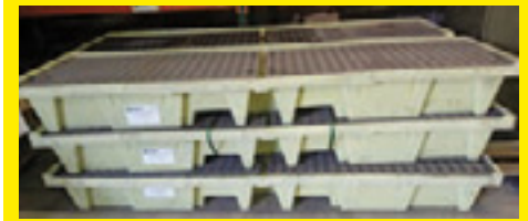
(6) SPILL CONTAINMENT holds 4-55 gallon drums. 2009 STIHL TS420 14IN. CUTOFF SAW SN:169499069