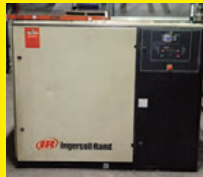
(2) INGERSOLL RAND HP50-PE AIR COMPRESSOR