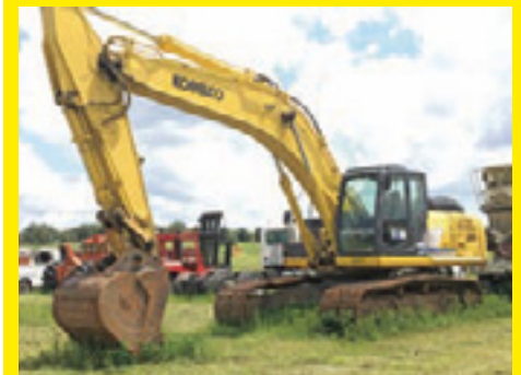
2012 KOBELCO SK350LC-9 SN:YC12U2459 powered by diesel engine, 264hp, equipped with Cab, air, heat, reach boom, digging bucket, long undercarriage.