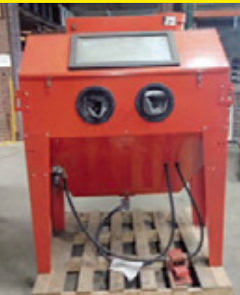
BLACK BULL SBC-420 SANDBLASTING CABINET 17 X 47IN. WORKING AREA