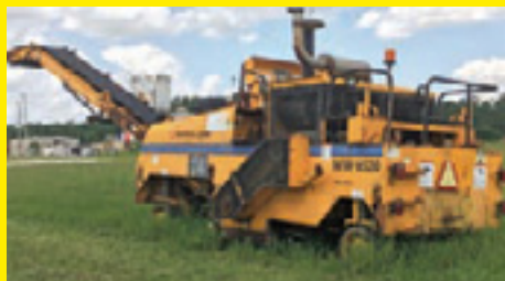
INGERSOLL RAND 6520 powered by diesel engine, conveyor.