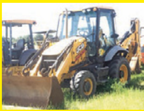
2012 JCB 3CX14 SN:2017623 4x4, powered by diesel engine, equipped with EROPS, air, extendahoe, front and rear auxiliary hydraulics, GP front bucket, rear digging bucket.