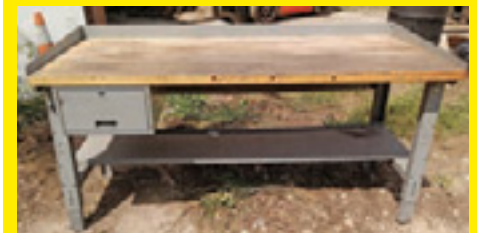
(2) LIGHT DUTY WORK TABLES W/ WOOD TOPS SCAFFOLDING W/ WHEELS ADJUSTABLE STANDS & 7-ALUMINUM PLANKS