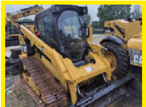
2015 CAT 299D2XHP SN:JST1356 powered by Cat diesel engine, equipped with EROPS, air, 2-speed, high flow auxiliary hydraulics, steel pads, 84in. GP bucket, 9,450lb tipping load, 1,400 hours.