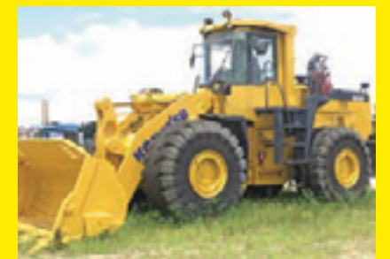
KOMATSU WA500 SN:52201 powered by Komatsu diesel engine, 315hp, equipped with EROPS, air, heat, GP bucket, 26.5 x 25 rubber.