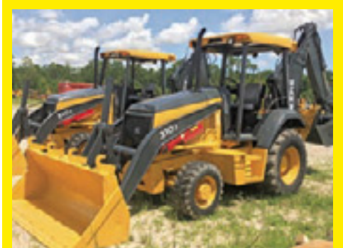
2012 JOHN DEERE 310J SN:6303 4x4, powered by John Deere diesel engine, equipped with OROPS, GP front bucket, rear digging bucket.