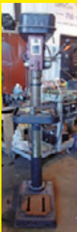
NORTHERN INDUSTRIAL 9 SPEED DRILL PRESS 120 volts, 1 1/4in. Chuck 1.5hp.