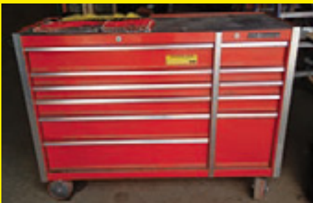
US GENERAL TOOL BOX W/ 11-DRAWERS OF MILLING, LATHE BITS, & TOOLING