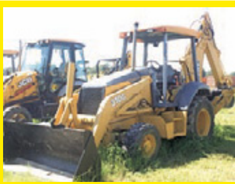
JOHN DEERE 310G SN:GX893472 powered by John Deere diesel engine, equipped with EROPS, GP front bucket, rear digging bucket.