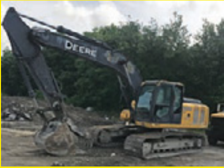
2011 JOHN DEERE 200DLC SN:512631 powered by John Deere diesel engine, equipped with Cab, air, New 42in. Digging bucket, long undercarriage.