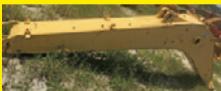
KOMATSU PC120 BOOM PAIR OF EXCAVATOR CHAIN