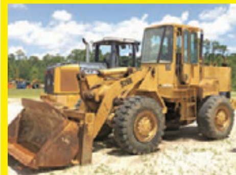
CAT 926E SN:94Z02283 powered by Cat diesel engine, equipped with EROPS, heat, quick coupler, GP bucket, 17.5 x 25 rubber. Forks Sell Separately.