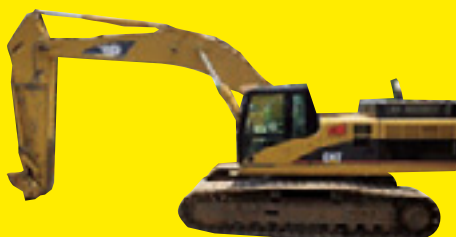
CAT 345CL SN:JPW00621 powered by Cat C13 ACERT diesel engine, equipped with Cab, air, 22ft. 8in. Reach boom, 12ft. 10in. Stick, counterweight removal device, 36in. Pads, Cat hydraulic quick coupler, 42in. Digging bucket, long undercarriage. $30,000 on recent hydraulic work with local Cat dealer.