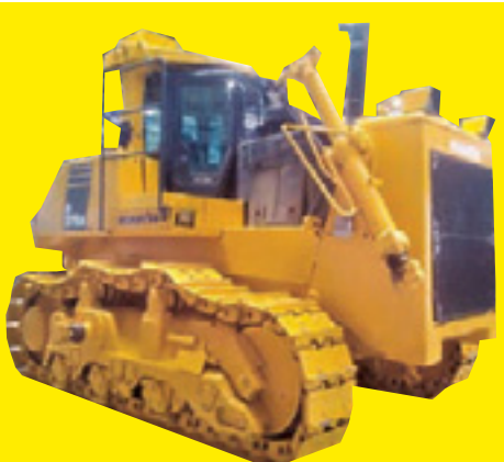
KOMATSU D375A-5 SN:18289 powered by Komatsu diesel engine, 515hp, equipped with EROPS, air, Straight blade w/ tilt, rear ripper.