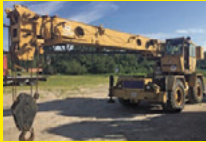
GROVE RT528E SN:68919 4x4, powered by diesel engine, equipped with Cab, 28 ton lift capacity, (4) hydraulic outriggers, rough terrain tires.