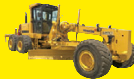
KOMATSU GD825A-2 SN:12144 powered by Komatsu diesel engine, 280hp, equipped with EROPS, air, moldboard, hydraulic sideshift, TIP control, rear ripper.