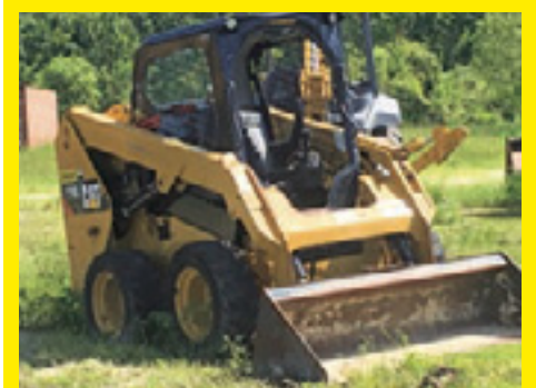
2014 CAT 236D SN:BGZ00904 powered by Cat diesel engine, equipped with rollage, auxiliary hydraulics, mechanical quick coupler, GP bucket.