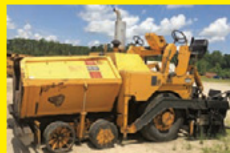
BLAW KNOX PF161 SN:1610201 powered by John Deere diesel engine, equipped with 8ft.-16ft. New heated screen.