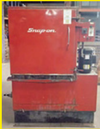
SNAP ON PARTS WASHER