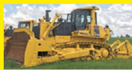
KOMATSU D375A-5 SN:18197 powered by Komatsu diesel engine, 515hp, equipped with EROPS, air, Straight blade w/ tilt, rear ripper.